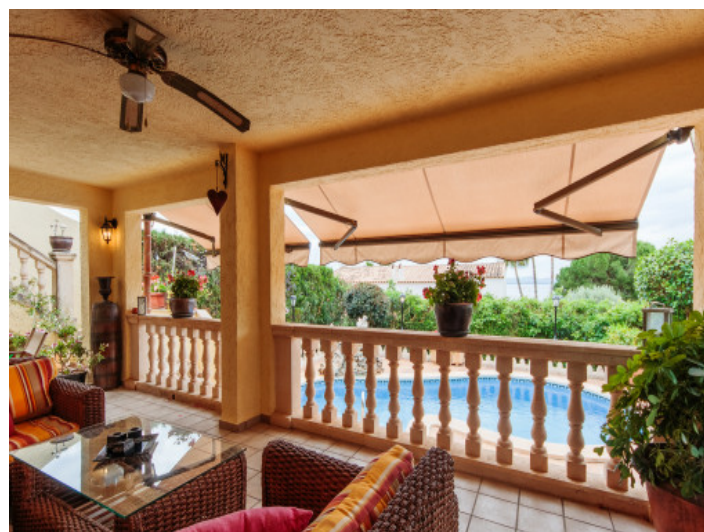
Covered terrace overlooking the pool