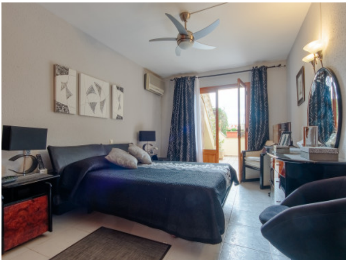
Bedroom with access to the terrace