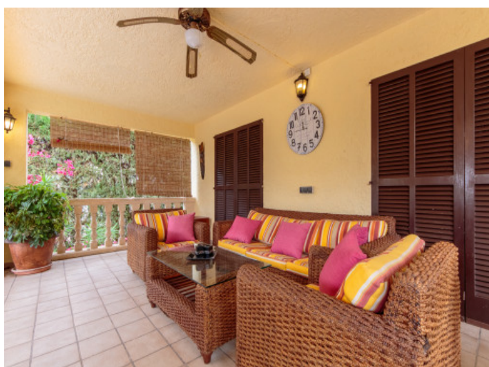
Outdoor lounge area