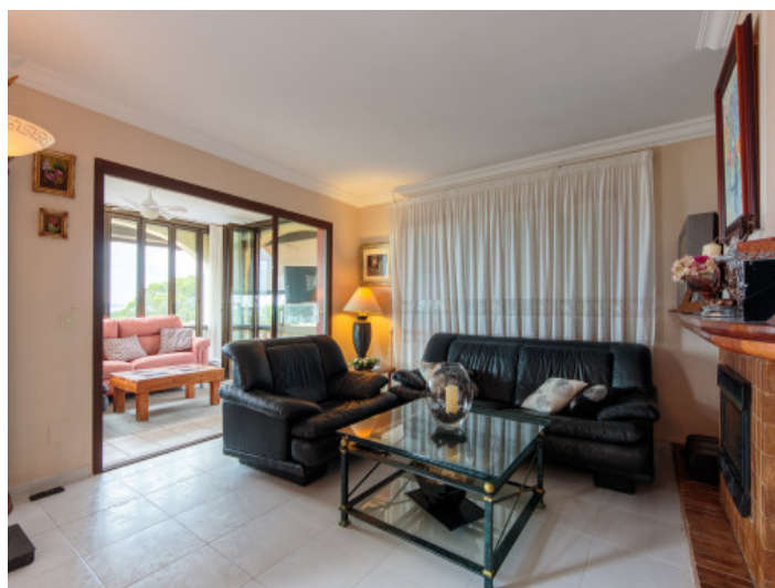
Large living area