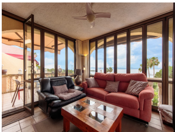
Additional living area

All information is correct to the best of our knowledge. Errors and prior sale excepted. This prospectus is purely for information purposes. Only the notarized deed of sale is legally binding.