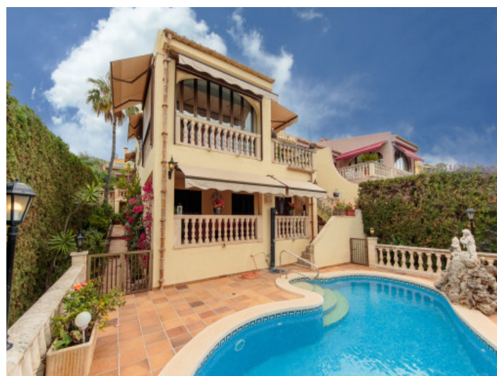
Façade of the house

All information is correct to the best of our knowledge. Errors and prior sale excepted. This prospectus is purely for information purposes. Only the notarized deed of sale is legally binding.