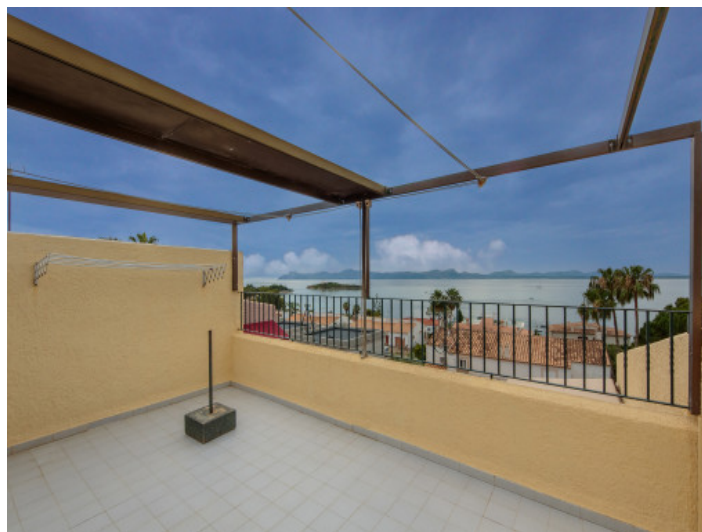
Roof terrace with sea views