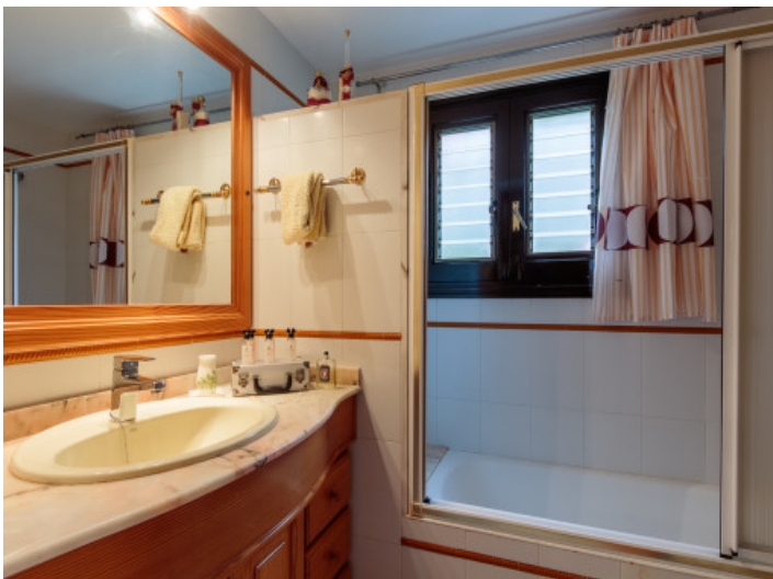
Bathroom with a bathtub