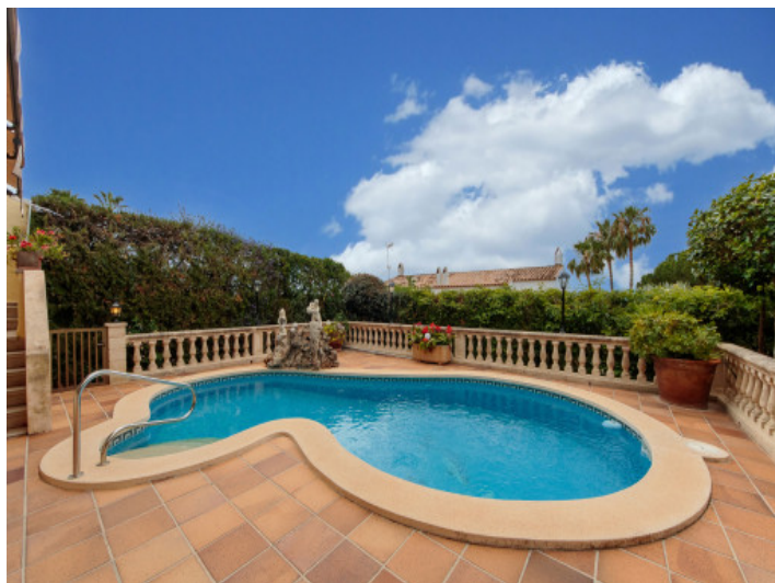
Well-maintained pool area