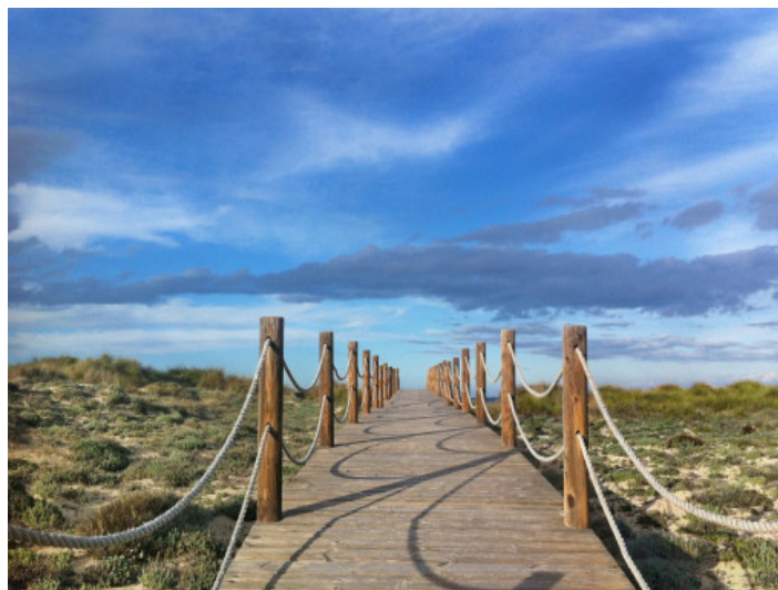
Wooden path leading to the sea