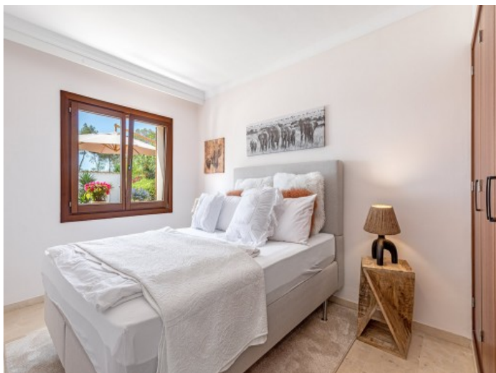
One of 3 double bedrooms