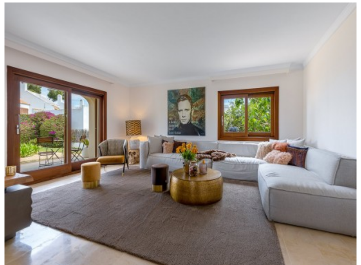
Cozy living area