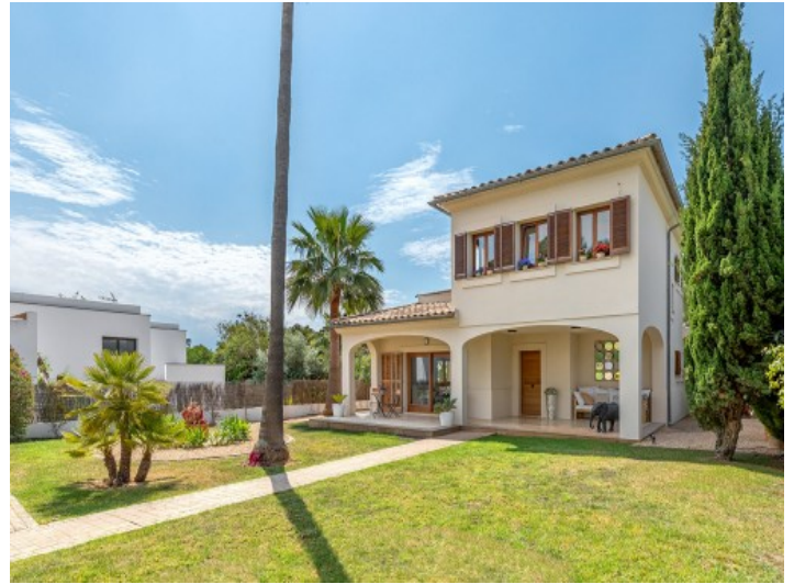
Large, green garden in the front