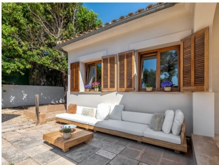
Modern chill out area on the terrace