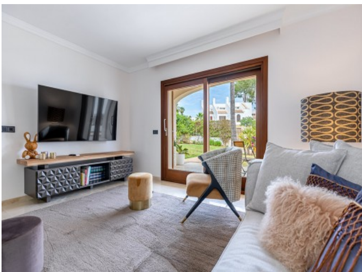
Alternative view of the living area