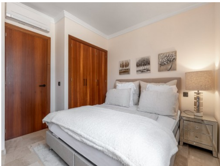
One of 3 double bedrooms