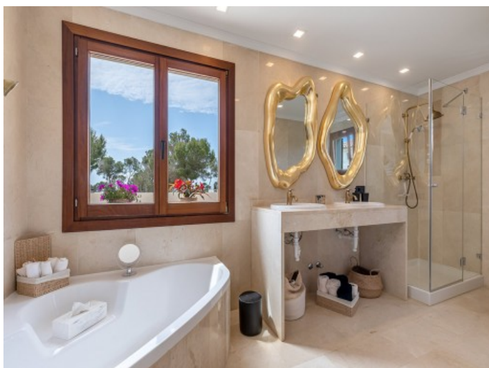
Noble bathroom with large bath tub