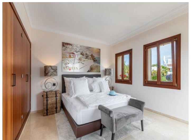
One of 3 double bedrooms

All information is correct to the best of our knowledge. Errors and prior sale excepted. This prospectus is purely for information purposes. Only the notarized deed of sale is legally binding.