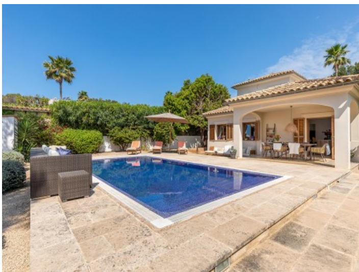
Sunny pool area

All information is correct to the best of our knowledge. Errors and prior sale excepted. This prospectus is purely for information purposes. Only the notarized deed of sale is legally binding.