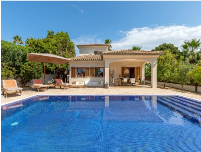
Inviting pool area of the villa