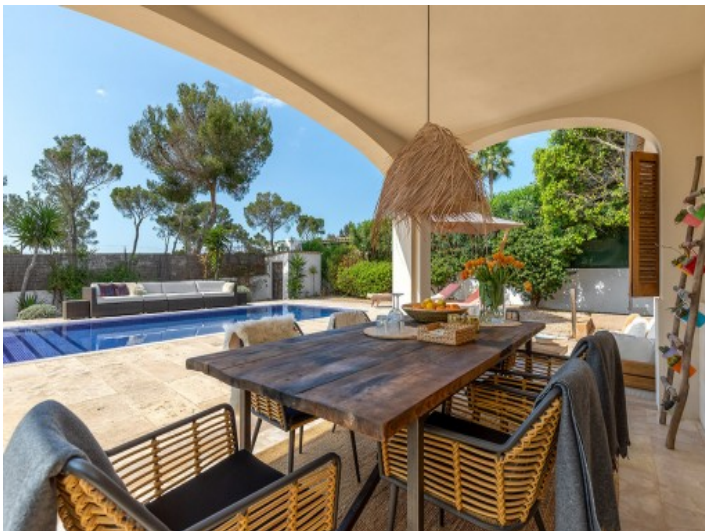
Covered dining area on the terrace