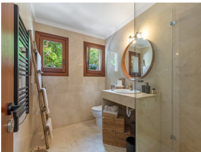
Bathroom with walk-in shower