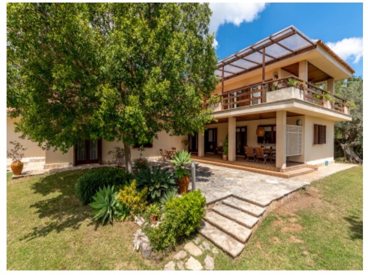
Finca and terrace