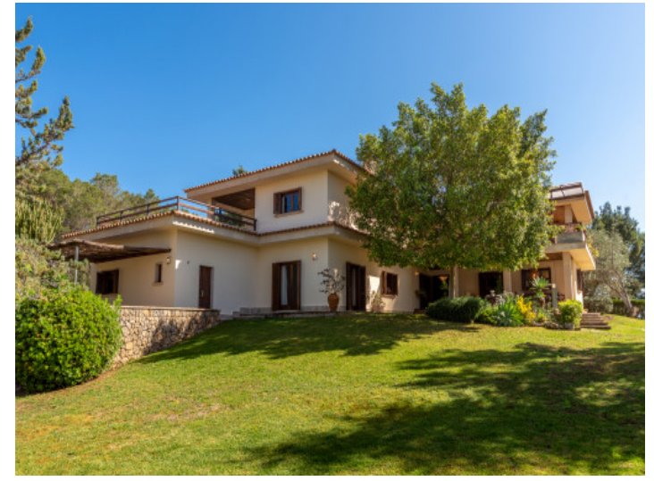
Exterior view and garden