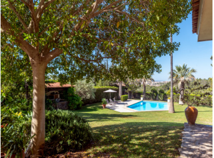
Garden and pool