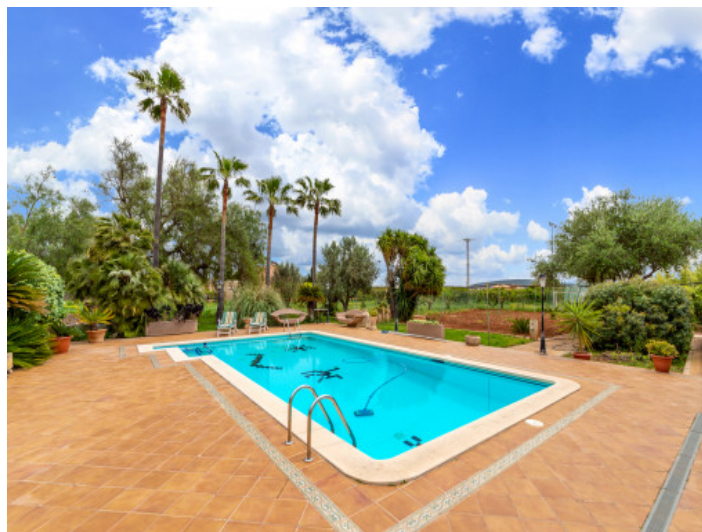
Mediterranean pool area