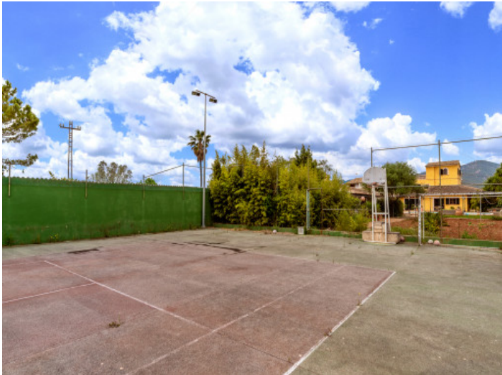
Private tennis court