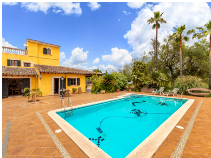
Large swimming pool