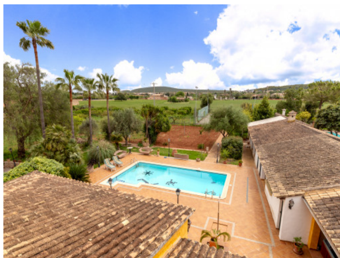
Spectacular views over the landscape