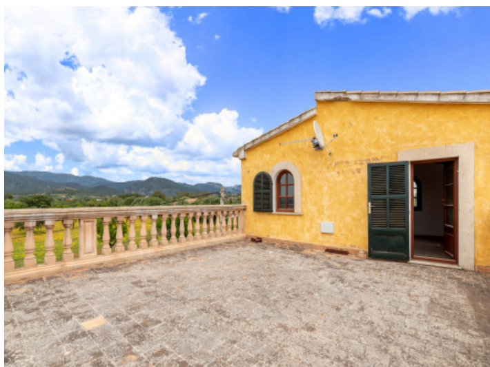
Large upper terrace