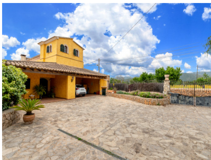
Large driveway to the finca

All information is correct to the best of our knowledge. Errors and prior sale excepted. This prospectus is purely for information purposes. Only the notarized deed of sale is legally binding.