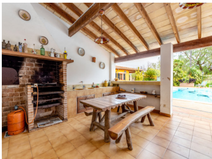
Large covered bbq terrace