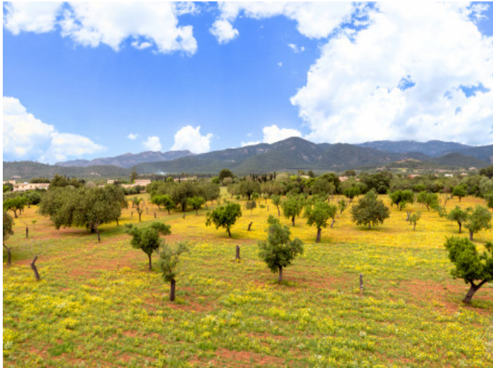
Large plot with fruit trees