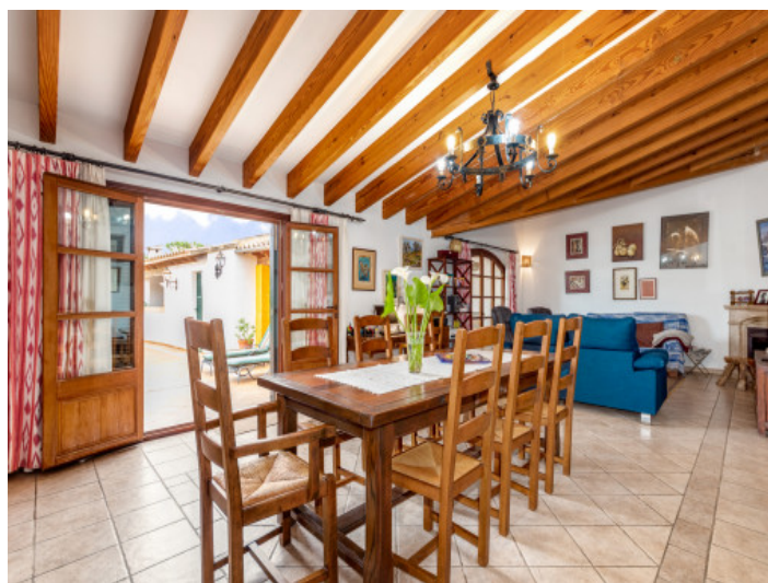
Open living and dining area with terrace access