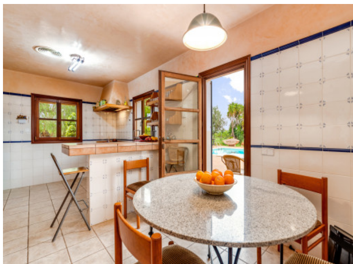
Country house kitchen with dining area