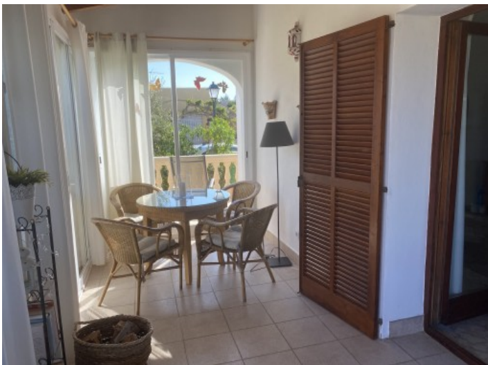
Small winter garden