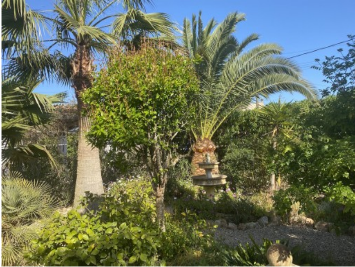
View of the idyllic garden