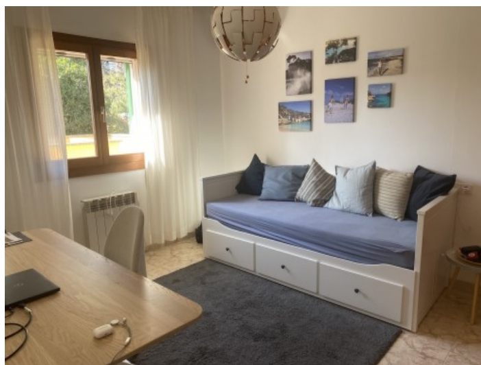
One of 2 double bedrooms