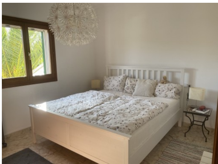
One of 2 double bedrooms