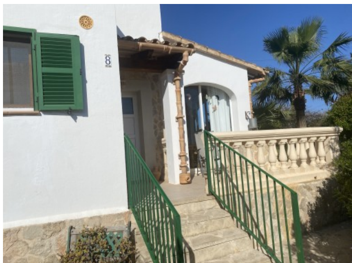
Exterior view of the chalet