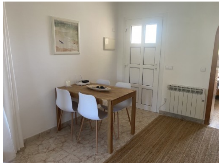
View of the dining area