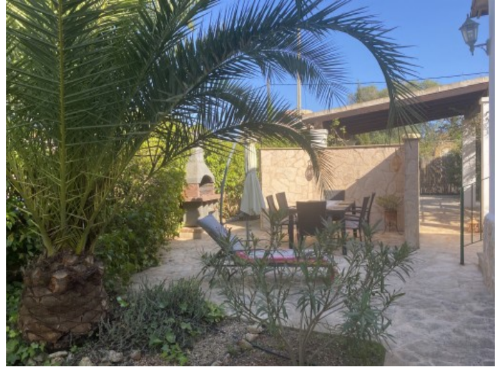
Inviting barbecue area in the garden