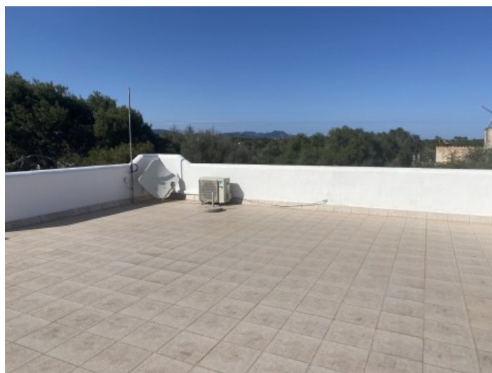
Spacious roof terrace