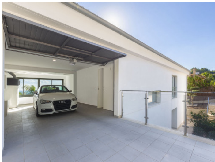
Garage of the villa

All information is correct to the best of our knowledge. Errors and prior sale excepted. This prospectus is purely for information purposes. Only the notarized deed of sale is legally binding.