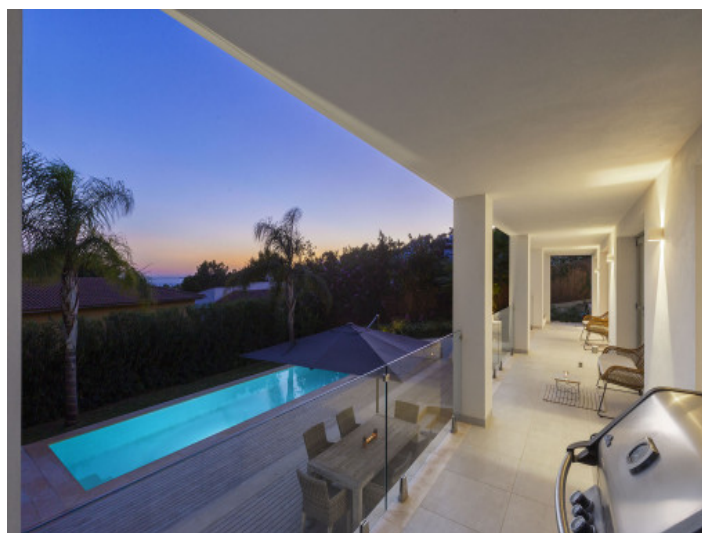
Balcony by night