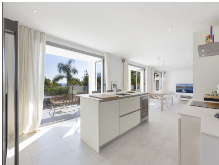
Kitchen with cooking island