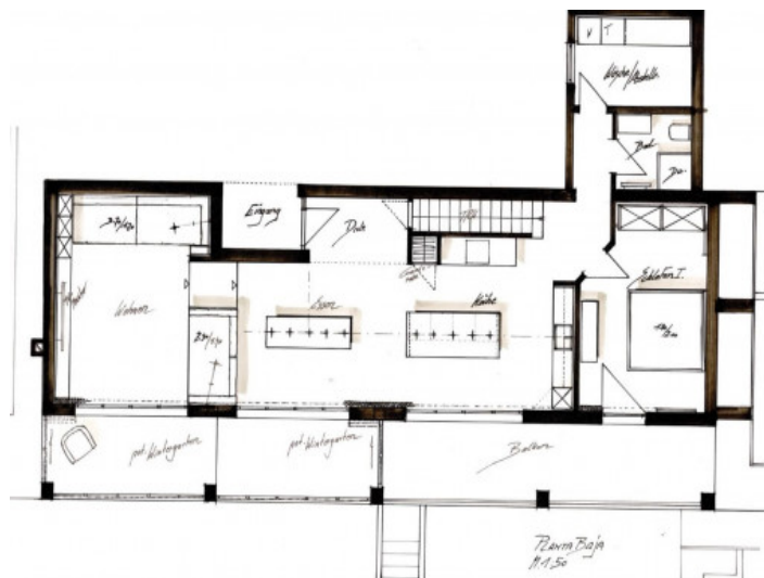
Costa d'en Blanes 4Schlafzimmer Zentralheizung Villa Kaufen

All information is correct to the best of our knowledge. Errors and prior sale excepted. This prospectus is purely for information purposes. Only the notarized deed of sale is legally binding.