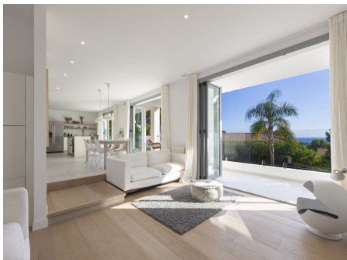
Open living area