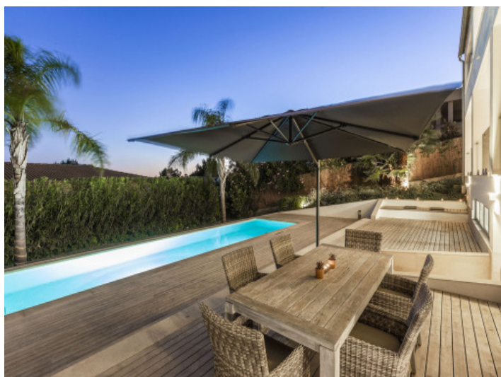
Terrace by night