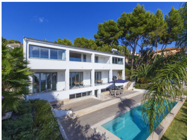
Modern villa with sea views in Costa d'en Blanes