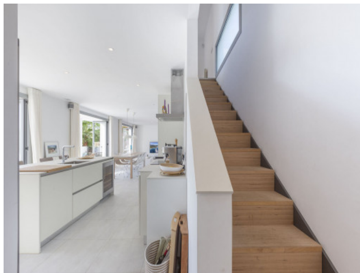
Access to the upper floor