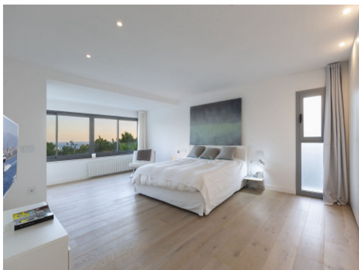
Master bedroom with large windows