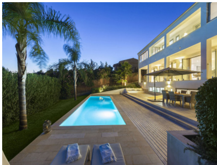
Romantic pool area by night