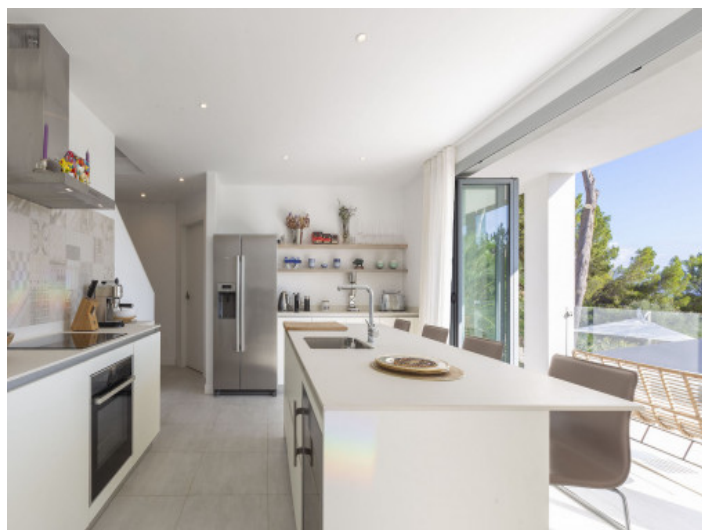
Kitchen with cooking island

All information is correct to the best of our knowledge. Errors and prior sale excepted. This prospectus is purely for information purposes. Only the notarized deed of sale is legally binding.