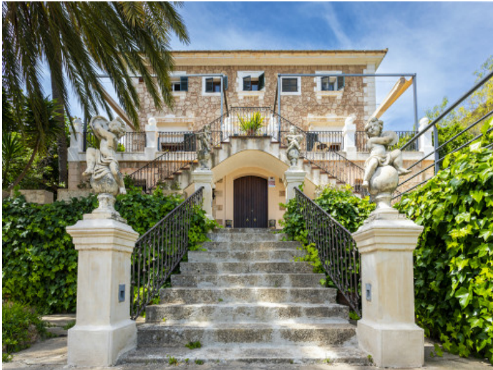
Exterior view and access to the villa