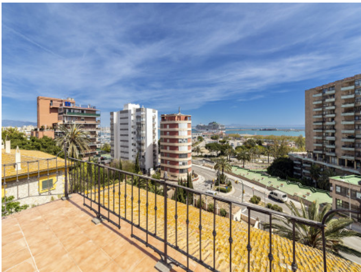
Large terrace with sea views