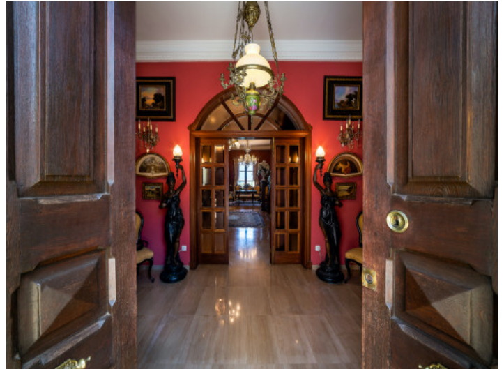
Entrance to the villa