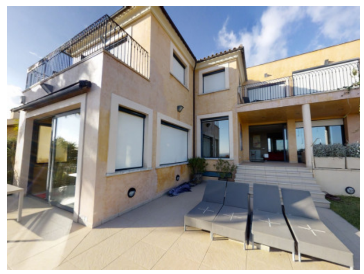
View of the facade of the villa