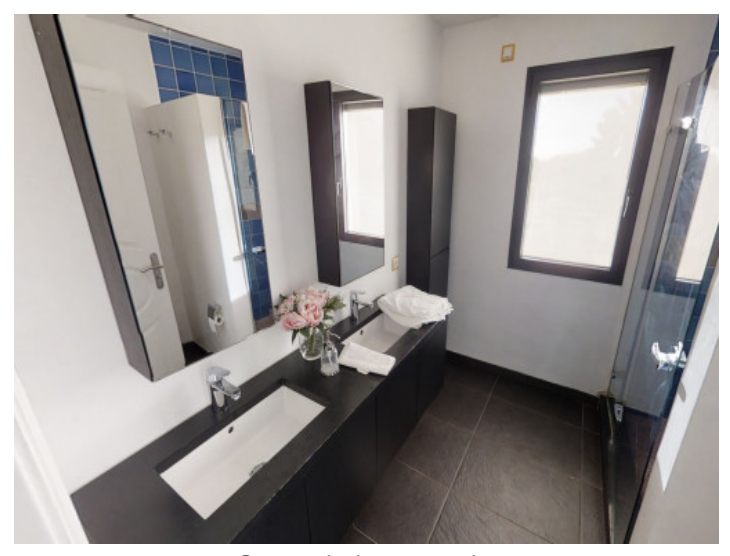
Separate bathroom upstairs