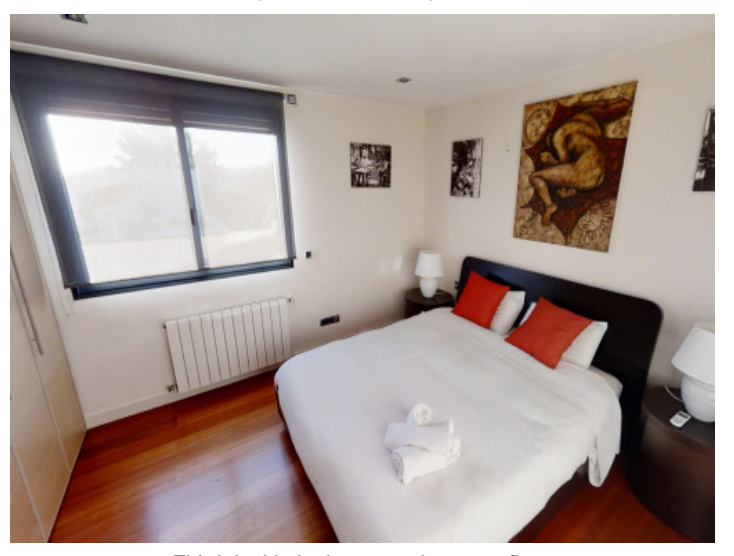
Third double bedroom on the upper floor

All information is correct to the best of our knowledge. Errors and prior sale excepted. This prospectus is purely for information purposes. Only the notarized deed of sale is legally binding.