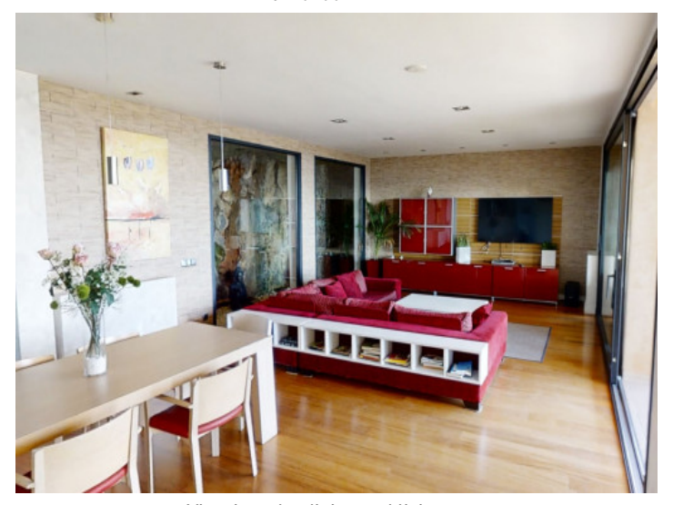
View into the dining and living area