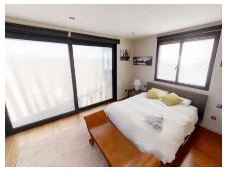
Second double bedroom upstairs