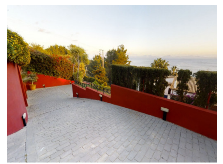
Driveway and parking