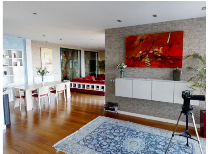
Spacious hallway area with space for a lounge corner