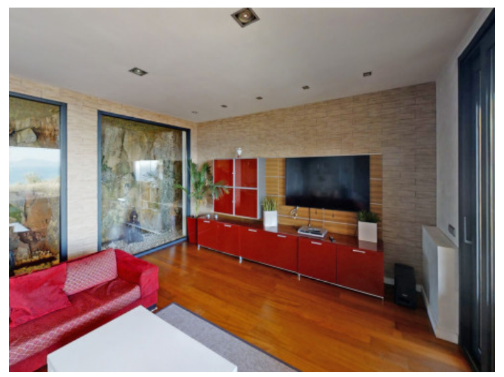
Glazed rock wall living room