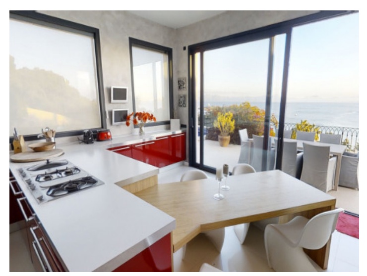
Kitchen with breakfast area