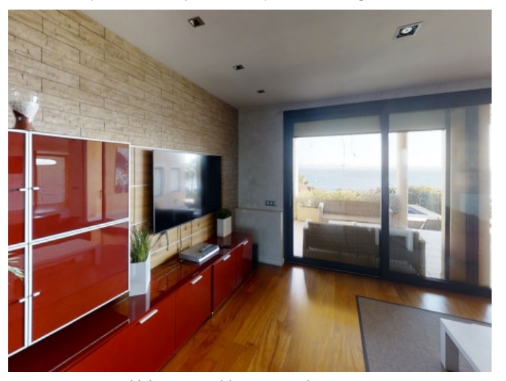
Living room with access to the terrace

All information is correct to the best of our knowledge. Errors and prior sale excepted. This prospectus is purely for information purposes. Only the notarized deed of sale is legally binding.