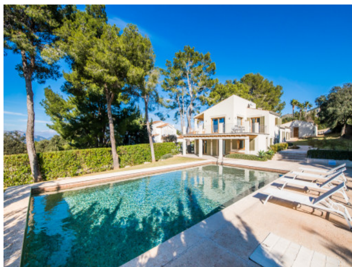
Large pool with sun terrace