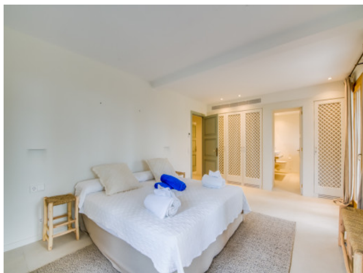
Bedroom with bathroo en suite