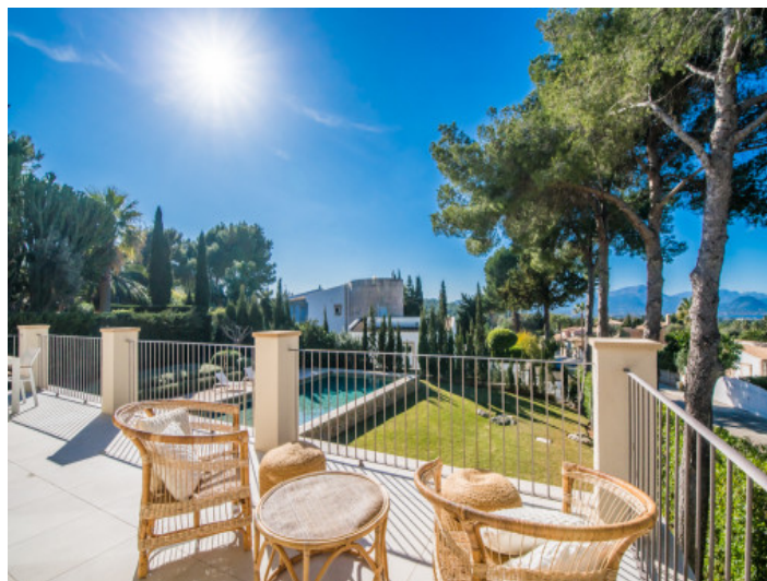
Upper terrace with garden views