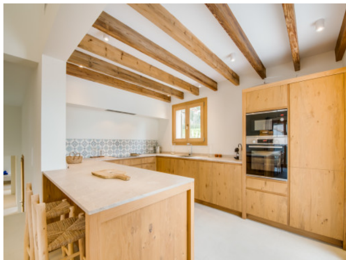
New kitchen with wooden ceiling beams