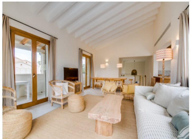
Bright and open living area

All information is correct to the best of our knowledge. Errors and prior sale excepted. This prospectus is purely for information purposes. Only the notarized deed of sale is legally binding.