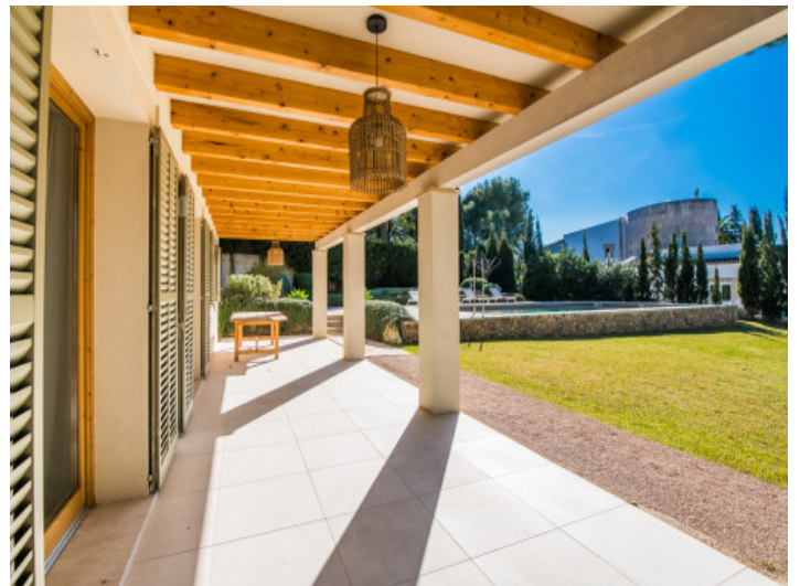
Covered terrace with garden views