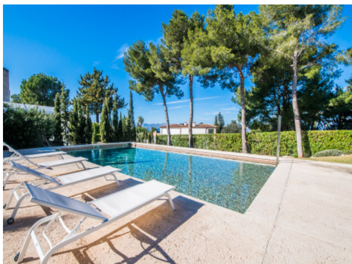
Sun loungers by the pool