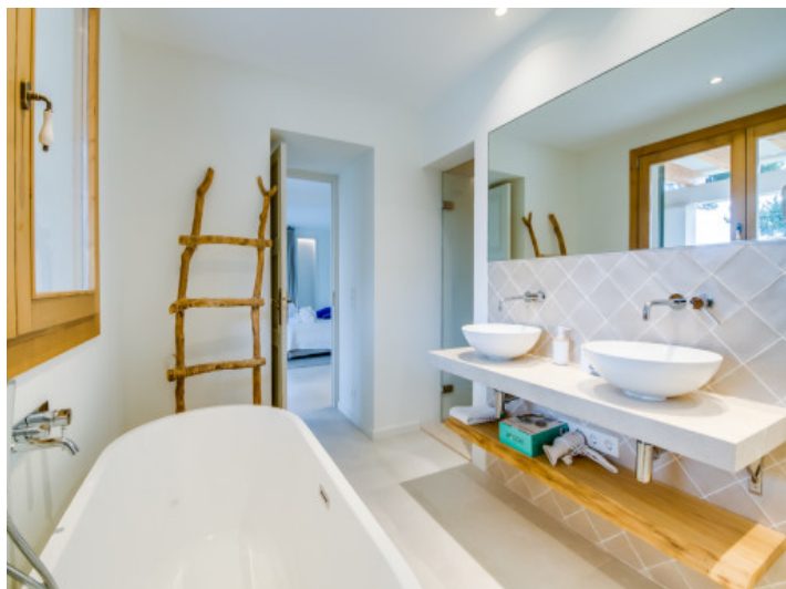
Wonderful bathroom with bathtub