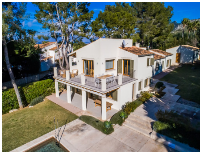
View of the 2 terraces