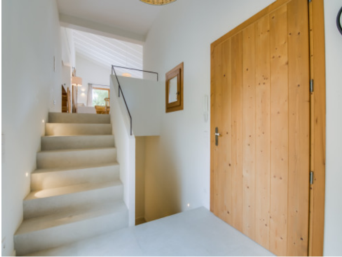
Entrance to the house