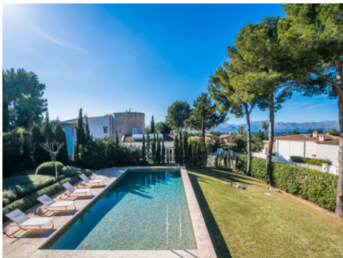
Modern pool area with sun terrace