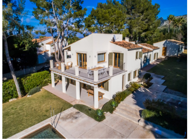
View of the 2 terraces