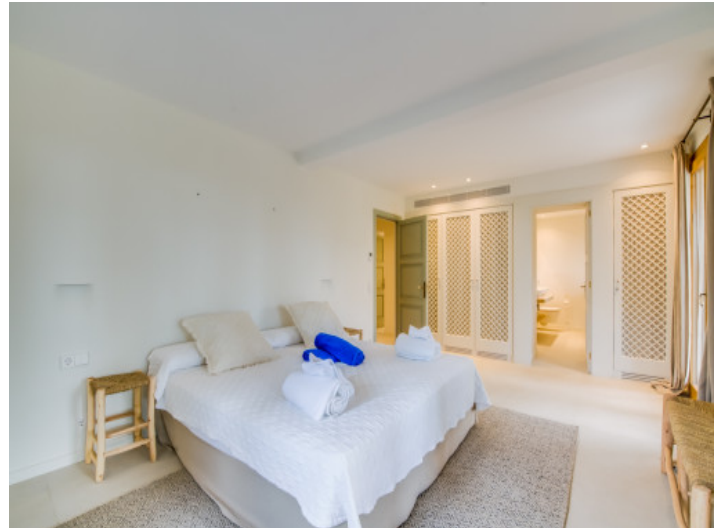
Bedroom with bathroo en suite