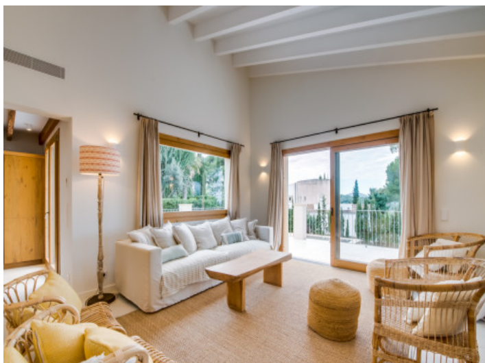
Tastefully furnished living area