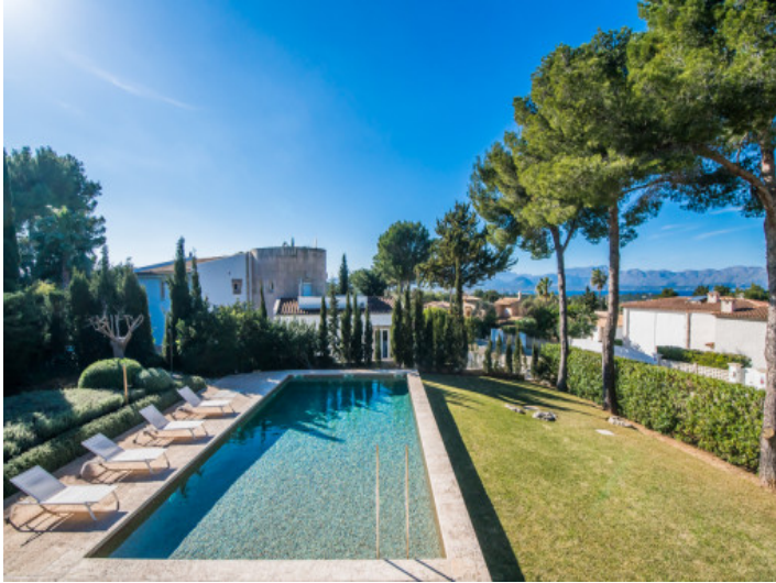
Modern pool area with sun terrace