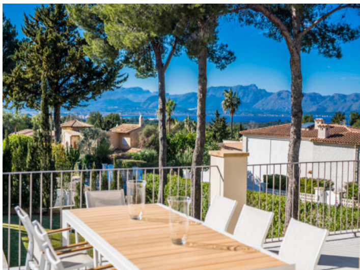
View as far as the bay of Alcudia