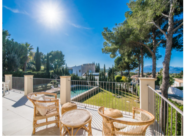
Upper terrace with garden views