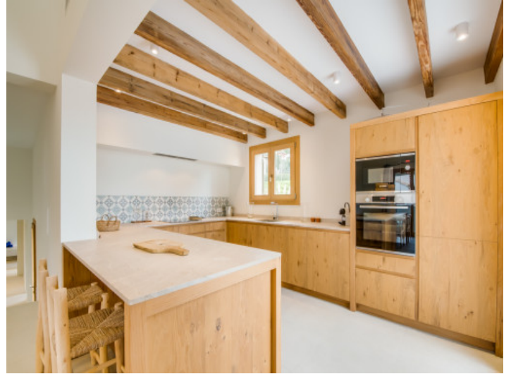
New kitchen with wooden ceiling beams