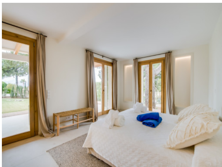
Bedroom with garden access