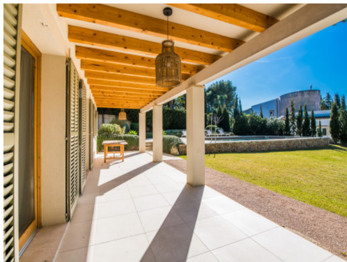
Covered terrace with garden views