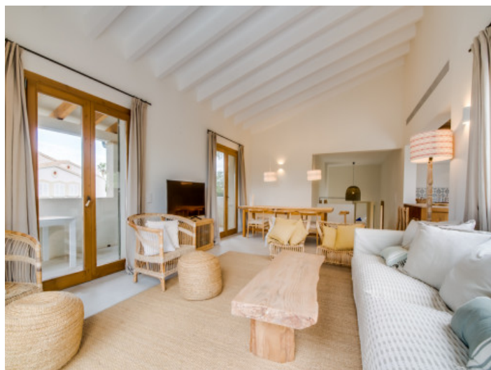
Bright and open living area

All information is correct to the best of our knowledge. Errors and prior sale excepted. This prospectus is purely for information purposes. Only the notarized deed of sale is legally binding.