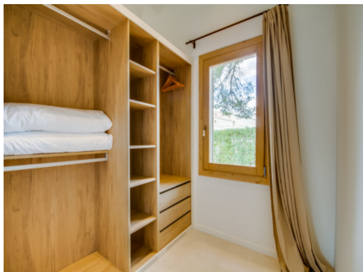
Separate dressing area

All information is correct to the best of our knowledge. Errors and prior sale excepted. This prospectus is purely for information purposes. Only the notarized deed of sale is legally binding.