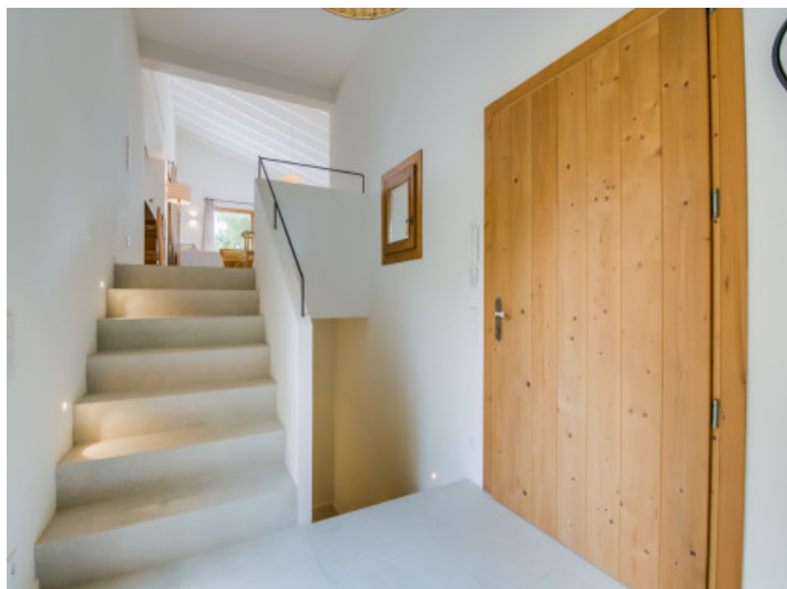
Entrance to the house