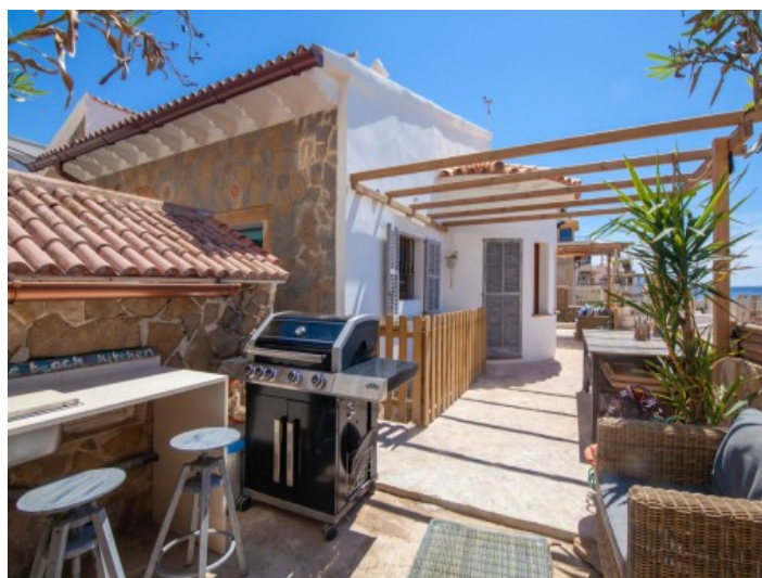
Exterior kitchen and terrace