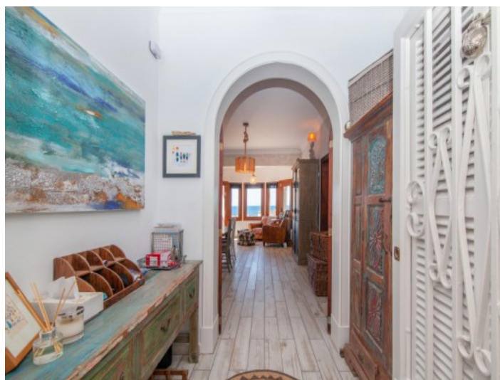
View of the floor