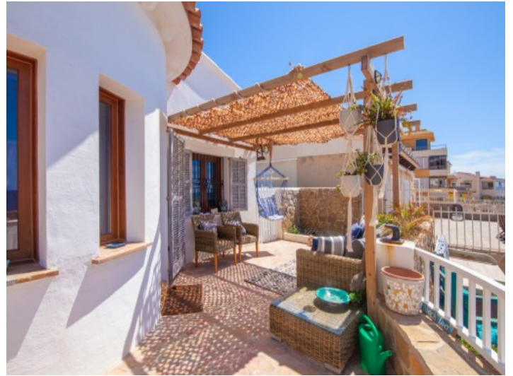
View of the large terrace