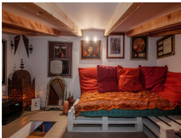
Alternative chill out area