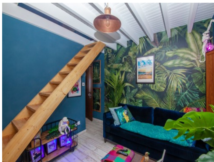
Inviting chill out area