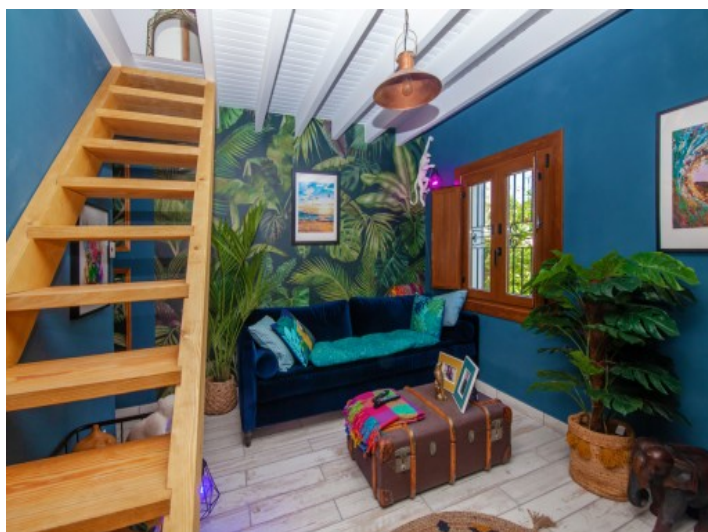
Inviting chill out area