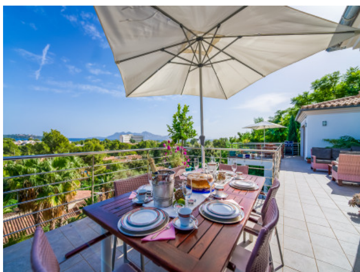
Terrace on the upper floor