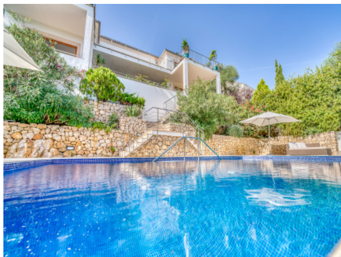
Elegant outdoor area

All information is correct to the best of our knowledge. Errors and prior sale excepted. This prospectus is purely for information purposes. Only the notarized deed of sale is legally binding.