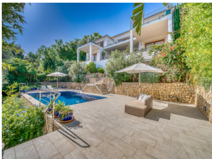
Impressive villa with views and pool in Pollença