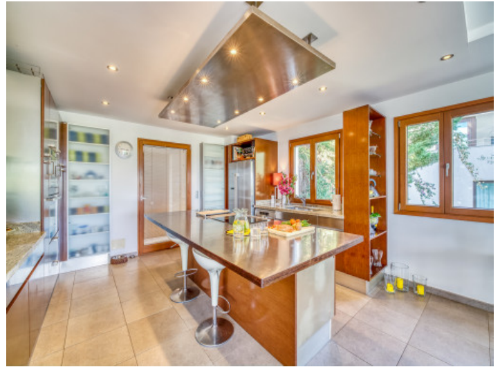
Elegant fitted kitchen