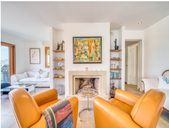
Additional living room