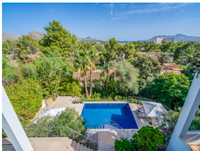
View at the pool