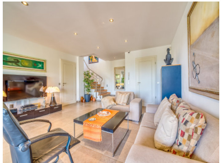
Lounge on the lower level