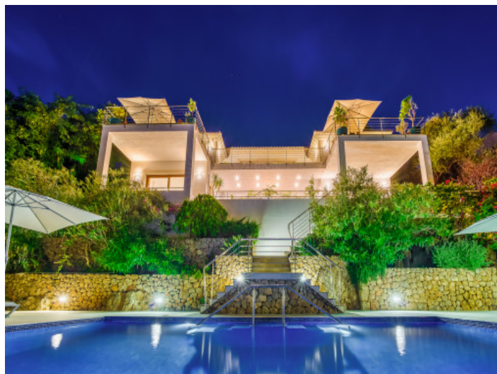
Spectacular view by night