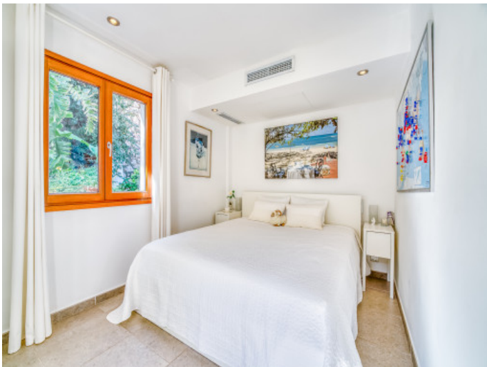
Bedroom on the upper floor