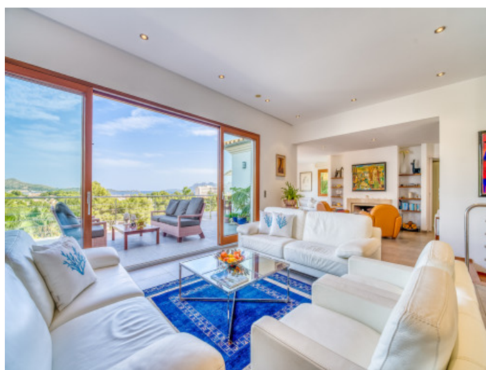
Upper floor with beautiful views