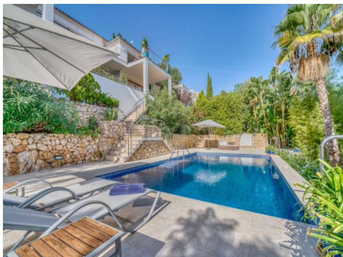
Superb pool area