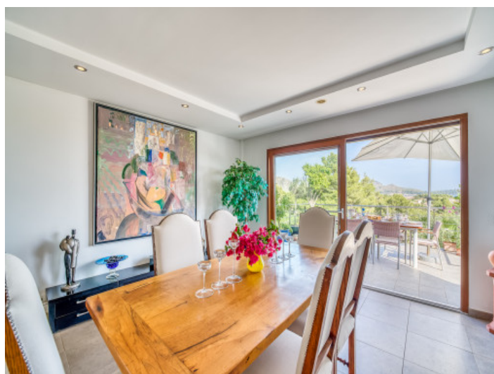
Dining area with access to the terrace

All information is correct to the best of our knowledge. Errors and prior sale excepted. This prospectus is purely for information purposes. Only the notarized deed of sale is legally binding.