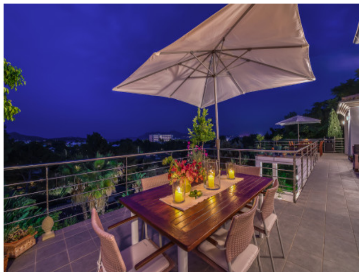
Outdoor dining area at night