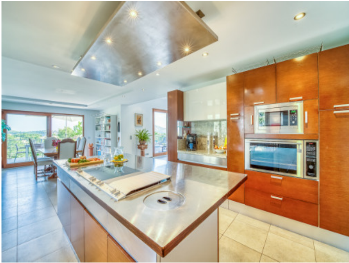
Kitchen with dining area