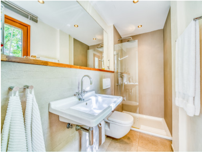
Bathroom on the upper floor