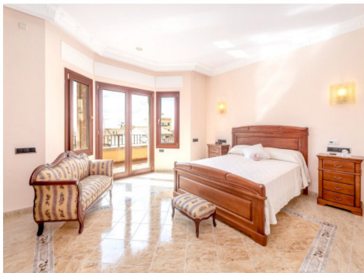
Second double bedroom