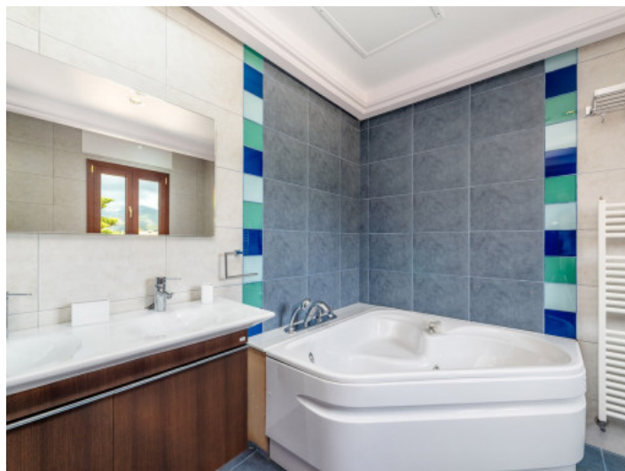
One of 5 bathrooms