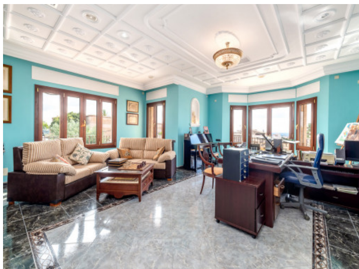
Office and living room