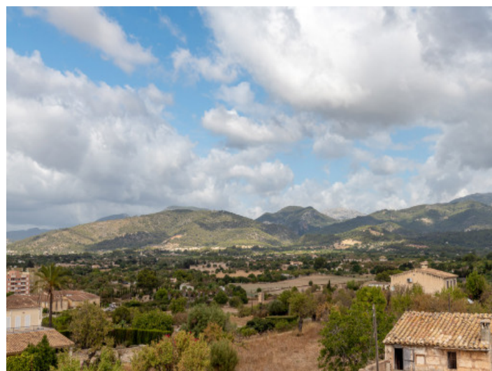
Views to the Sierra de Tramuntana