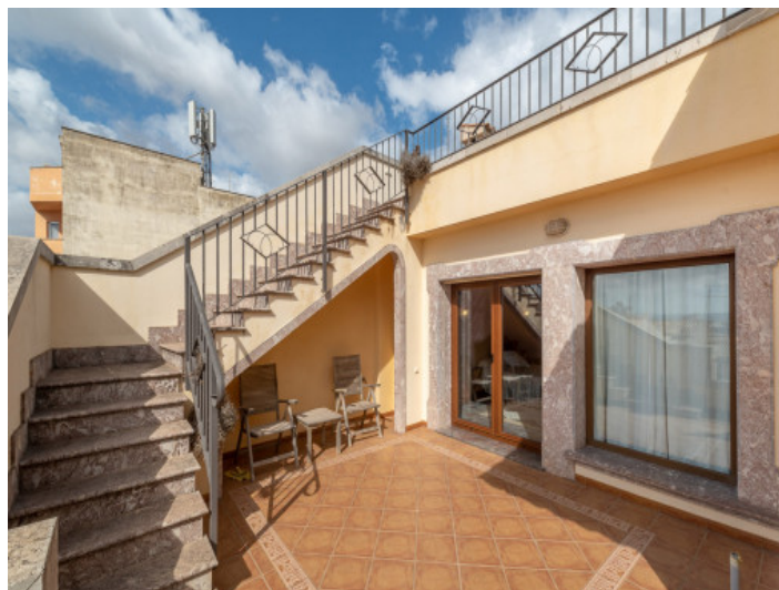
Terrace with access to the rooftop