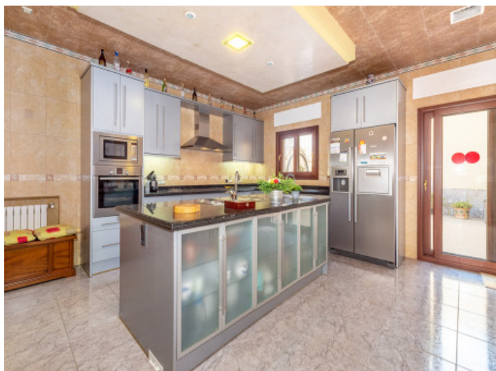
Fully equipped kitchen with cooking island