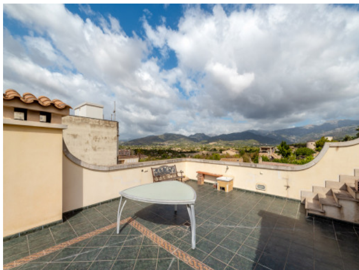
Roof terrace with mountain view