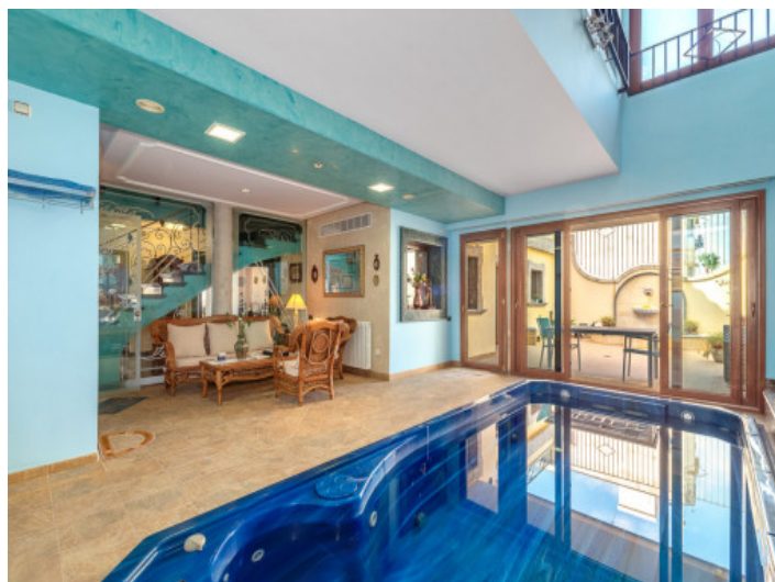
Light flooded spa

All information is correct to the best of our knowledge. Errors and prior sale excepted. This prospectus is purely for information purposes. Only the notarized deed of sale is legally binding.