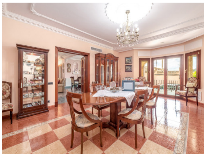
Traditional dining area