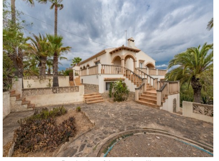
Exterior view of the sea view villa

All information is correct to the best of our knowledge. Errors and prior sale excepted. This prospectus is purely for information purposes. Only the notarized deed of sale is legally binding.