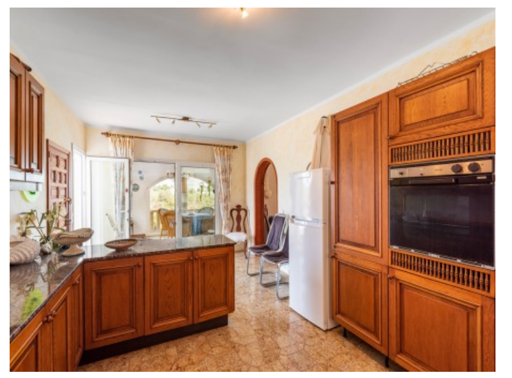
Rustic, wooden kitchen

All information is correct to the best of our knowledge. Errors and prior sale excepted. This prospectus is purely for information purposes. Only the notarized deed of sale is legally binding.