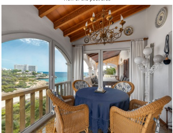
Separate dining areas on the balcony