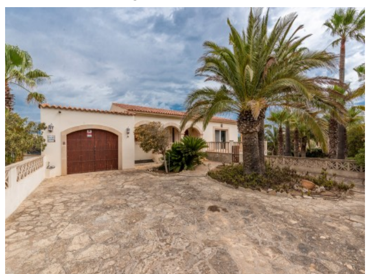
Garage and entrance area