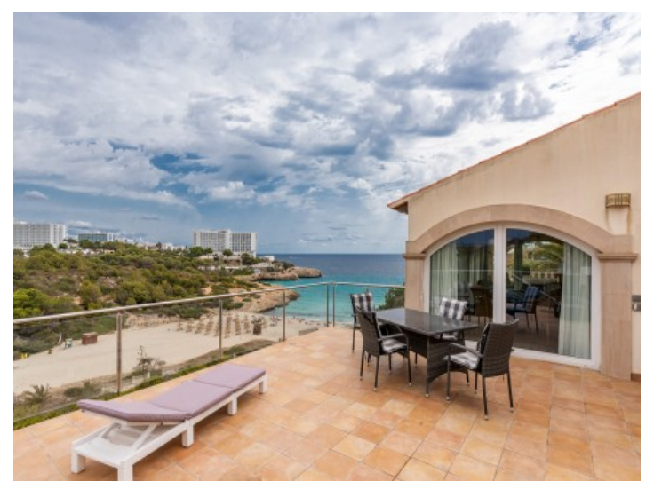
Terrace with a view