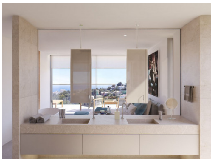
Open kitchen with panoramic views