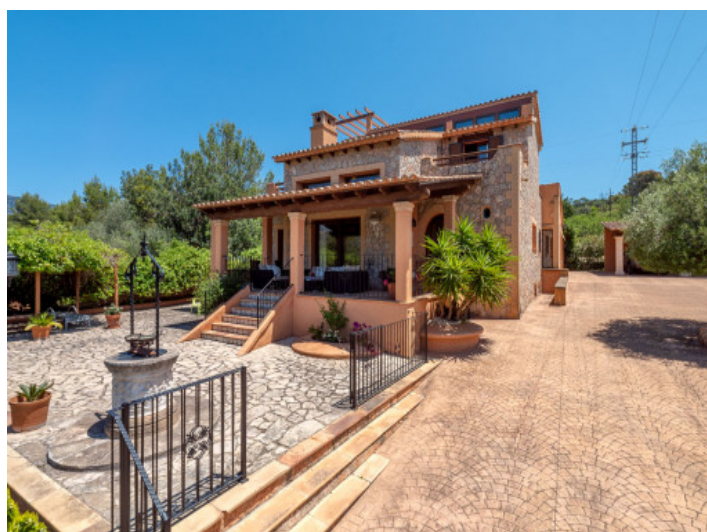
Outdoor area with terraces

All information is correct to the best of our knowledge. Errors and prior sale excepted. This prospectus is purely for information purposes. Only the notarized deed of sale is legally binding.