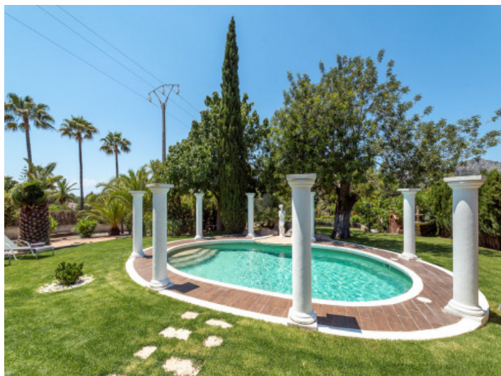
Mediterranean pool area