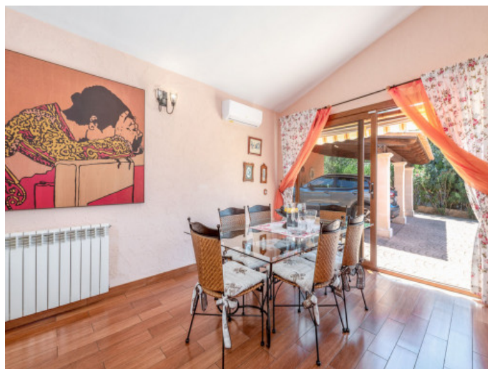
Dining area with terrace access

All information is correct to the best of our knowledge. Errors and prior sale excepted. This prospectus is purely for information purposes. Only the notarized deed of sale is legally binding.