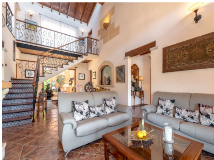
Open living area and stairs