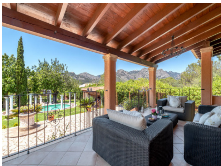
Covered lounge terrace with garden views