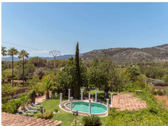
View to the pool and the mountains