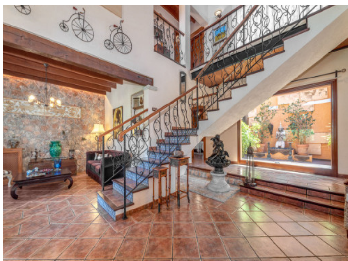
Hall and living area