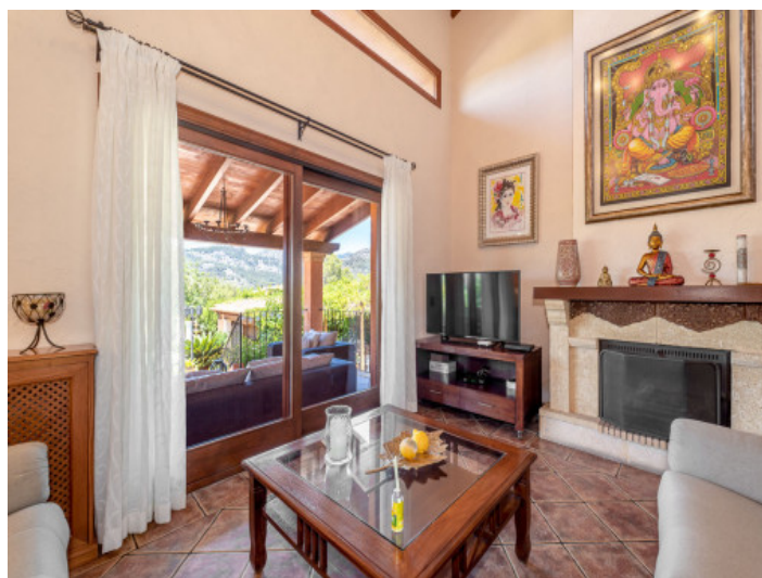
Living area with terrace access