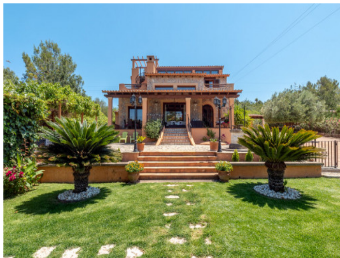
Exterior view from the garden