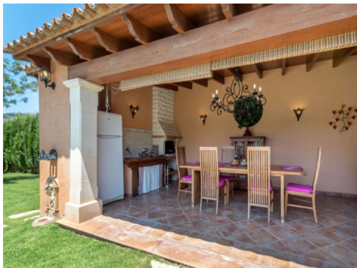
Covered bbq area