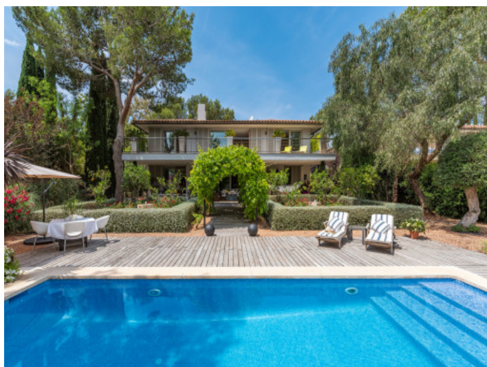
Exterior view and pool