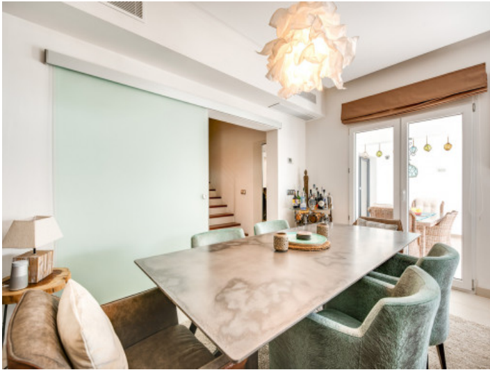
View of the dining area