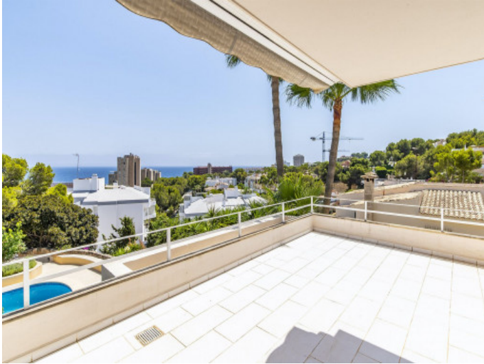
Covered terrace with superb views