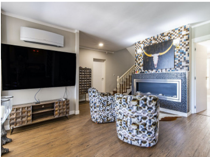
Elegant sitting area