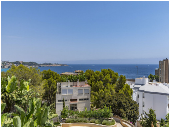
Splendid sea views