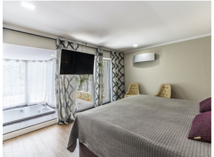
Bedroom with en suite bathroom