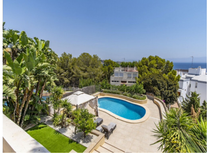
Magnificent outdoor area