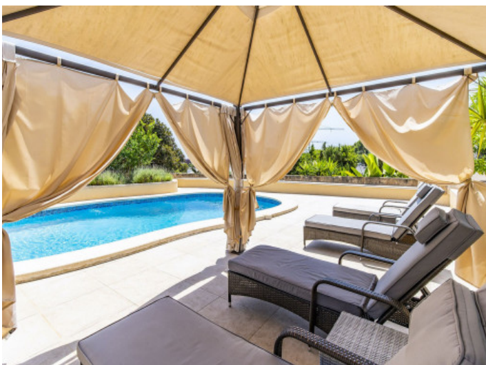
Fantastic pool area