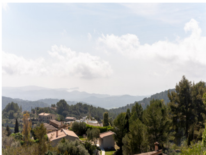
Panoramic views as far as the sea