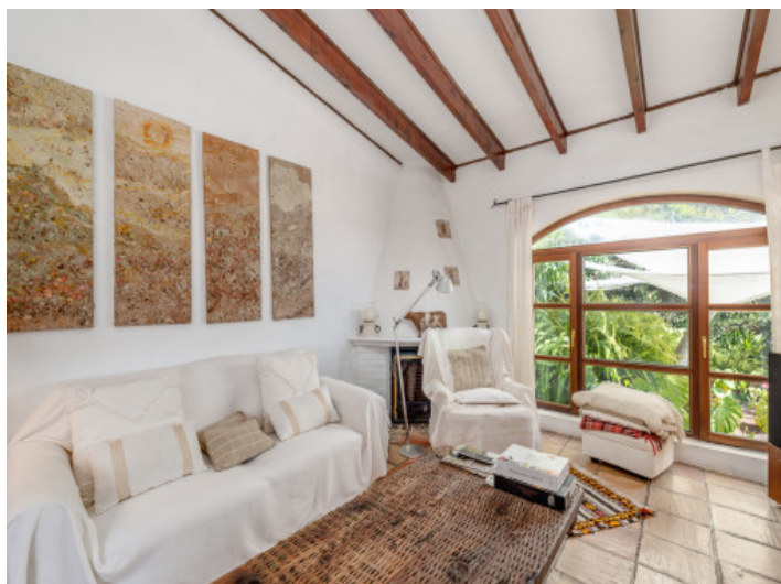
Cozy living area with wooden ceiling beams