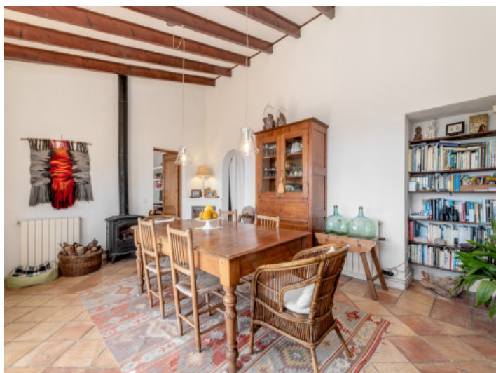
Dining area with fireplace