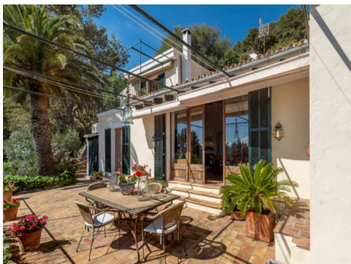
Exterior view and idyllic terrace