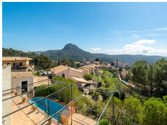
View over the town

All information is correct to the best of our knowledge. Errors and prior sale excepted. This prospectus is purely for information purposes. Only the notarized deed of sale is legally binding.