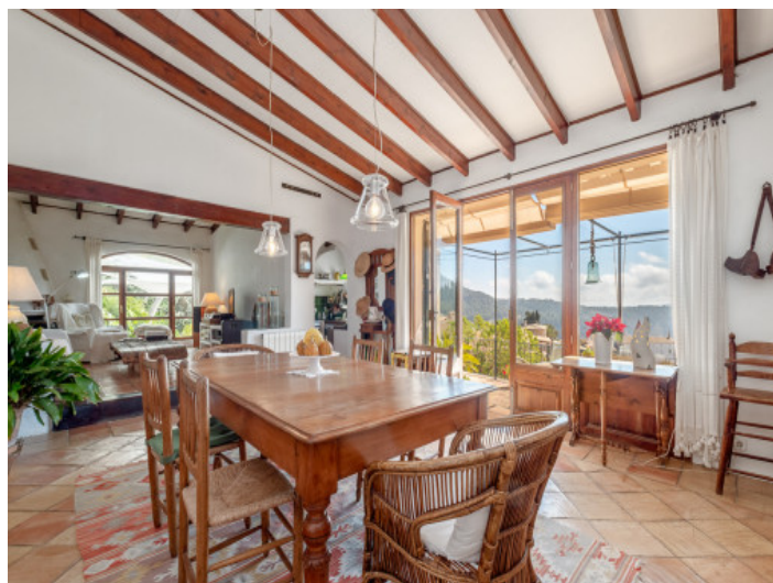
Dining area with terrace access

All information is correct to the best of our knowledge. Errors and prior sale excepted. This prospectus is purely for information purposes. Only the notarized deed of sale is legally binding.