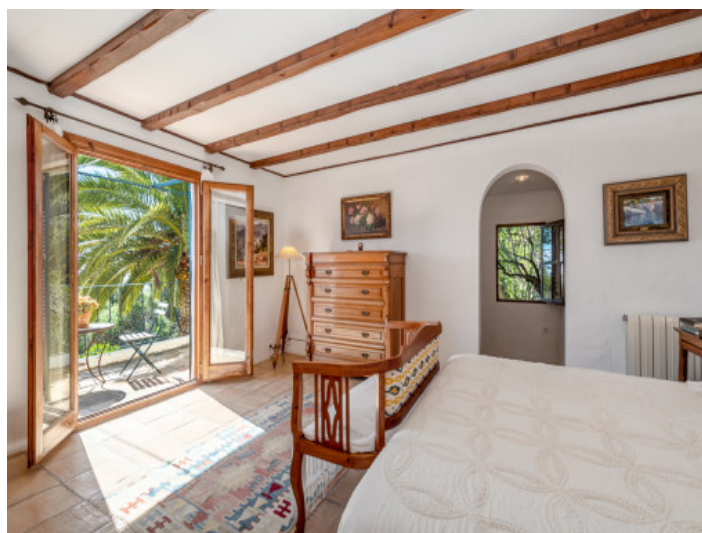
Bedroom with balcony