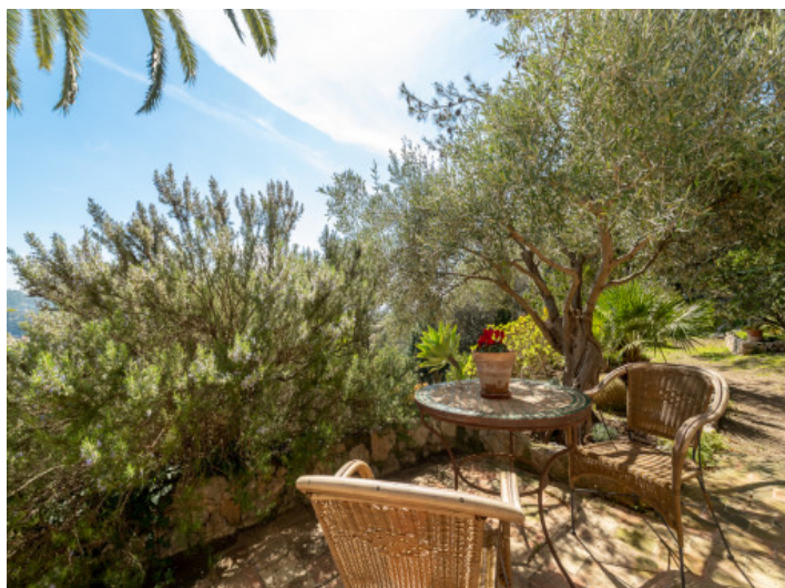
Hidden terrace in the garden