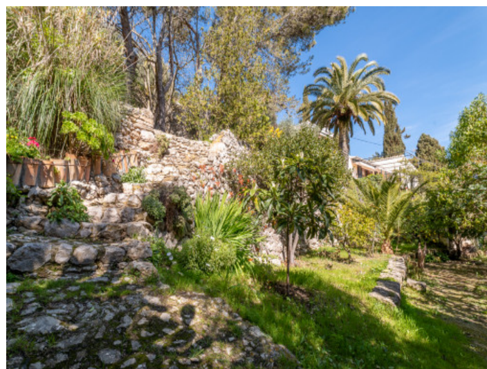
Mediterranean garden with various plants