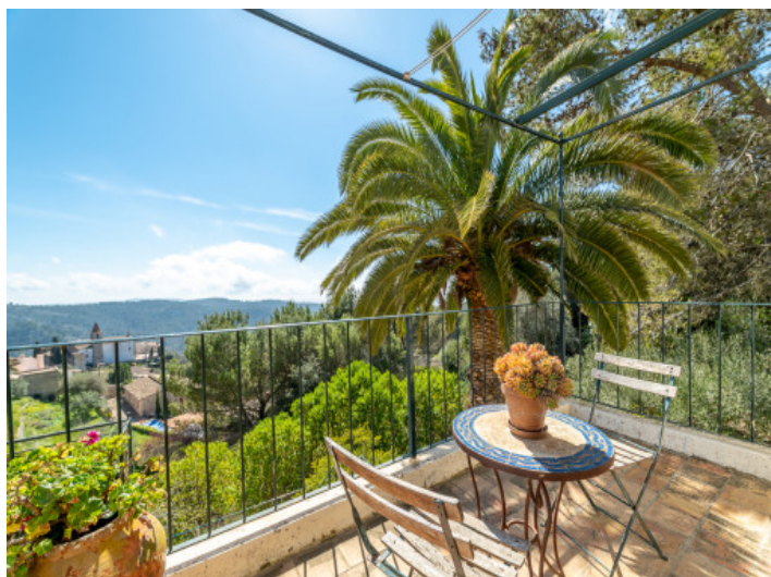
Balcony with lovely views