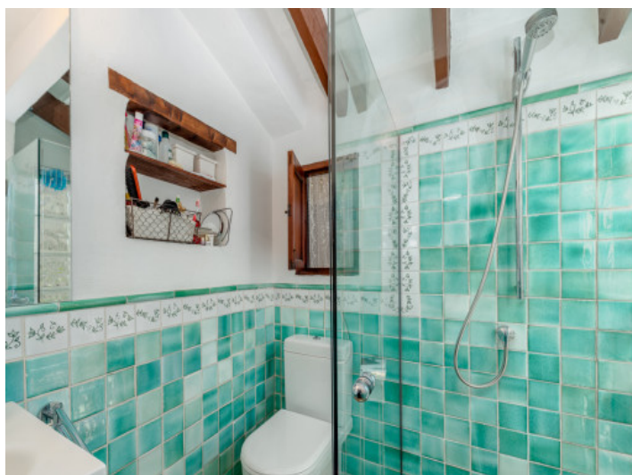
Beautifully tiled bathroom