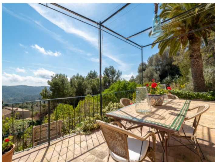
Idyllic outdoor terrace