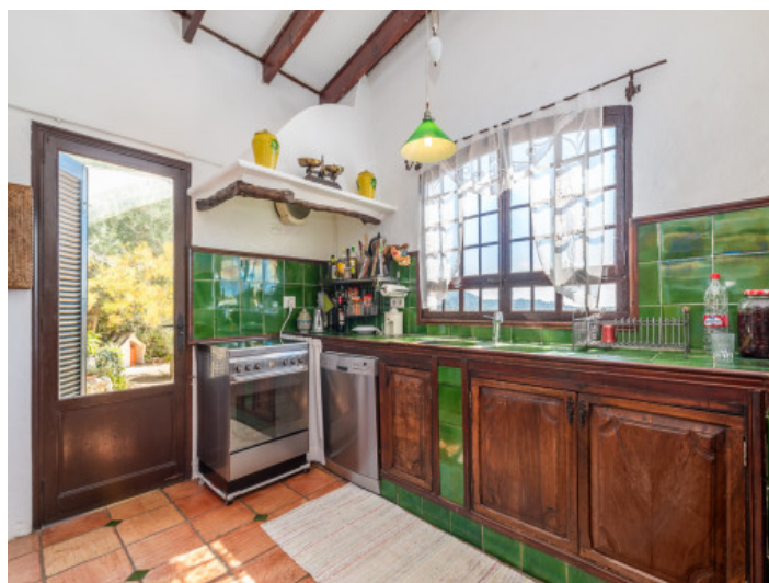
Rustic country house kitchen with terrace access