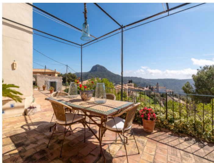
Enchanting terrace with a view