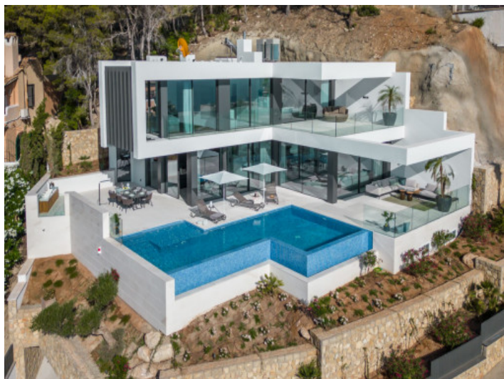
Modern designer villa