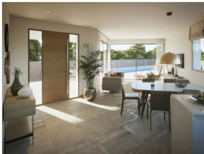
View to the entrance area