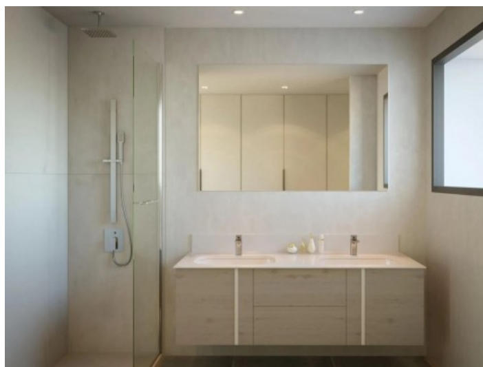
Bathroom with walk-in shower