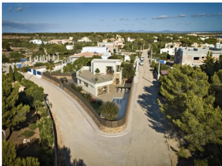
Exterior view of the villa

All information is correct to the best of our knowledge. Errors and prior sale excepted. This prospectus is purely for information purposes. Only the notarized deed of sale is legally binding.