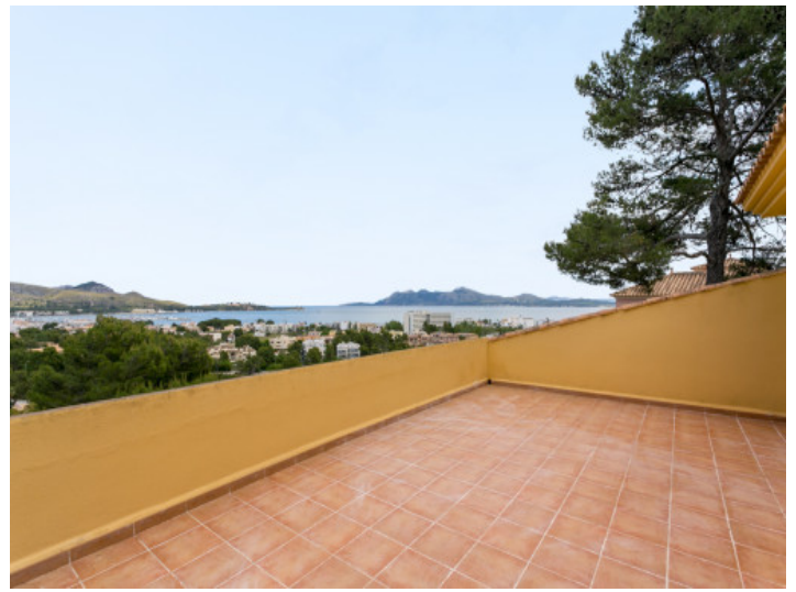
Fantastic seaview-villa in Port Pollenca