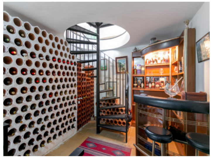
Charming wine cellar