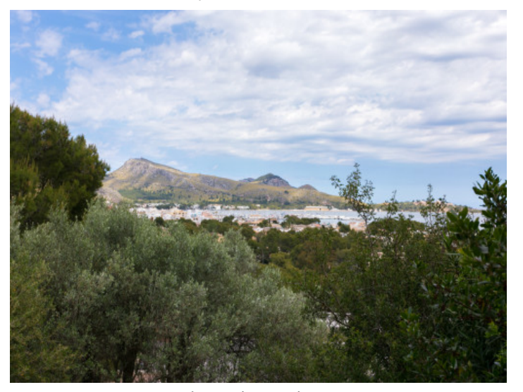
Impressive sea views

All information is correct to the best of our knowledge. Errors and prior sale excepted. This prospectus is purely for information purposes. Only the notarized deed of sale is legally binding.