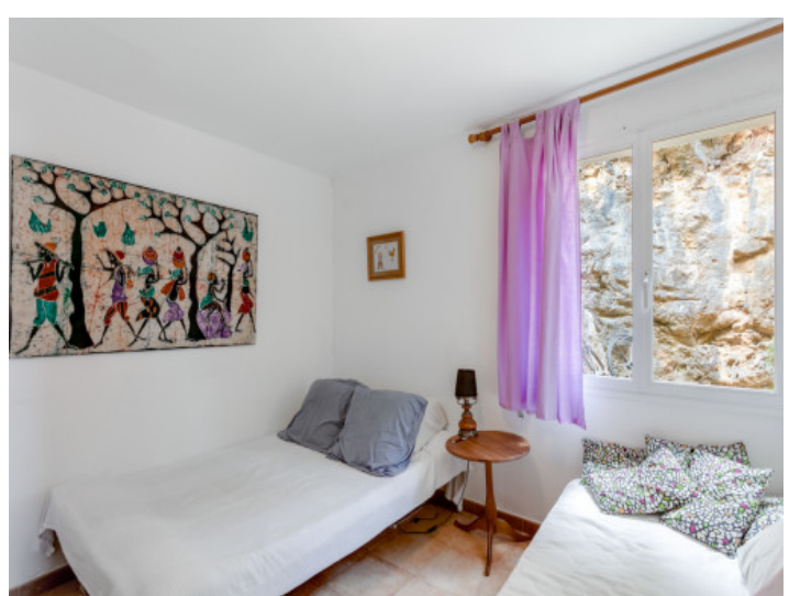
Bedroom with 2 single beds