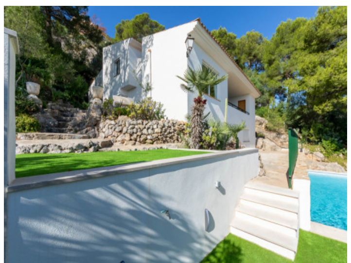
Sunny terrace and pool area