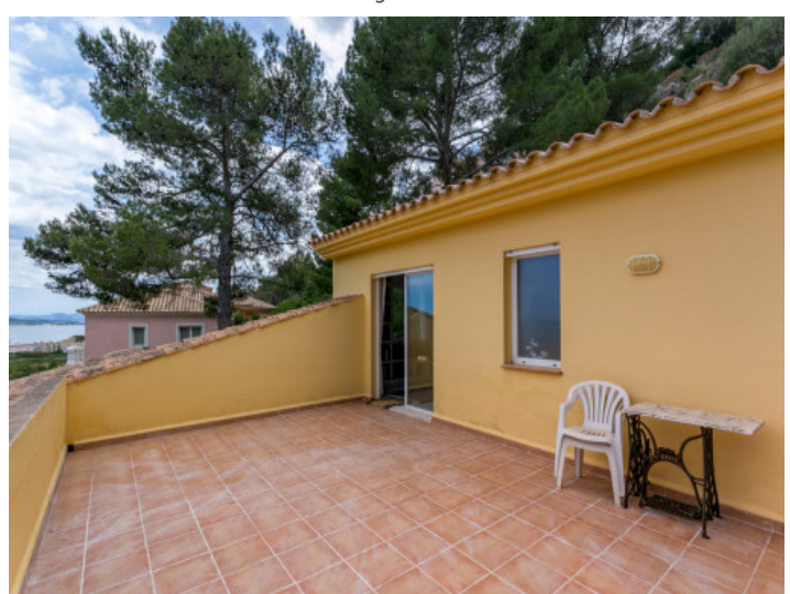
Spacious roof terrace