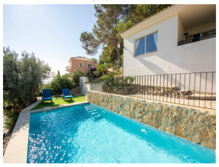
Views from the pool to the terrace