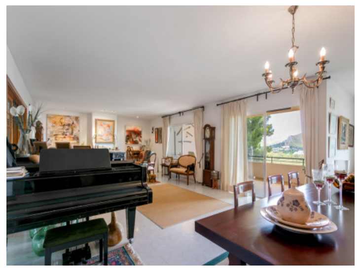
Living and dining area with mountain views