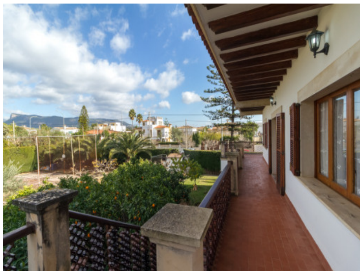
Garden area with fruit trees