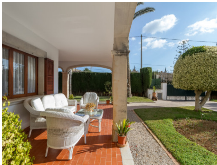
Further covered terrace