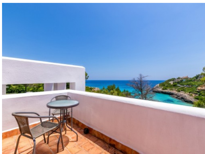
Terrace with fantastic sea views

All information is correct to the best of our knowledge. Errors and prior sale excepted. This prospectus is purely for information purposes. Only the notarized deed of sale is legally binding.