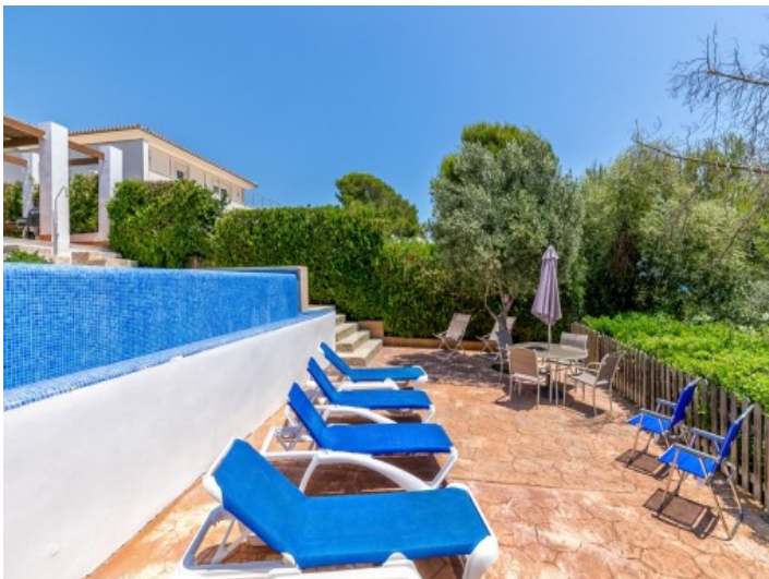
Lounge area beside the pool