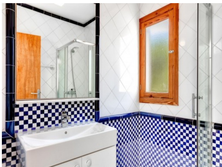
One of 4 bathrooms