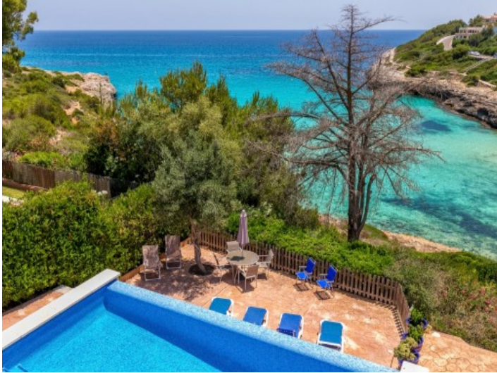
Located in first sea line