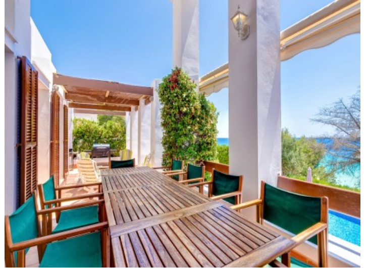
Spacious terrace with dining area and barbecue