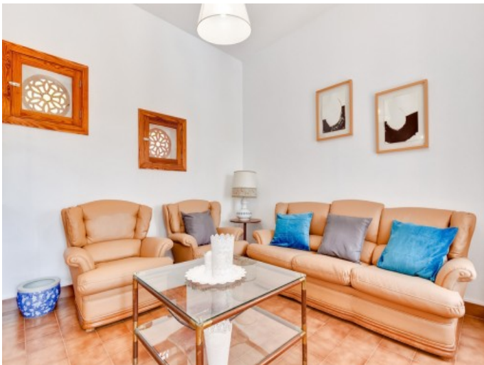
Cosy lounge area