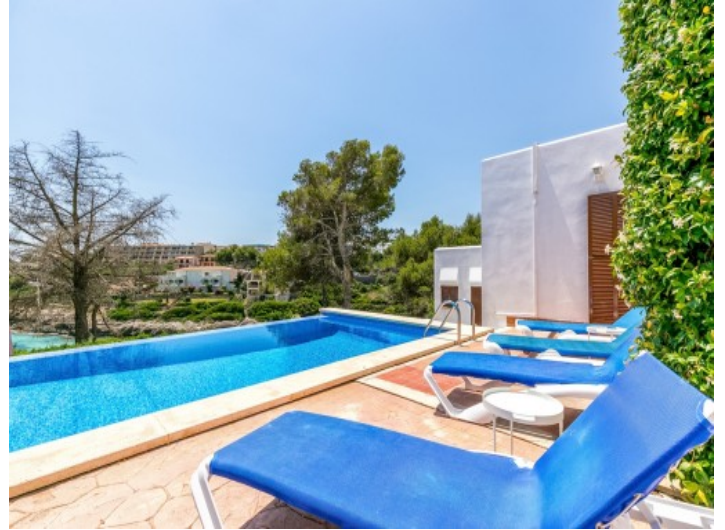
Sunny pool area with sea views