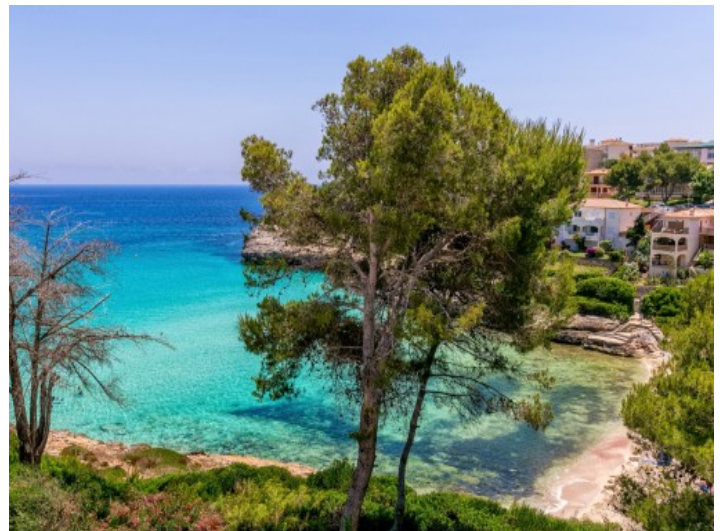
Beautiful beach nearby

All information is correct to the best of our knowledge. Errors and prior sale excepted. This prospectus is purely for information purposes. Only the notarized deed of sale is legally binding.