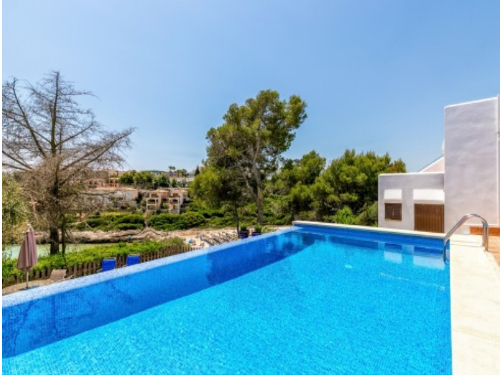
Large pool with views of the beach