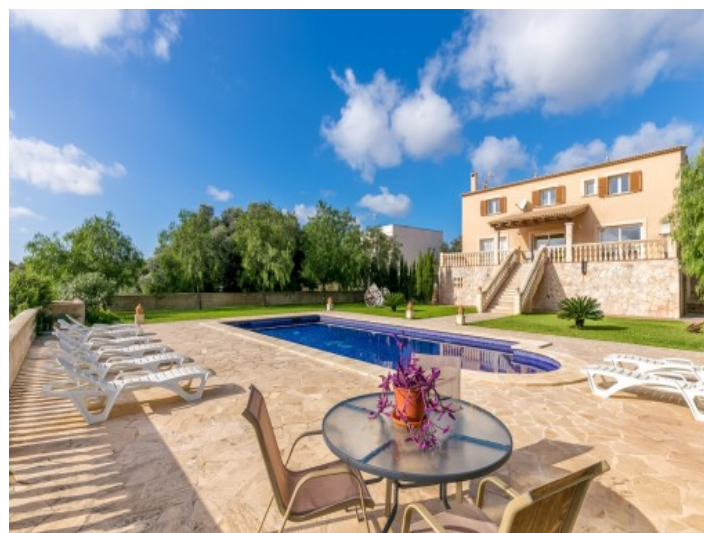
Idyllic garden and pool with chillout areas