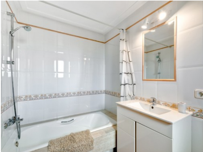
Second bathroom with bathtub