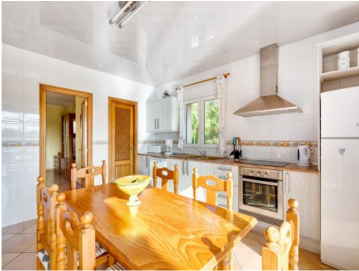
Light flooded kitchen with dining area