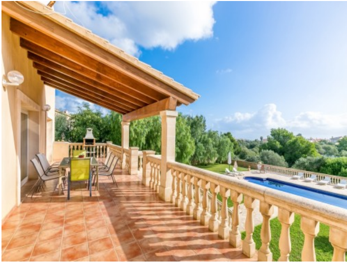
Large terrace with garden and pool views