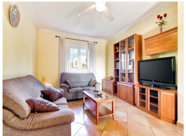
Second living area

All information is correct to the best of our knowledge. Errors and prior sale excepted. This prospectus is purely for information purposes. Only the notarized deed of sale is legally binding.