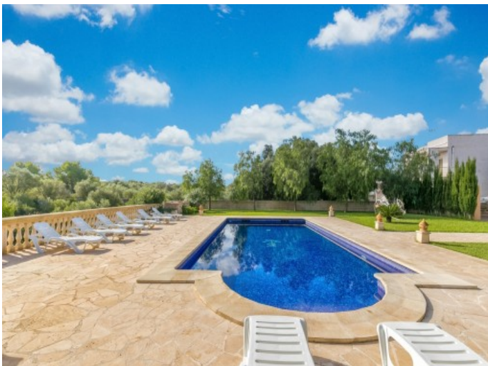
Amazing pool area and garden