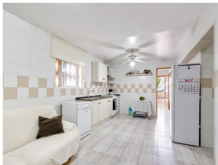
Second, fully equipped kitchen