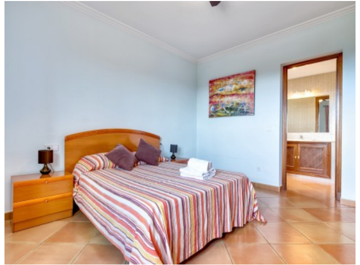
Double bedroom with bathroom en suite