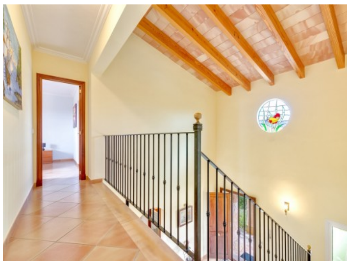
Staircase to the upper floor