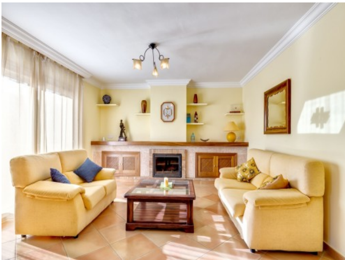
Cosy living area with fireplace