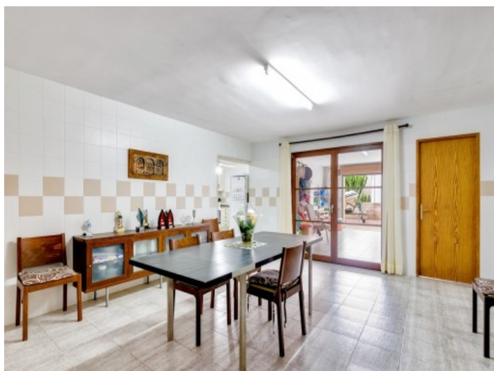
Another dining area