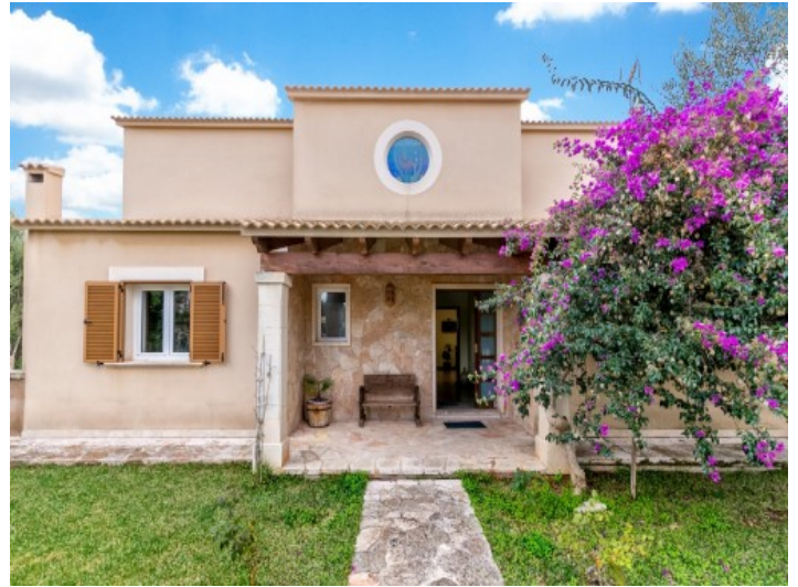
Front view and entrance to the property