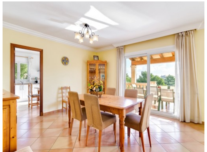
Bright dining area with terrace access