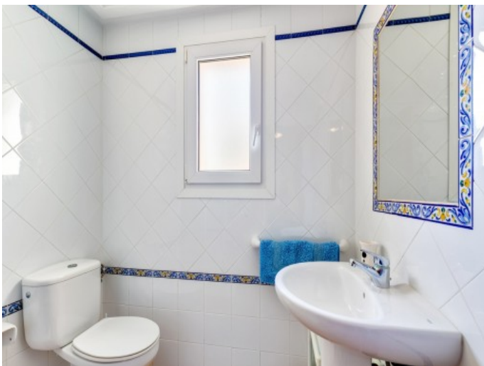
One out of 4 bathrooms