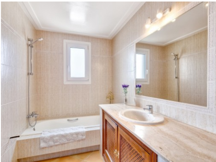
Bathroom en suite with bathtub and natural light