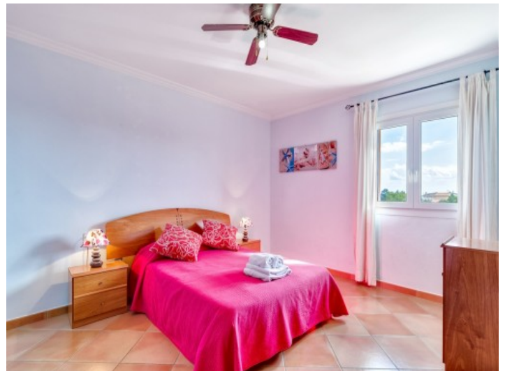
One out of 4 bedrooms