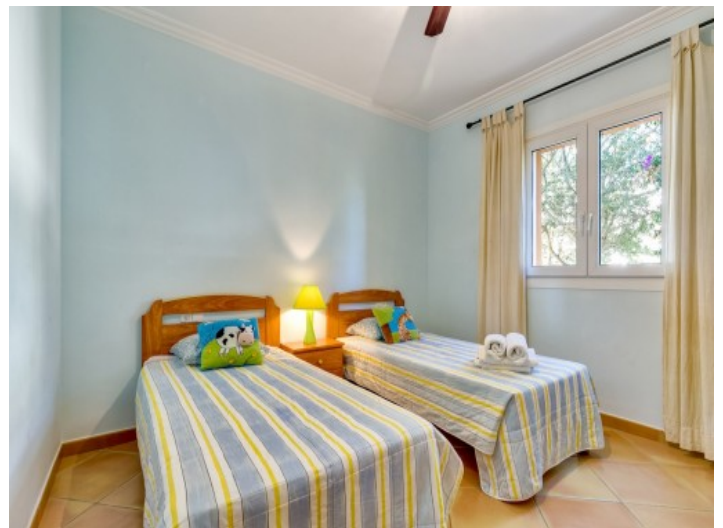
Children's room with 2 single beds

All information is correct to the best of our knowledge. Errors and prior sale excepted. This prospectus is purely for information purposes. Only the notarized deed of sale is legally binding.