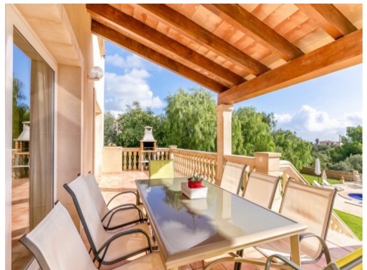
Covered terrace with seating and barbecue area