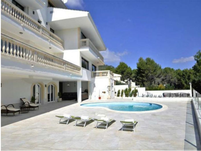
Much space to relax