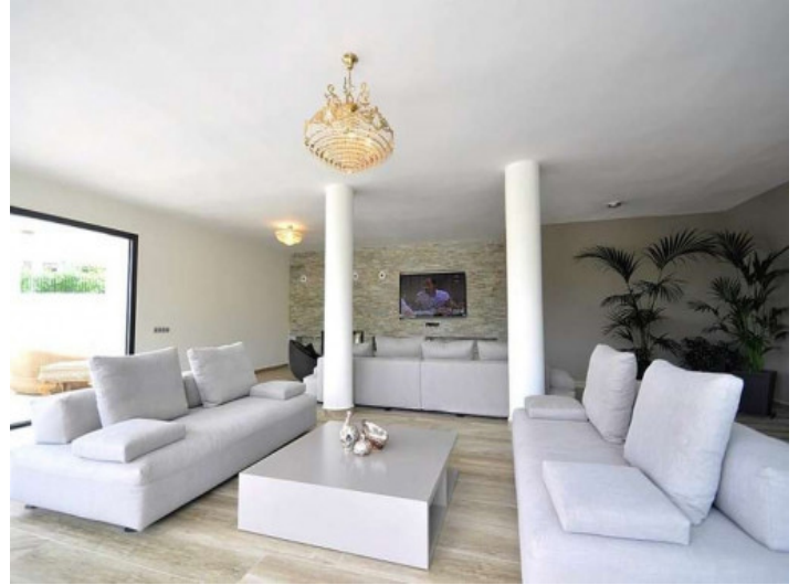
Luxury living area