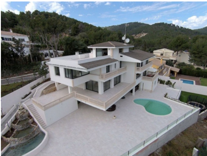
Bird's eye view on the property in Son Vida

All information is correct to the best of our knowledge. Errors and prior sale excepted. This prospectus is purely for information purposes. Only the notarized deed of sale is legally binding.