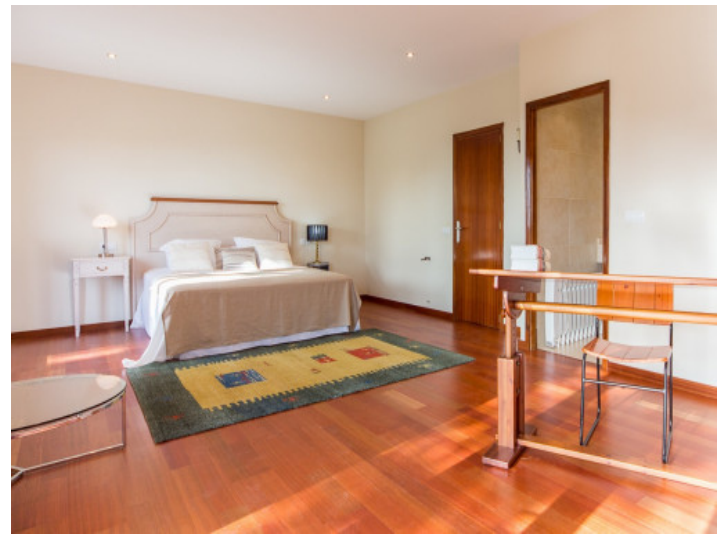
Bedroom with desk