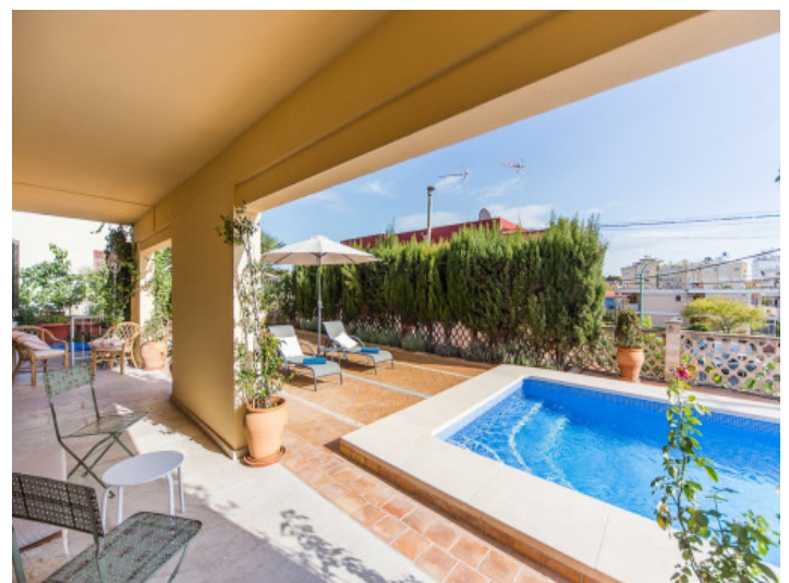
Covered terrace with pool views