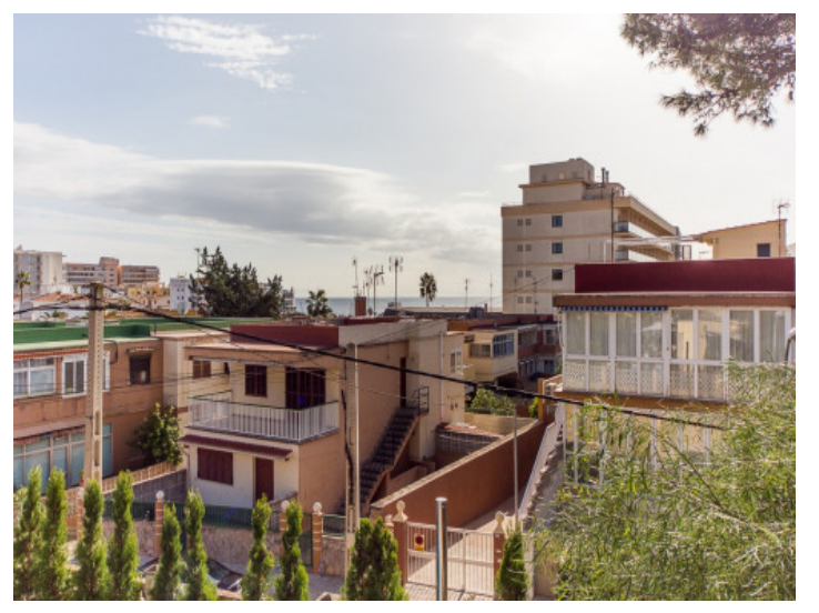
Views to the surroundings

All information is correct to the best of our knowledge. Errors and prior sale excepted. This prospectus is purely for information purposes. Only the notarized deed of sale is legally binding.