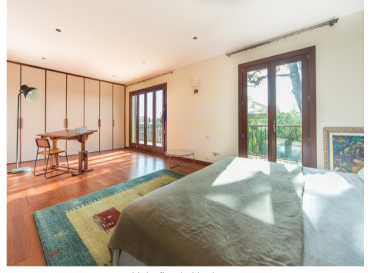
Light flooded bedroom

All information is correct to the best of our knowledge. Errors and prior sale excepted. This prospectus is purely for information purposes. Only the notarized deed of sale is legally binding.