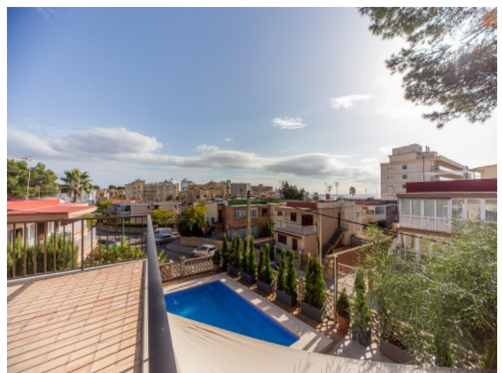
Balcony with pool views