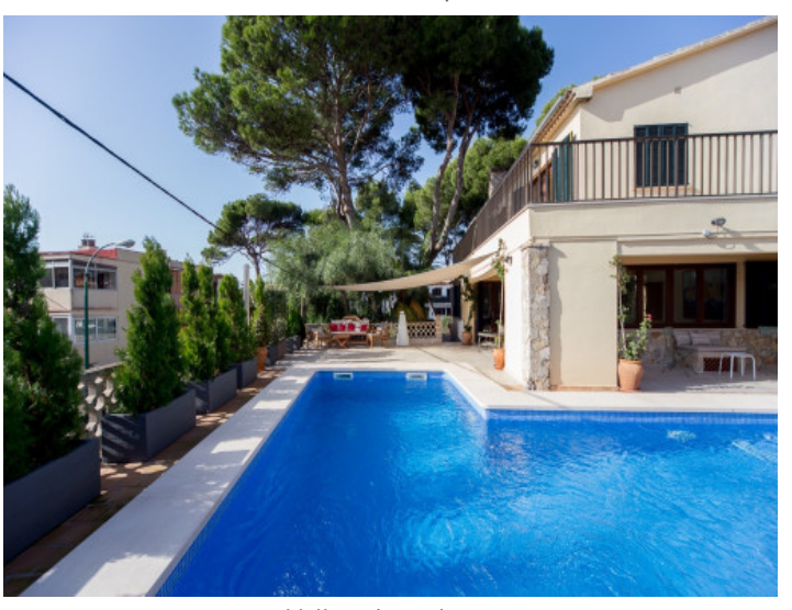
Mallorquin pool area