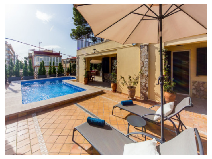
Pool and chill-out area