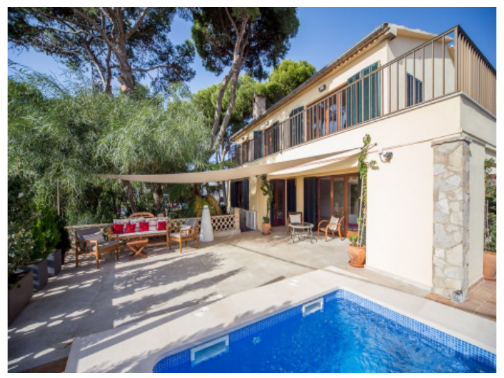
Views to the villa from the pool