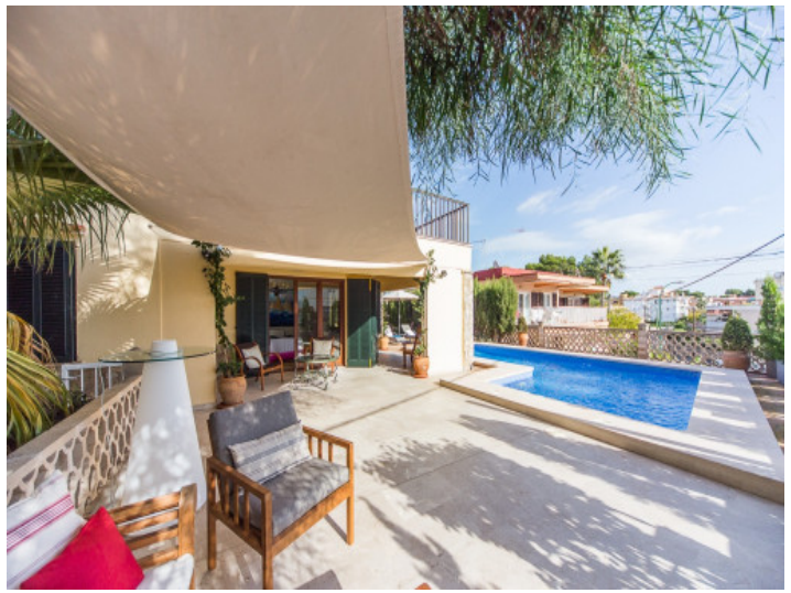
Lounge area in the shaddow