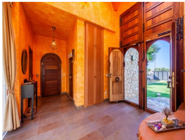
Entrance from the villa