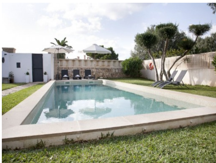
Alternative view of the pool