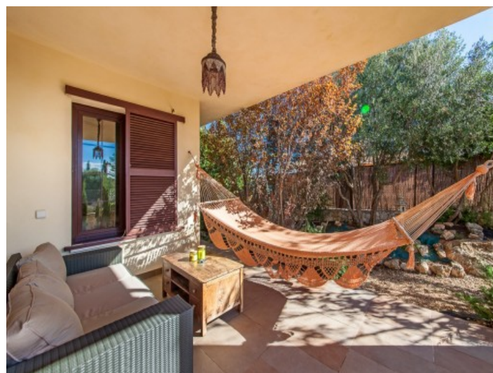
Lounge area on the terrace