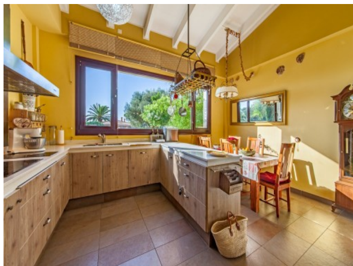
Light flooded kitchen

All information is correct to the best of our knowledge. Errors and prior sale excepted. This prospectus is purely for information purposes. Only the notarized deed of sale is legally binding.