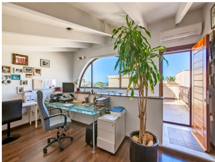
Bright office with balcony