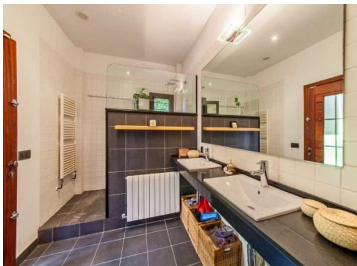
Modern bathroom with shower