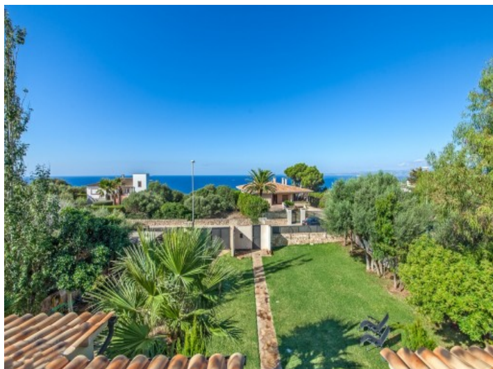
Unique sea views from the upper floor