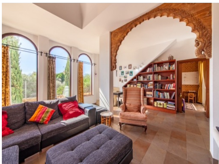
Open living room