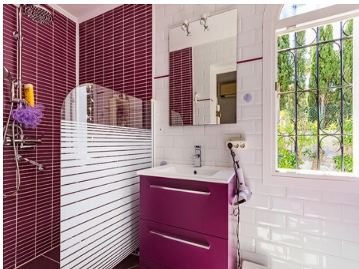
Stylish bathroom with shower