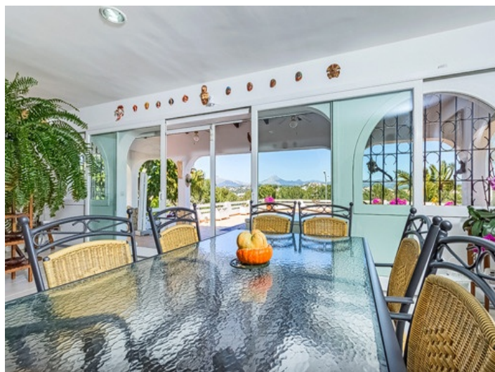
Dining area with direct terrace acces

All information is correct to the best of our knowledge. Errors and prior sale excepted. This prospectus is purely for information purposes. Only the notarized deed of sale is legally binding.