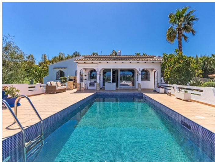
Impressive pool area