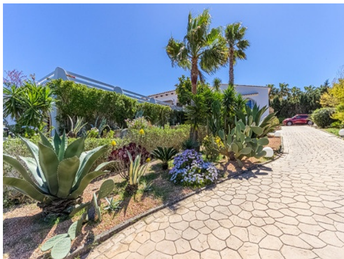
Mediterran driveway to the property

All information is correct to the best of our knowledge. Errors and prior sale excepted. This prospectus is purely for information purposes. Only the notarized deed of sale is legally binding.