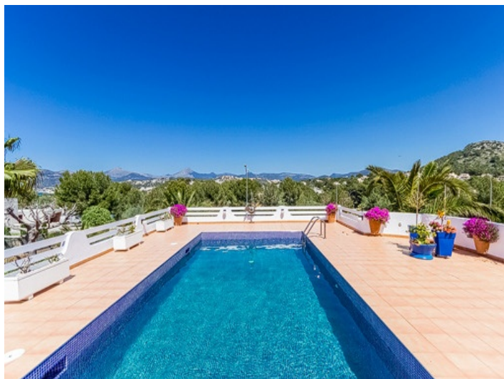
Unique landscape views from the pool area