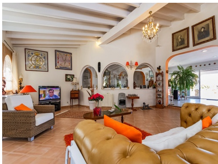
Cosy living area