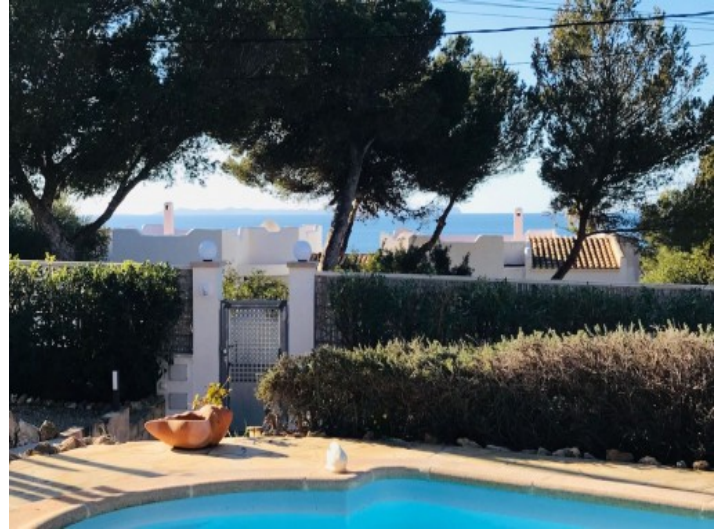
Pool and sea views