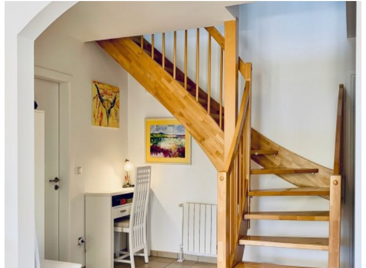
Access upper floor