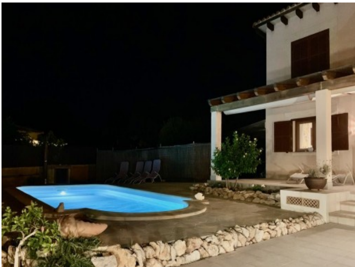
Pool area by night