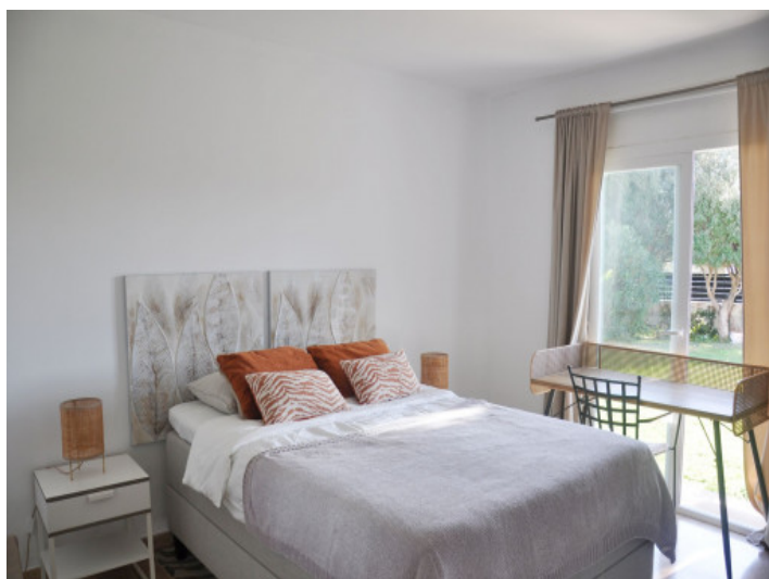
Bright bedroom with views