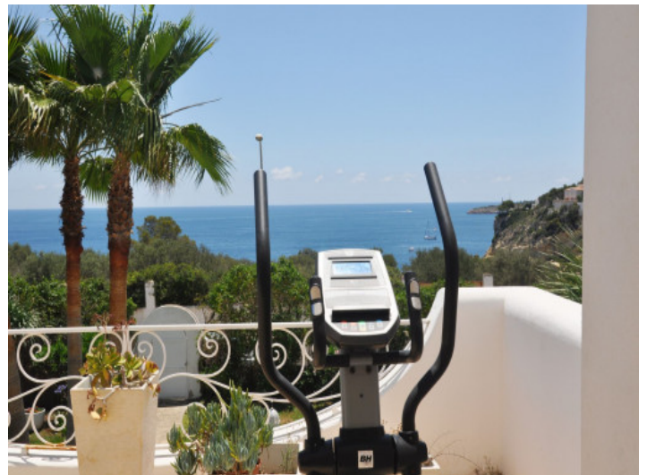
Fitness area with views of the greenery

All information is correct to the best of our knowledge. Errors and prior sale excepted. This prospectus is purely for information purposes. Only the notarized deed of sale is legally binding.