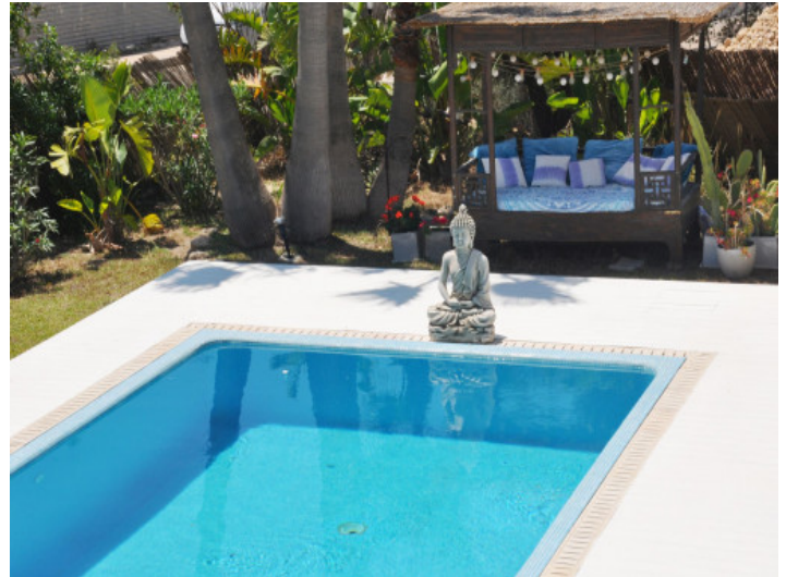
Private saltwater pool with sun terrace