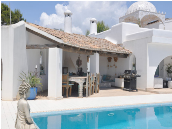
Covered BBQ and outdoor dining area