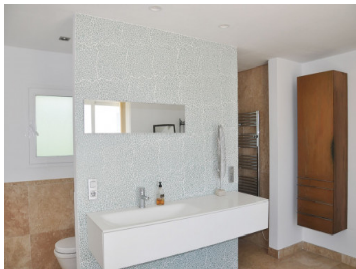
Modern bathroom with shower

All information is correct to the best of our knowledge. Errors and prior sale excepted. This prospectus is purely for information purposes. Only the notarized deed of sale is legally binding.