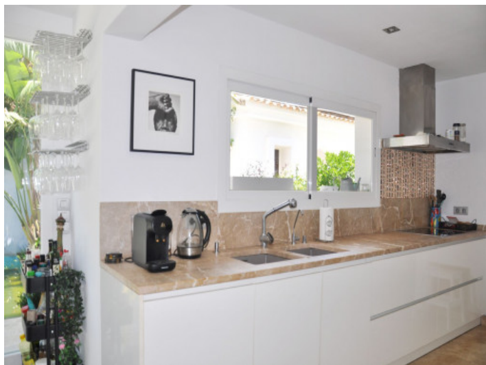
Modern kitchen with open-plan layout