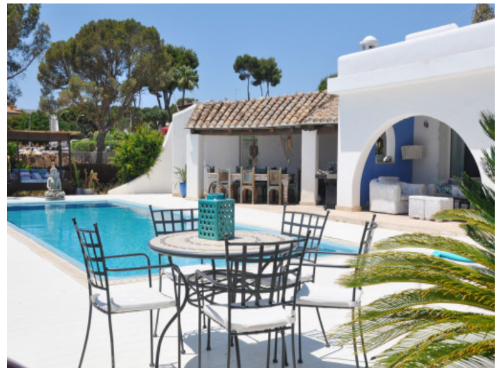
Outdoor area with pool