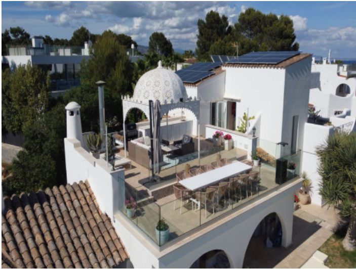
Villa with sea views and Mediterranean architecture