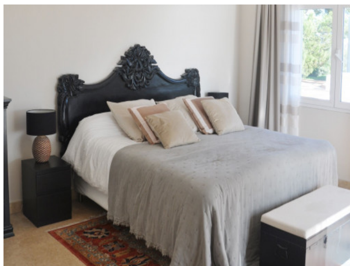
Cozy bedroom with a peaceful atmosphere