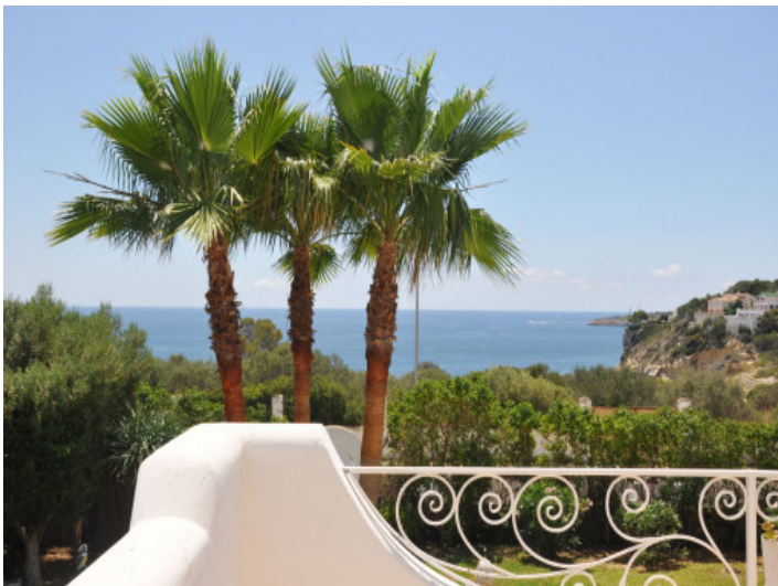
Garden and sea views with pool and plenty of privacy