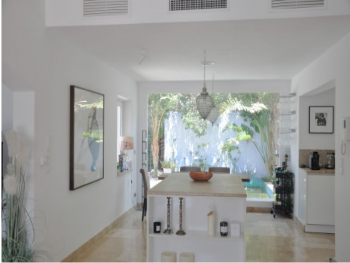
Open plan kitchen and dining area with plenty of natural light