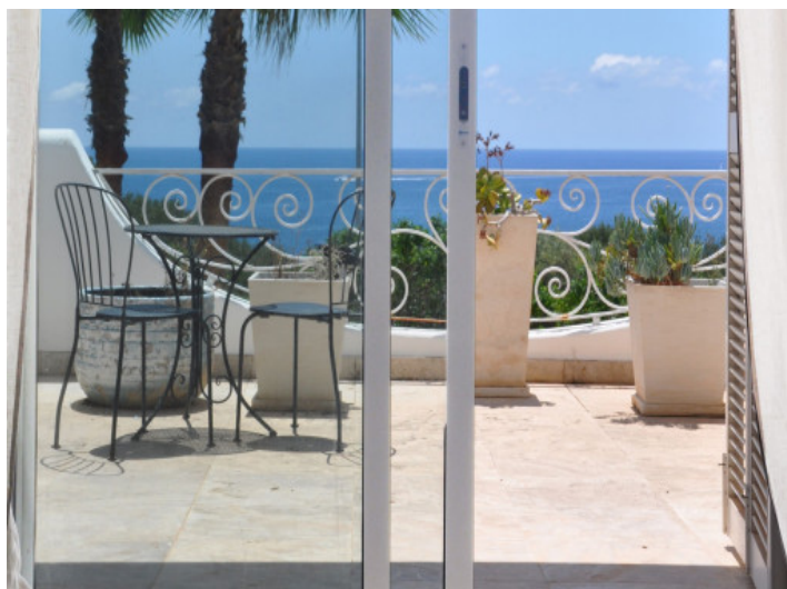
Terrace with sea views and outdoor lounge