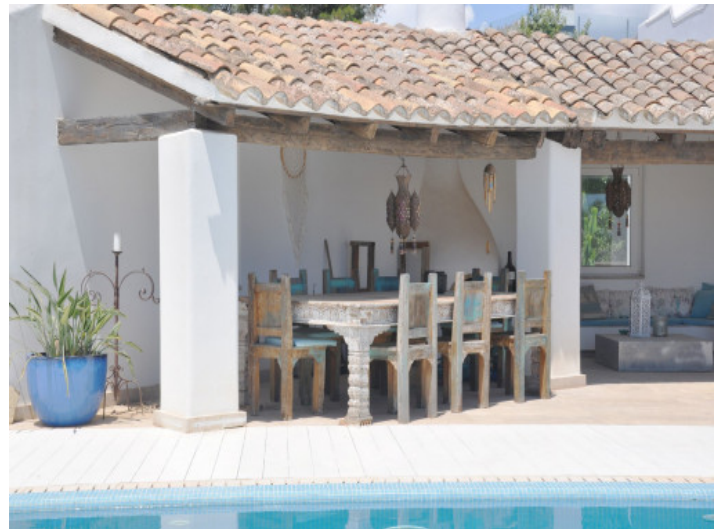
Covered BBQ and outdoor dining area

All information is correct to the best of our knowledge. Errors and prior sale excepted. This prospectus is purely for information purposes. Only the notarized deed of sale is legally binding.