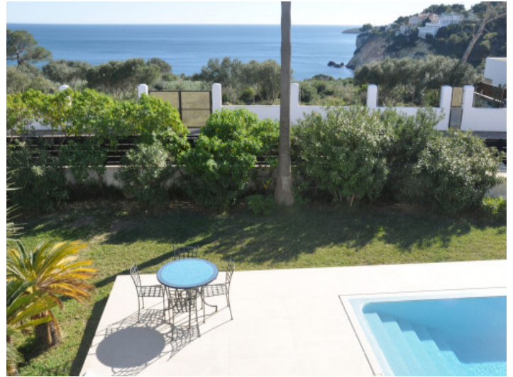
Private saltwater pool with sun terrace