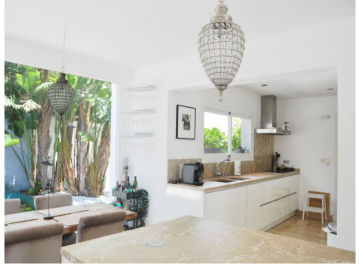
Open plan kitchen and dining area with plenty of natural light