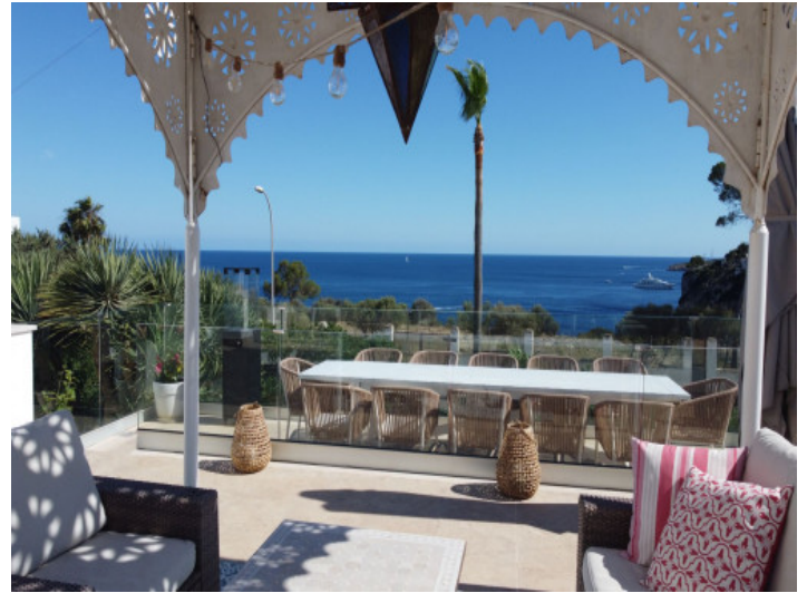
Covered terrace with sea views