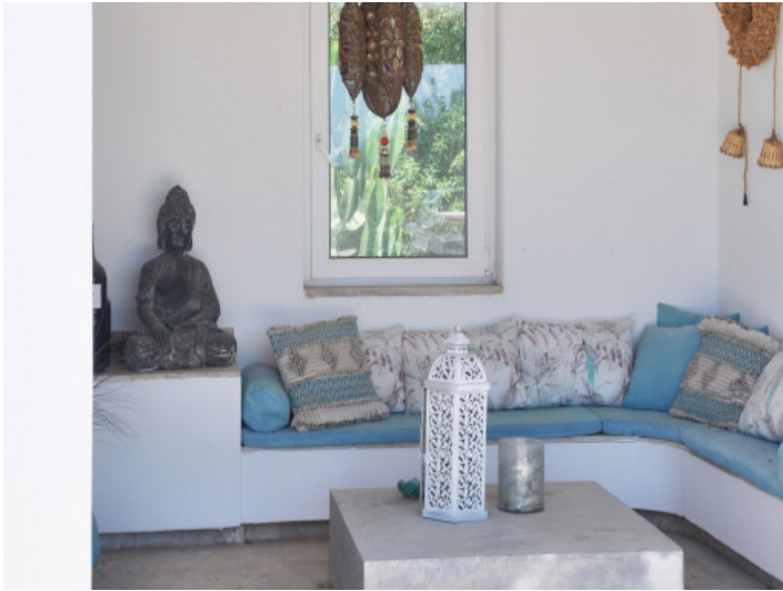
Cozy sitting area in Mediterranean style