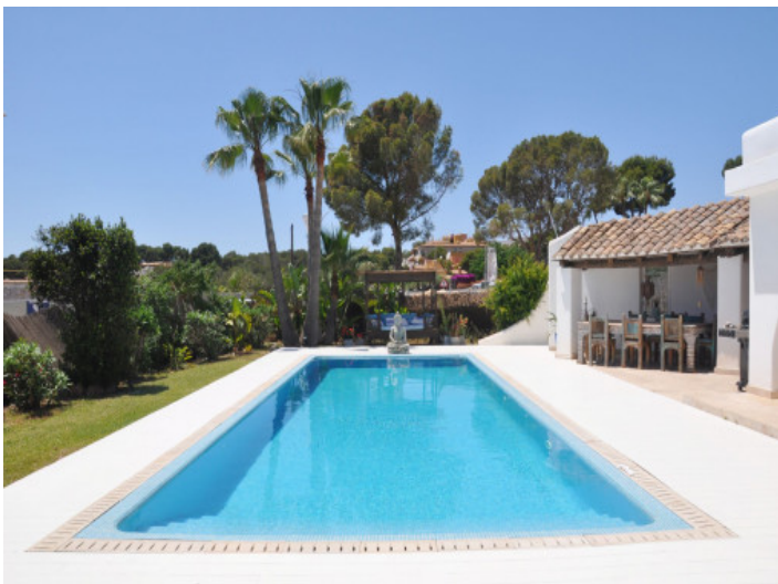
14-metre saltwater pool with sun terrace