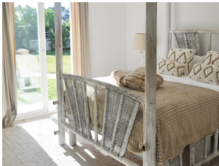
Bedroom with direct access to the terrace