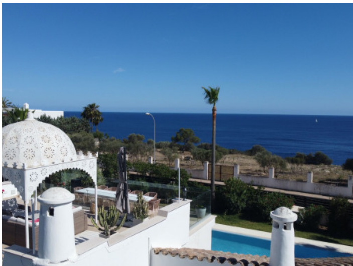
Rooftop terrace with sea views and lounge area