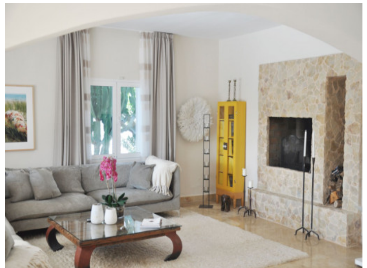
Bright living area with Mediterranean character

All information is correct to the best of our knowledge. Errors and prior sale excepted. This prospectus is purely for information purposes. Only the notarized deed of sale is legally binding.