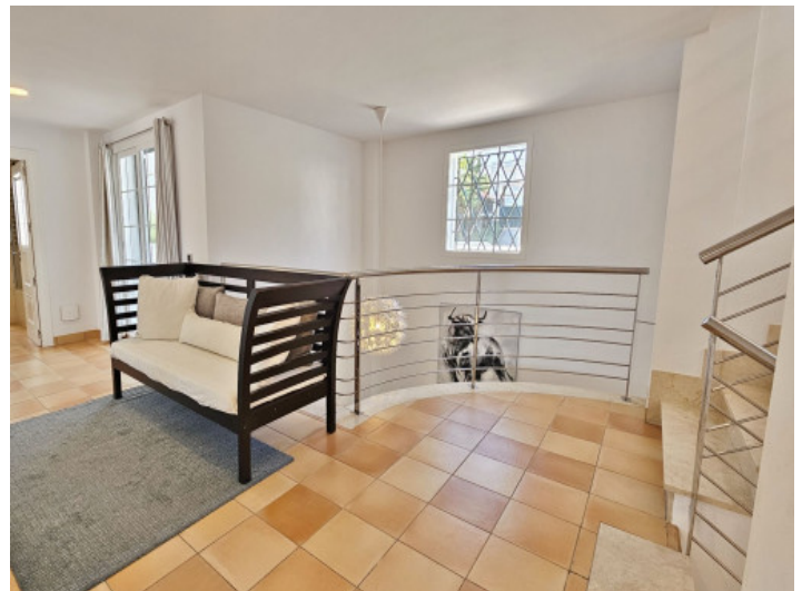
Staircase over three floors