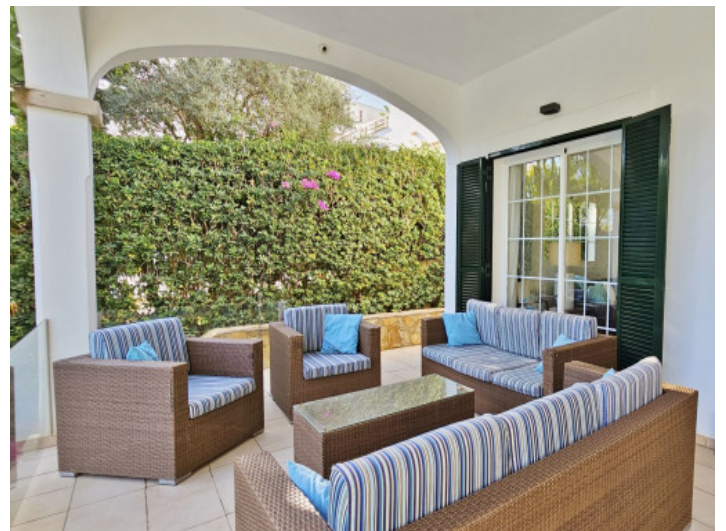
Covered terrace at the house

All information is correct to the best of our knowledge. Errors and prior sale excepted. This prospectus is purely for information purposes. Only the notarized deed of sale is legally binding.