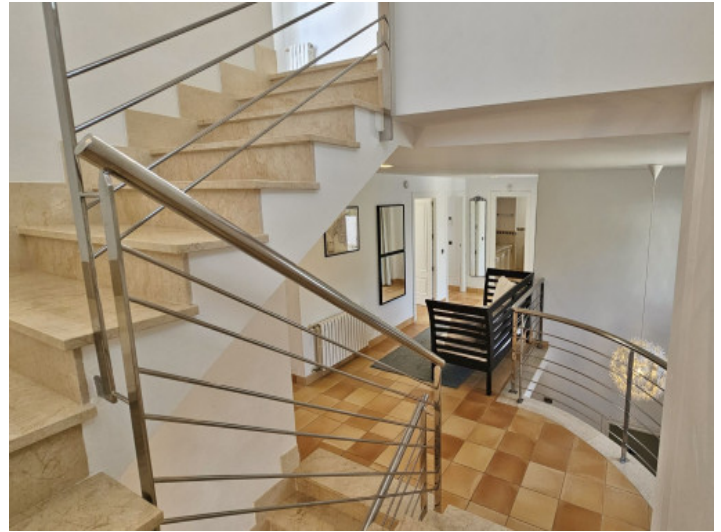
Staircase over three floors