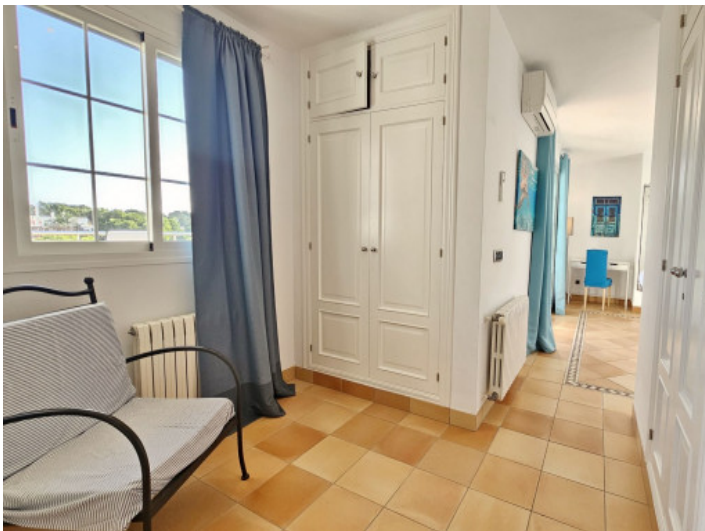
Bedroom on the third floor with balcony and bathroom