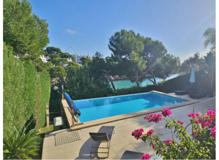
Garden and pool on the seafront