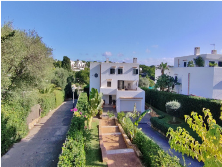
View from the street side