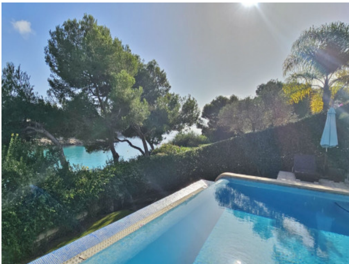
Garden and pool on the seafront