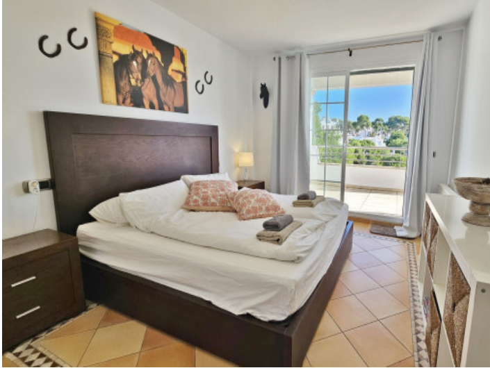
All bedrooms have access to the balcony