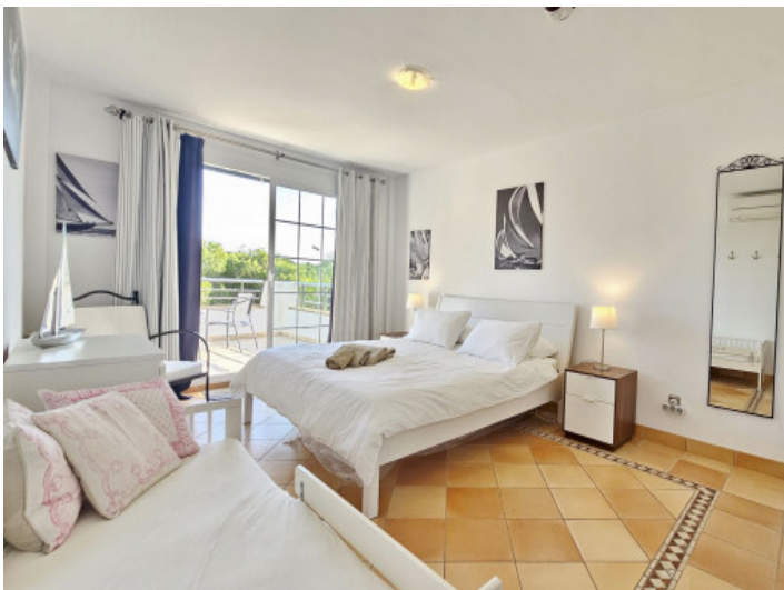
All bedrooms have access to the balcony