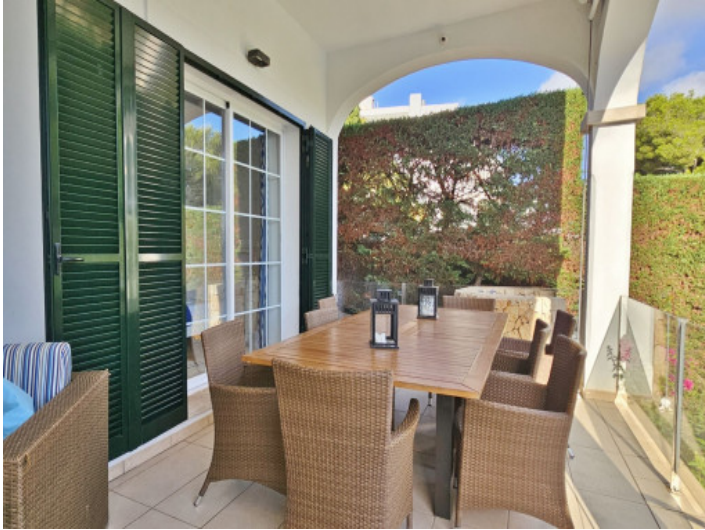
Covered terrace at the house