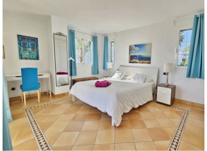
Bedroom on the third floor with balcony and bathroom