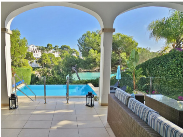
Sea view from the terrace