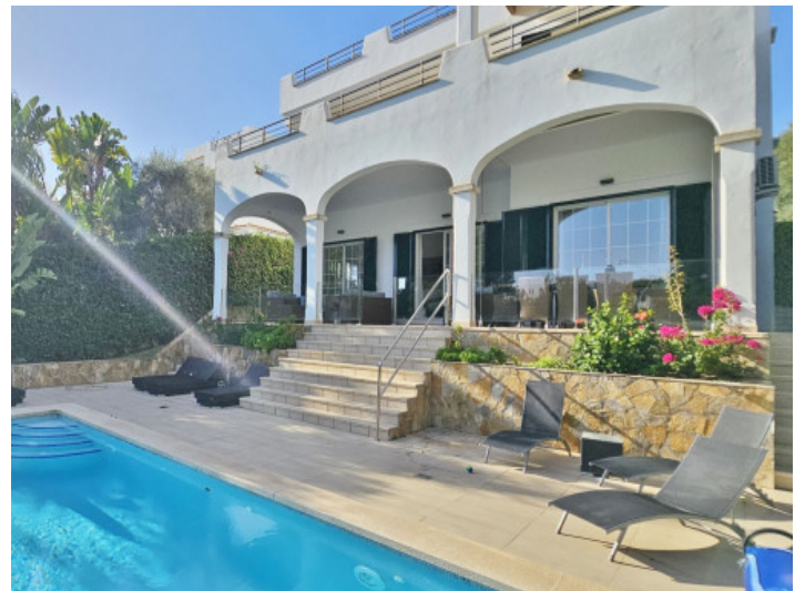
Covered terrace and sun terrace