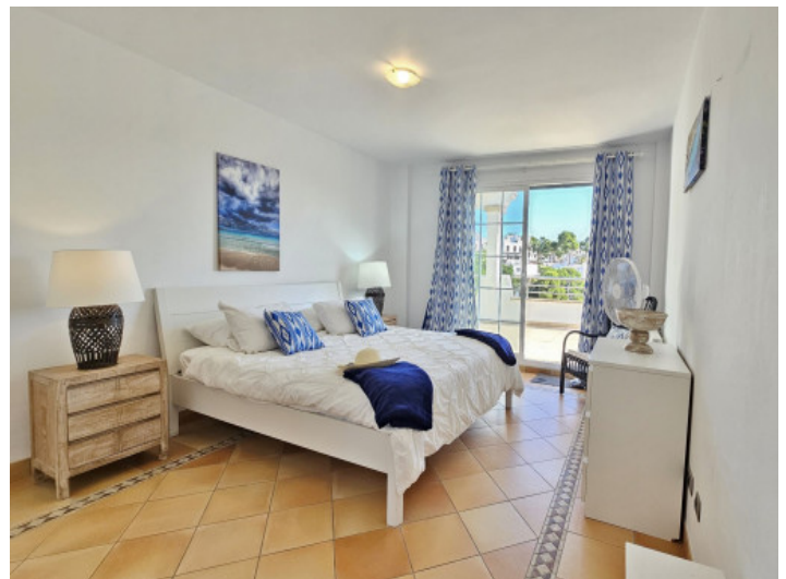
All bedrooms have access to the balcony

All information is correct to the best of our knowledge. Errors and prior sale excepted. This prospectus is purely for information purposes. Only the notarized deed of sale is legally binding.