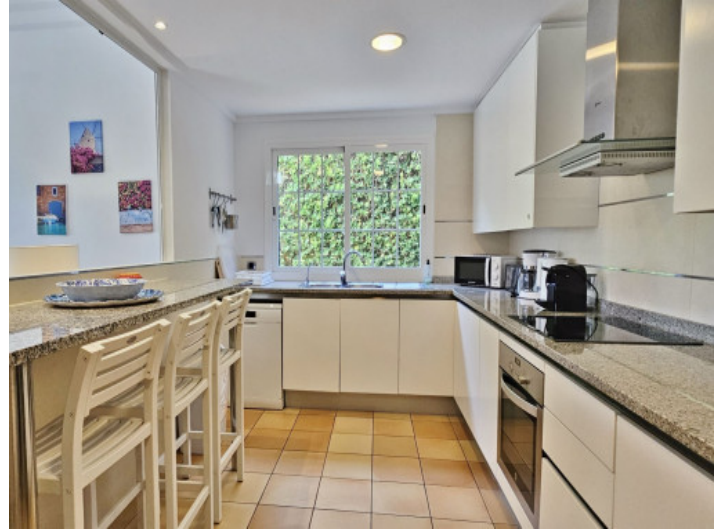
Kitchen with opening to the living area