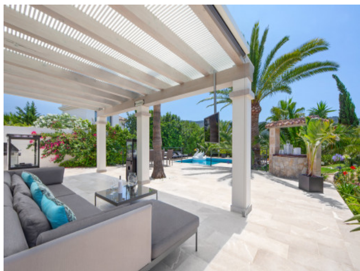
Terrace with pool view