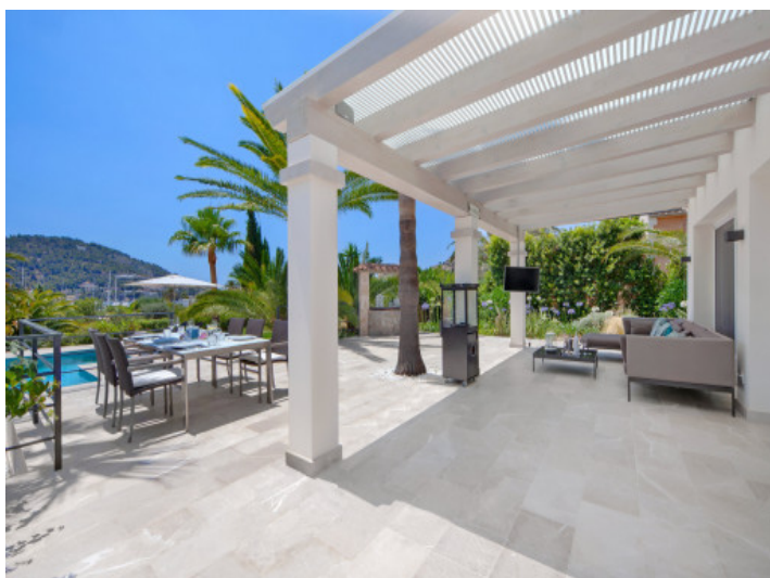
Terrace with pool view