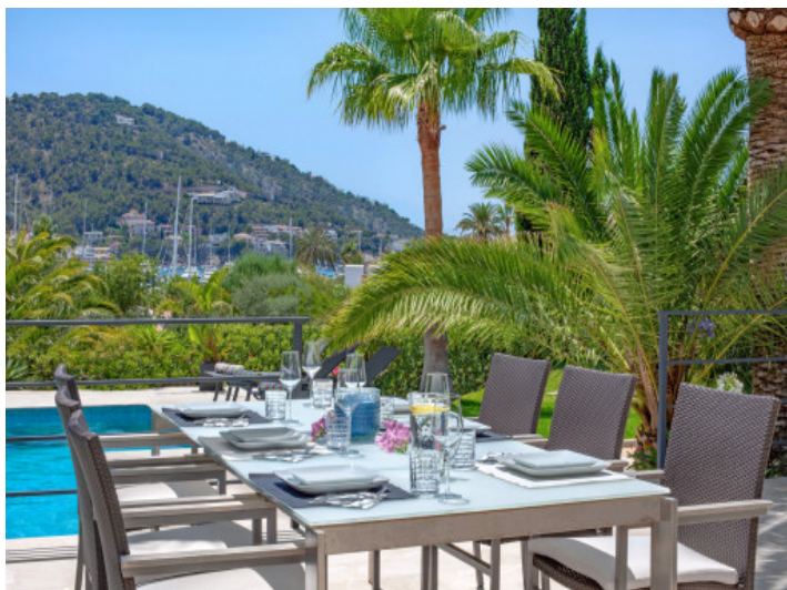
Terrace with pool view