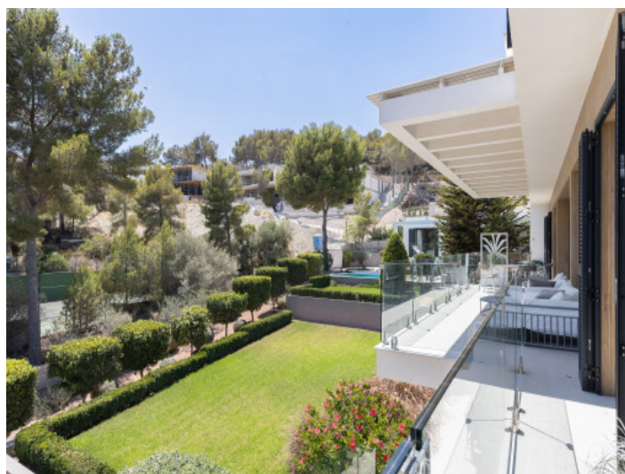
Well maintained garden