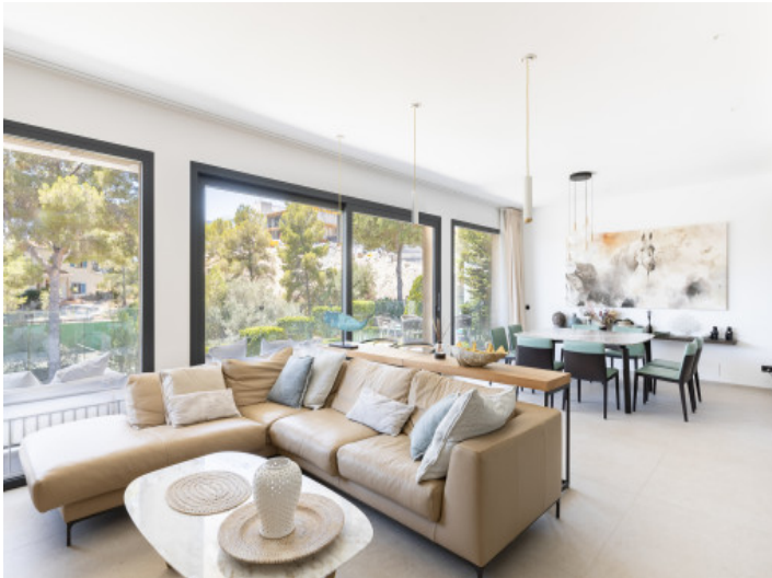
Bright living area with floor to ceiling windows