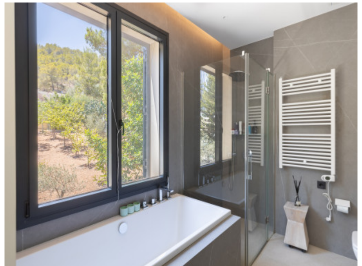
Modern bathroom with bathtub