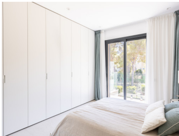
One of the bedrooms with built in wardrobes