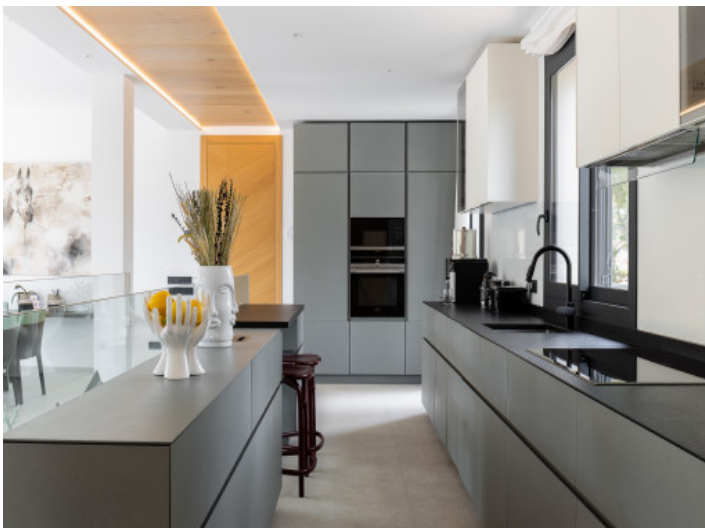
Open designer kitchen