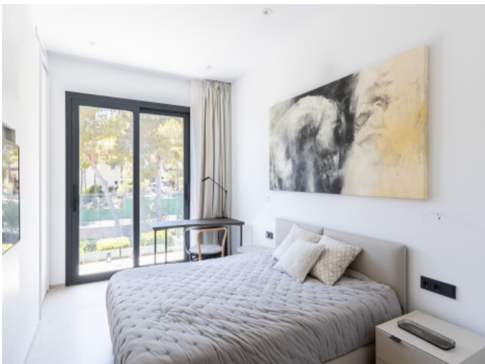
One of the bedrooms