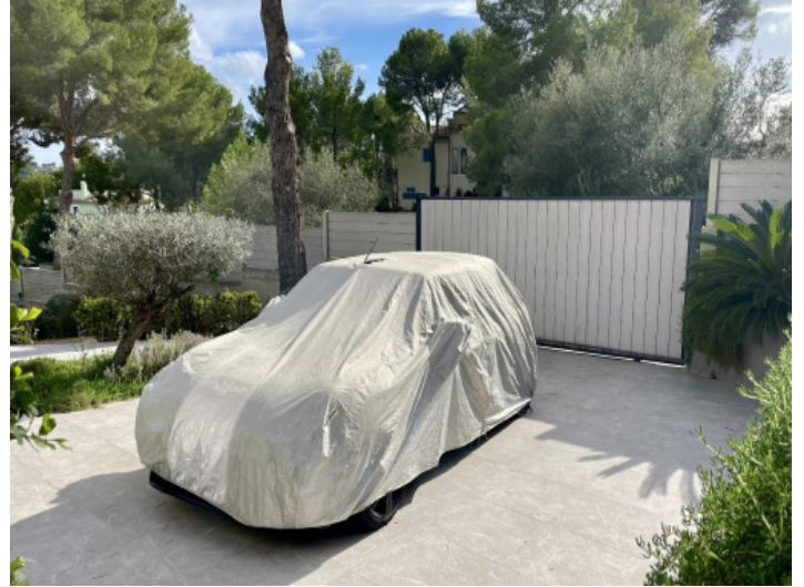
Kitchen living area