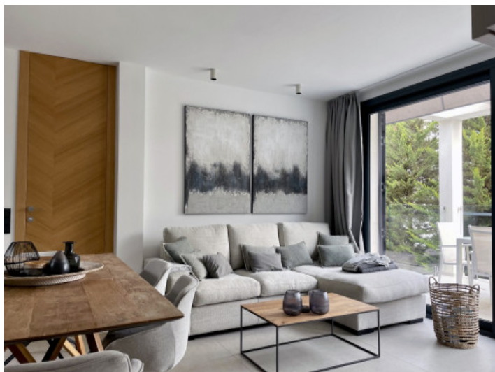
Cozy garden oasis