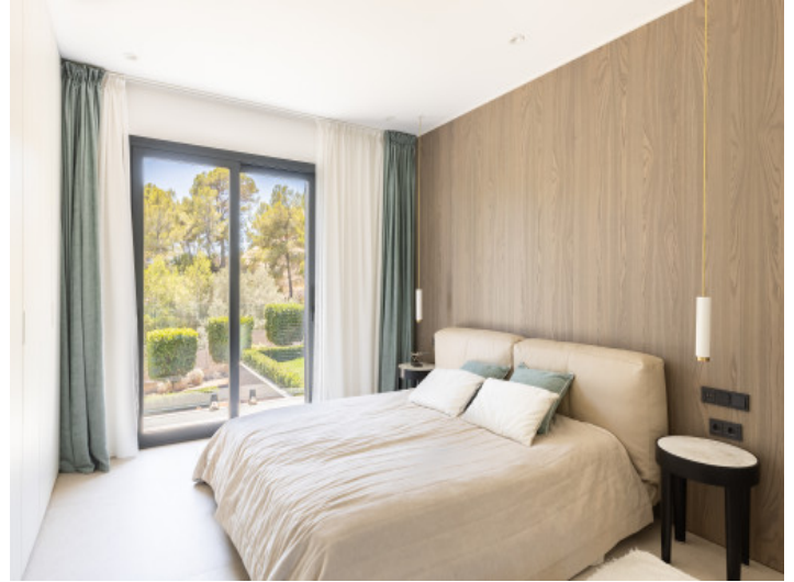
One of the 5 bedrooms in the main house