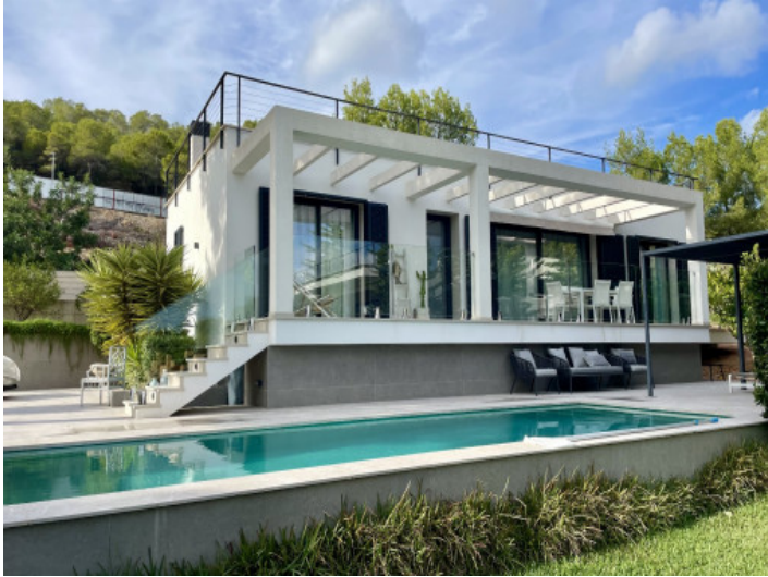
Living dining area