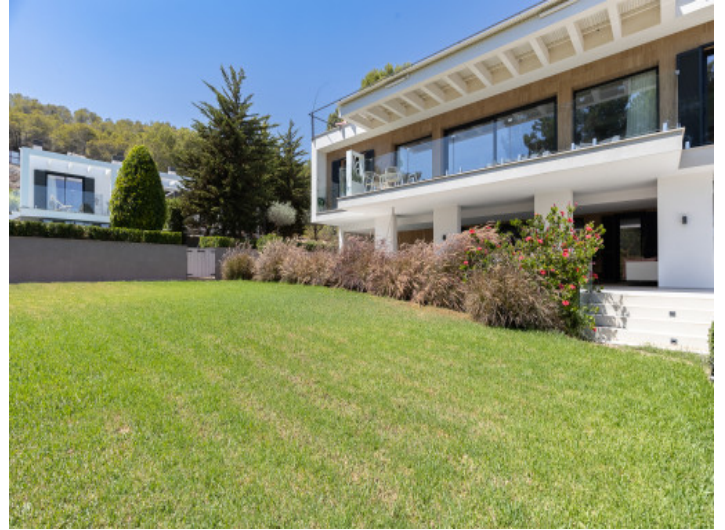
Well maintained garden