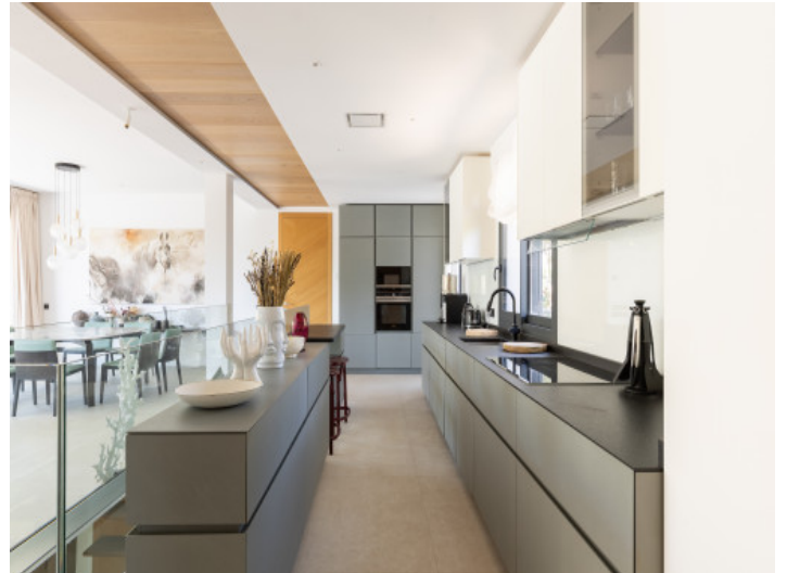
High quality kitchen