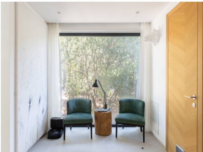
Cozy seating area