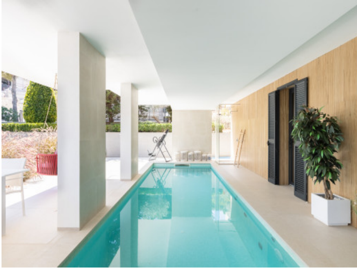
Covered pool main house