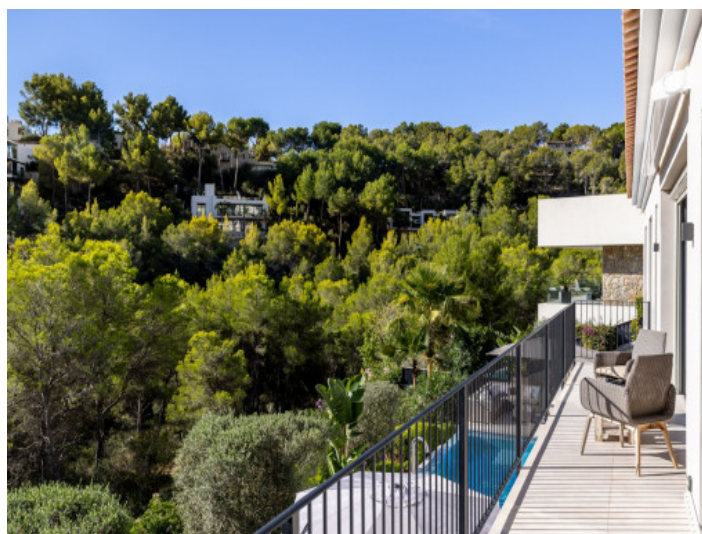
Very nice views