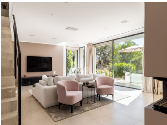
Comfortable living area