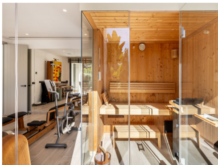
Sauna and fitness area