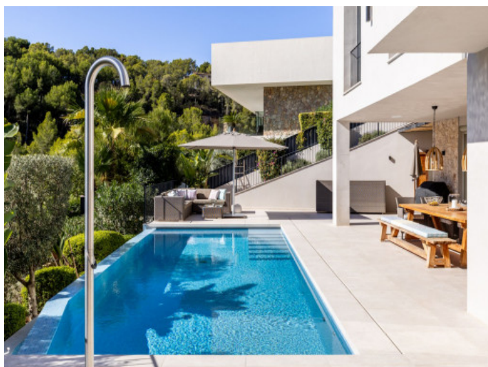
Very nice pool area