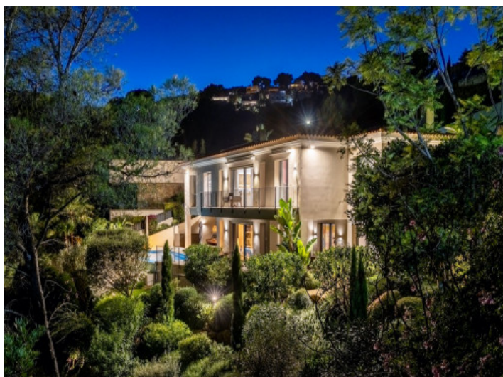
Very well maintained property