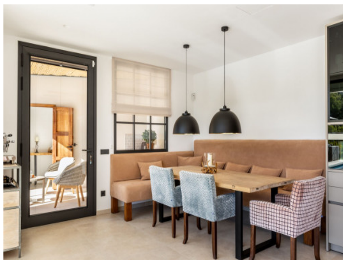
Large dining area