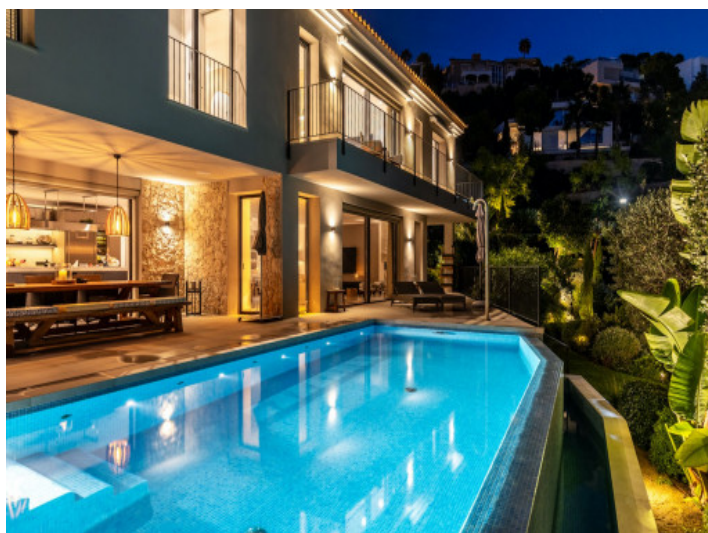
Elegant villa by night