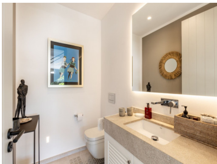
Villa with 3 bathrooms