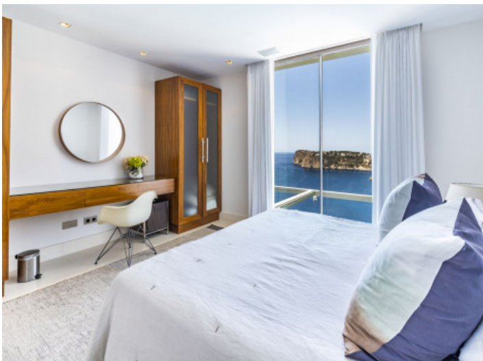
Villa with 4 bedrooms