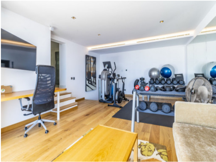
Gym and Spa