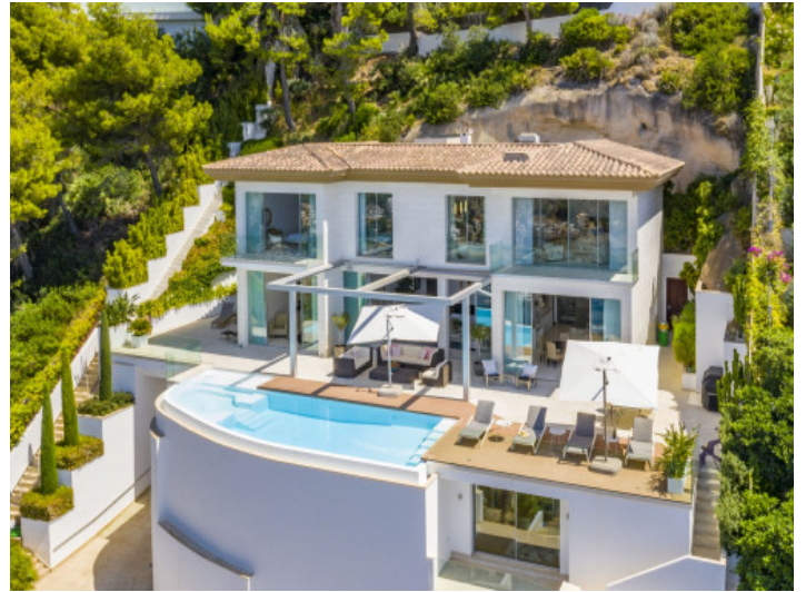
View to the villa