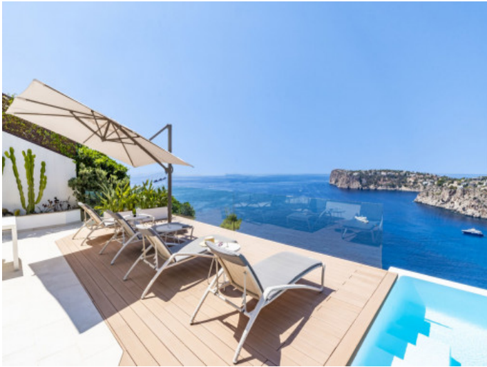
Amazing sea views