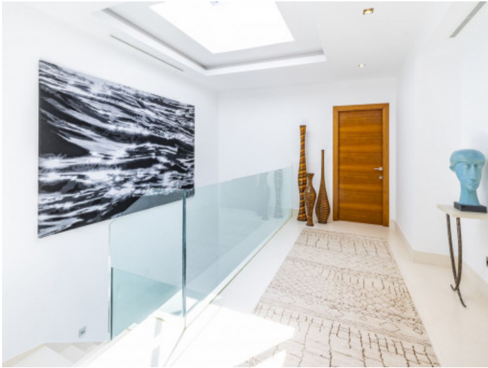
Hallway to mastersuite