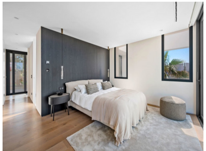
Bedrooms with bathrooms en suite

All information is correct to the best of our knowledge. Errors and prior sale excepted. This prospectus is purely for information purposes. Only the notarized deed of sale is legally binding.