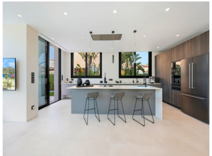
Lots of natural light