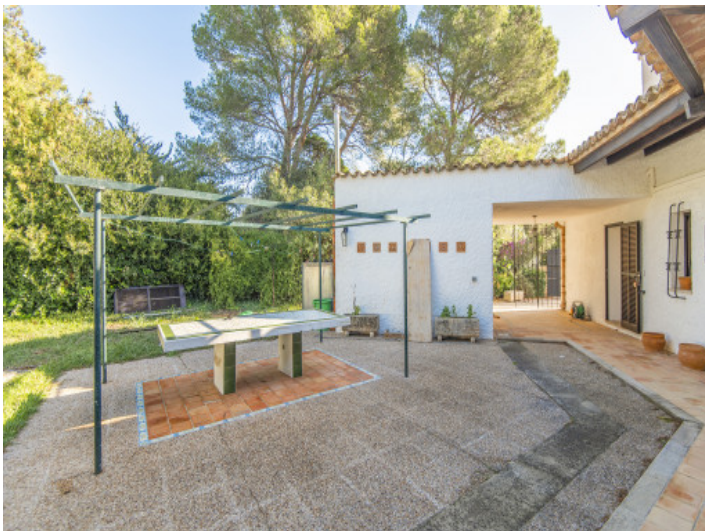
Ping pong area