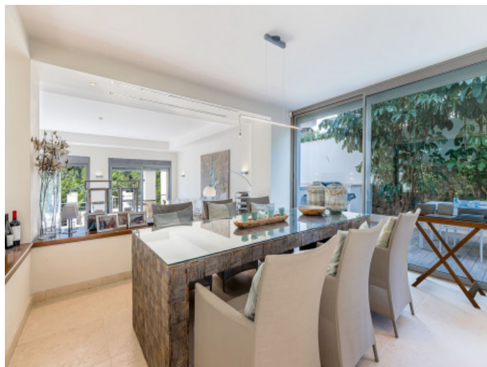
Dining area with terrace access