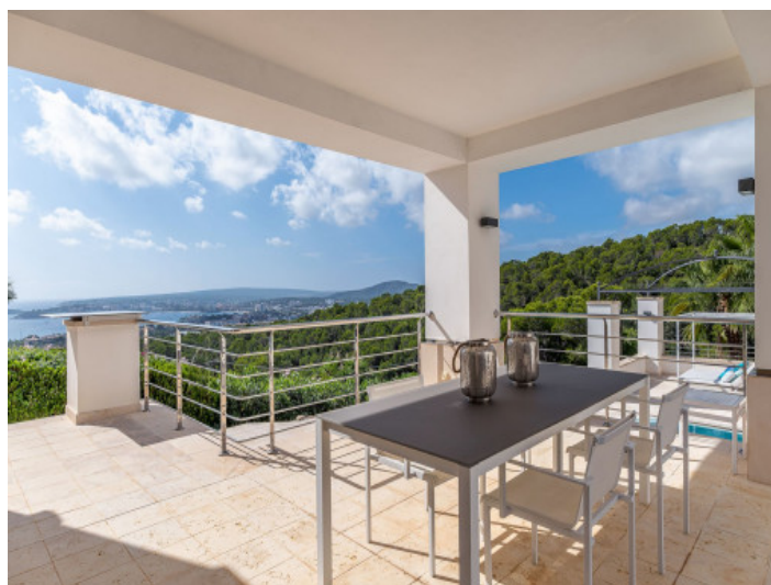
Covered outdoor dining area