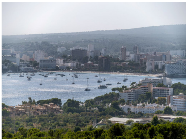
Panorama sea views