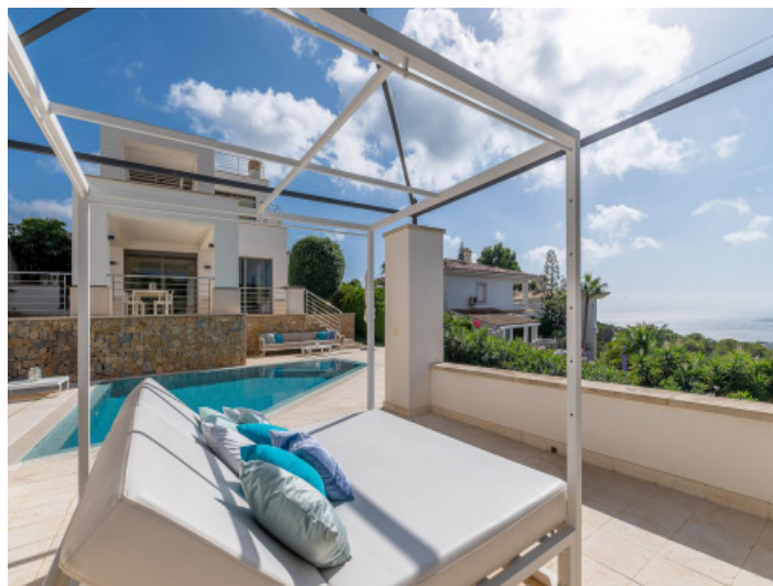
Stunning sun terrace