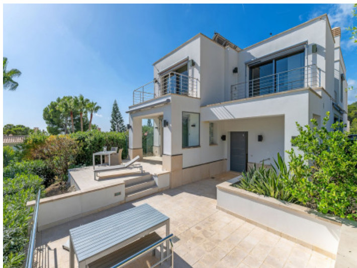
Modern villa with various terraces