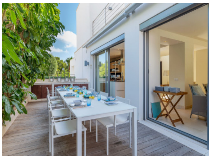
Hidden kitchen terrace