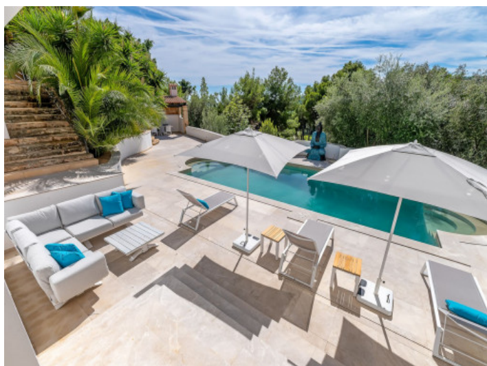
Relaxing pool area