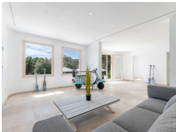
Multifunctional room close to the pool

All information is correct to the best of our knowledge. Errors and prior sale excepted. This prospectus is purely for information purposes. Only the notarized deed of sale is legally binding.