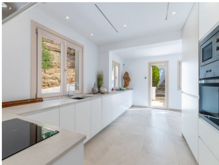
Modern quality kitchen