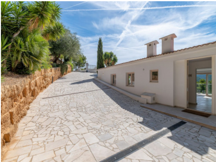
Entrance way and facade

All information is correct to the best of our knowledge. Errors and prior sale excepted. This prospectus is purely for information purposes. Only the notarized deed of sale is legally binding.