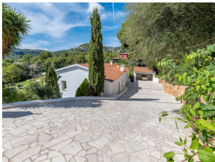
Entrance way to this little gem

All information is correct to the best of our knowledge. Errors and prior sale excepted. This prospectus is purely for information purposes. Only the notarized deed of sale is legally binding.