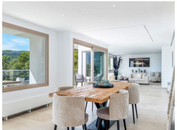
Sunny living and dining area