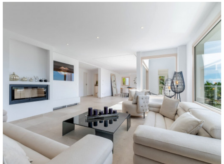
Comfortable living area with fireplace

All information is correct to the best of our knowledge. Errors and prior sale excepted. This prospectus is purely for information purposes. Only the notarized deed of sale is legally binding.