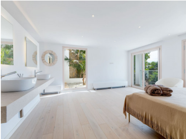
Bedroom with bathroom en suite