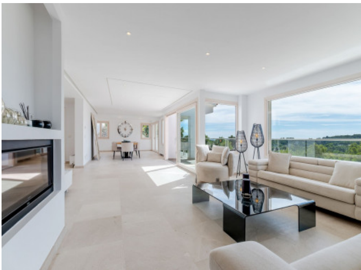
Cozy living area with views