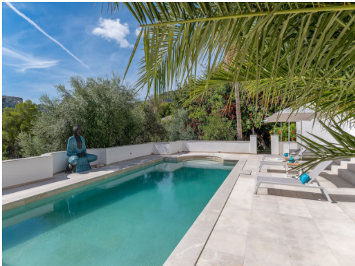
Large saltwater pool