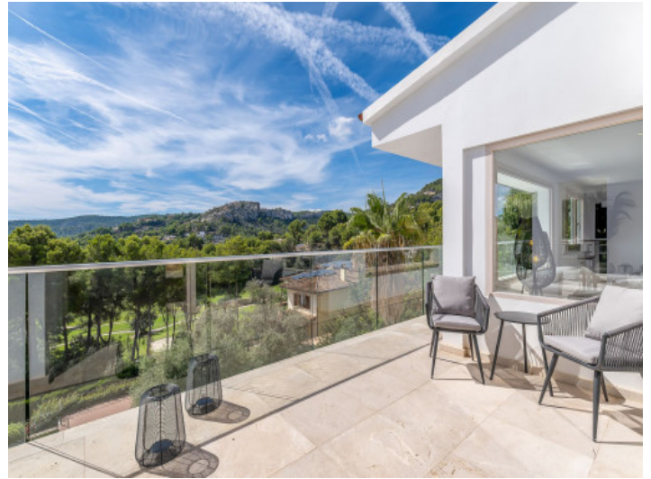
Amazing views over the green