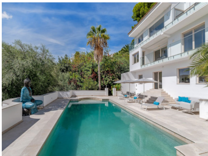
The beautiful villa in prime location