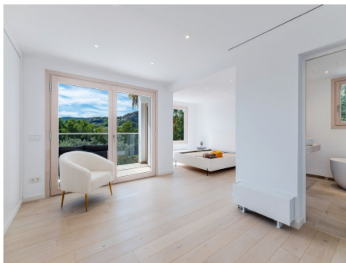
Another elegant bedroom