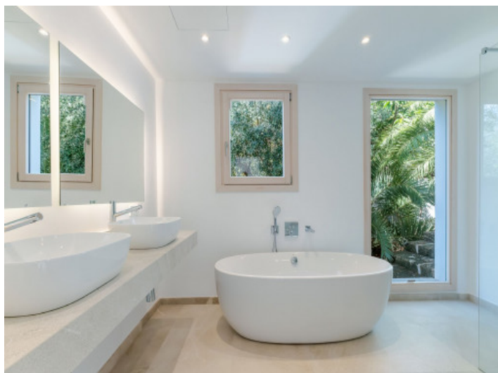
High quality sanitary facilities