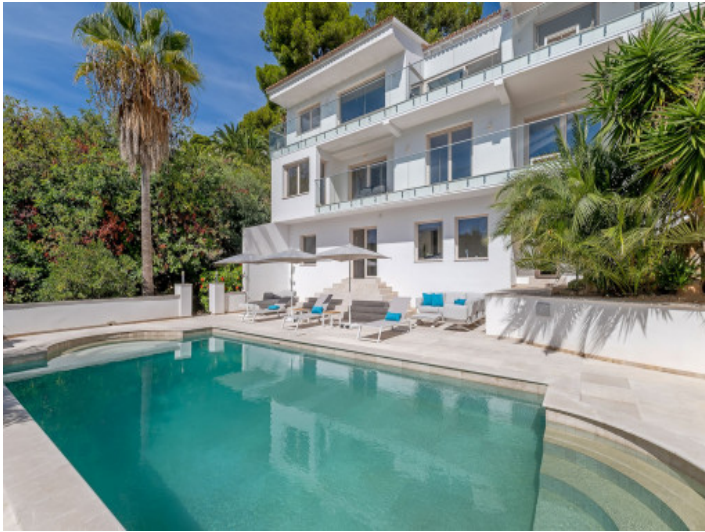
Beautiful pool area