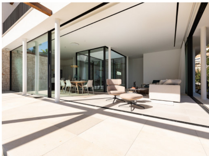
Views from the exterior to the interior

All information is correct to the best of our knowledge. Errors and prior sale excepted. This prospectus is purely for information purposes. Only the notarized deed of sale is legally binding.