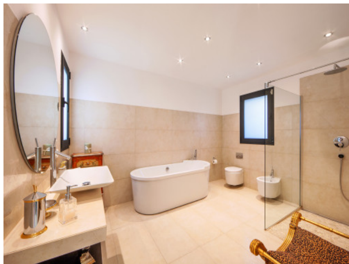
Bathroom with shower and bathtub