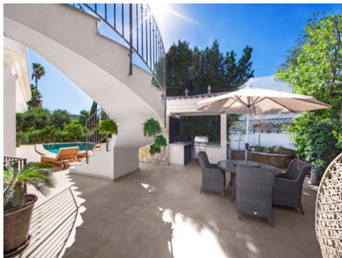
Gorgeous terrace with summer kitchen