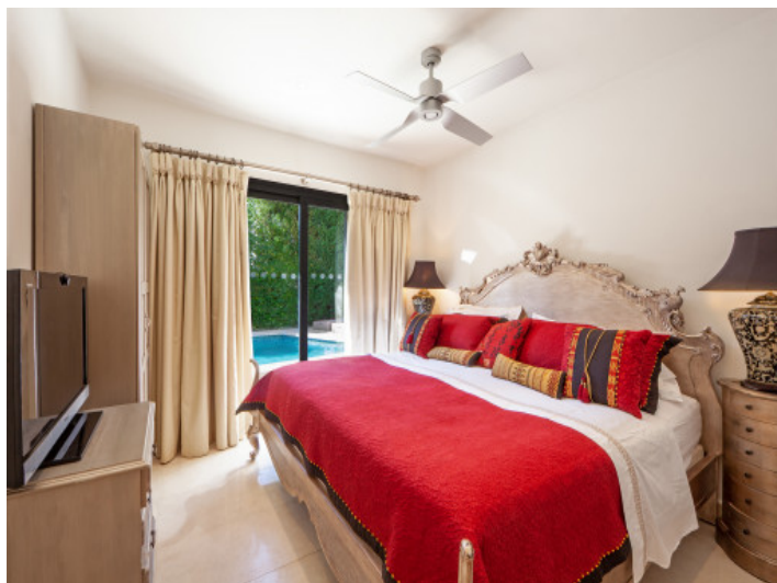
Bedroom with double bed and pool views