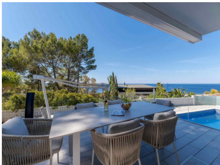
Terrace and pool area