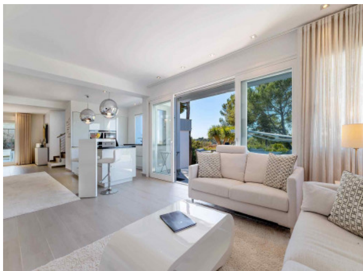
Open kitchen and living area