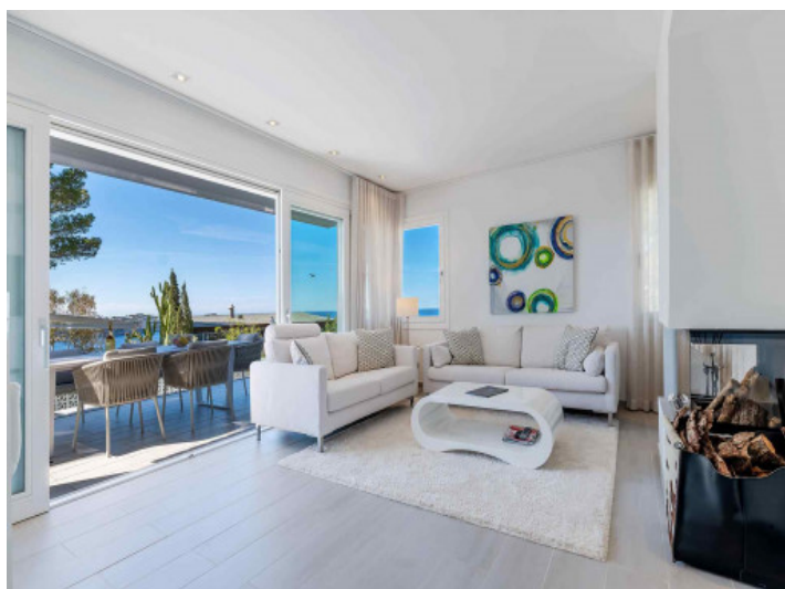
Living area with terrace