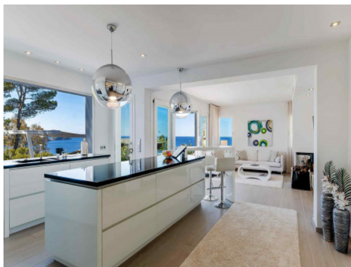
Open kitchen and living area