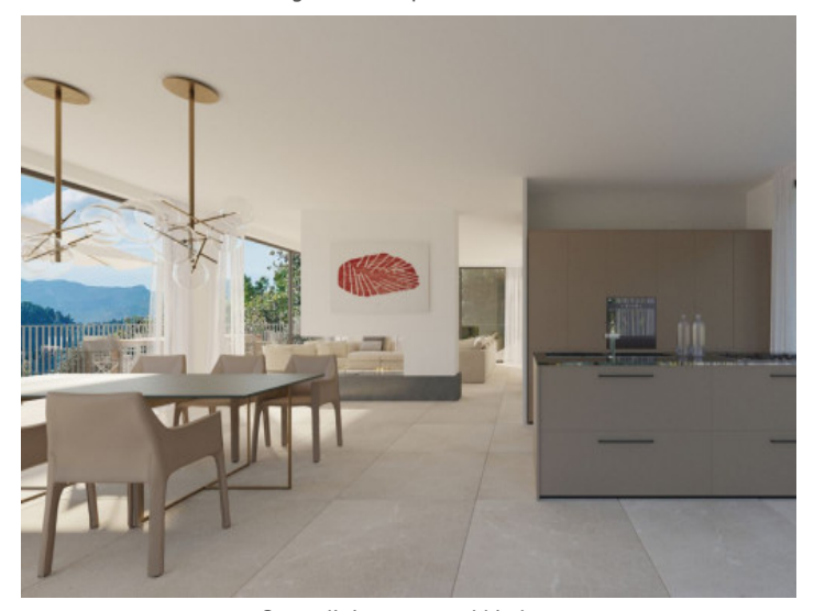
Open dining area and kitchen