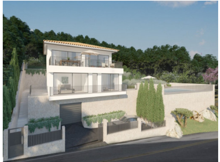
Exterior view from the street