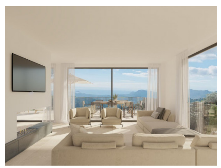
Living area with panorama views