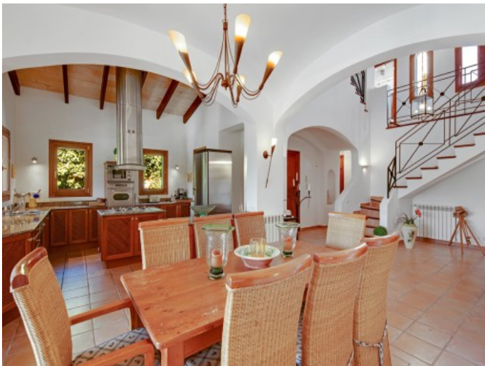
View to the entrance area