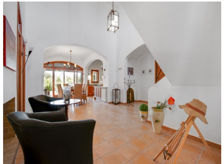
Open entrance and living area