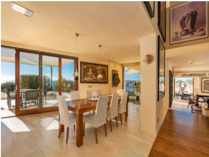
Light flooded dining area