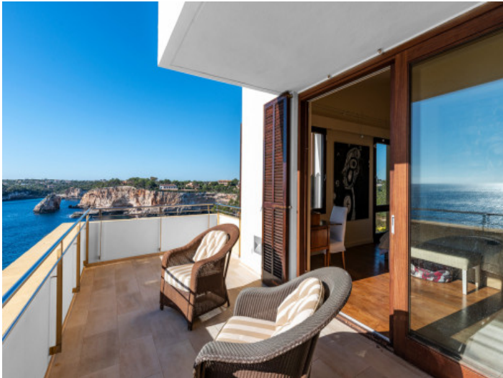
Private terrace of the master bedroom