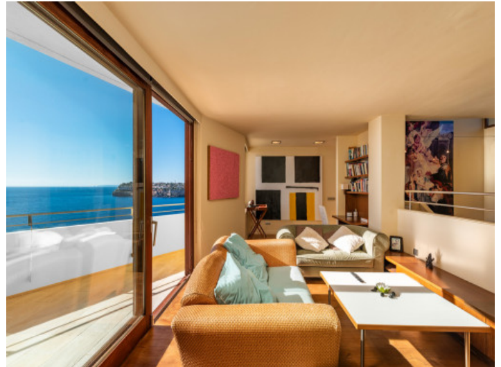
Upper living area