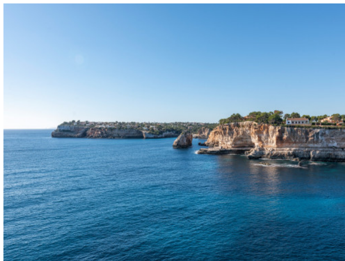
View of the surroundings