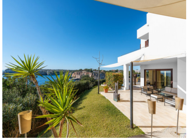
Garden and terrace of the villa