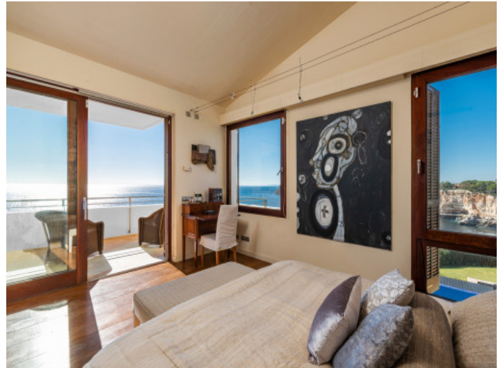
Master bedroom with bathroom e suite