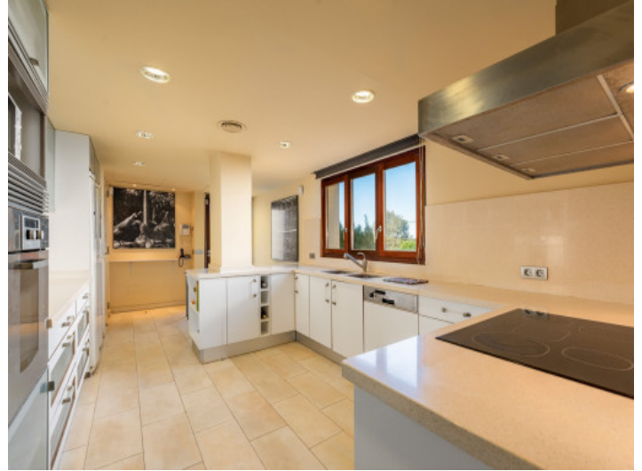
Fully equipped kitchen in white