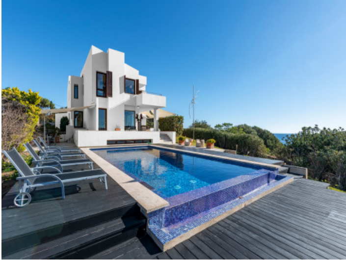
Exterior view and pool area