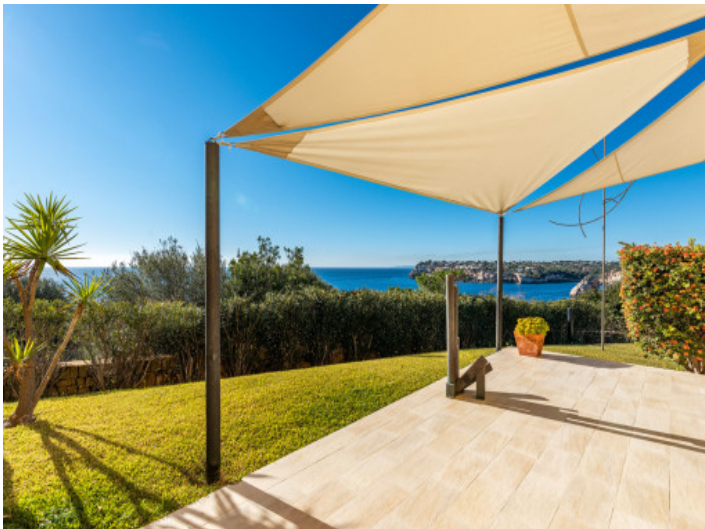
View of the garden