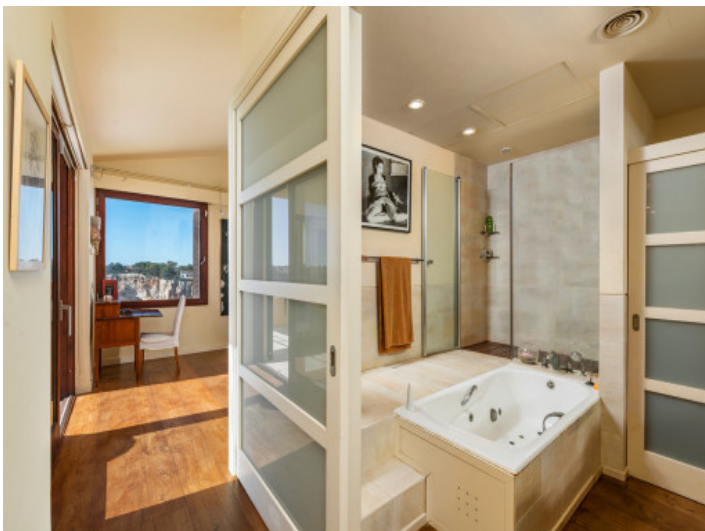
View of the bathroom en suite