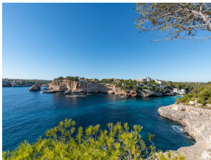
View of the surroundings

All information is correct to the best of our knowledge. Errors and prior sale excepted. This prospectus is purely for information purposes. Only the notarized deed of sale is legally binding.