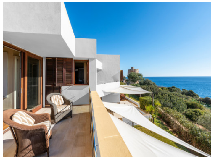
Alternative view of the private balcony

All information is correct to the best of our knowledge. Errors and prior sale excepted. This prospectus is purely for information purposes. Only the notarized deed of sale is legally binding.