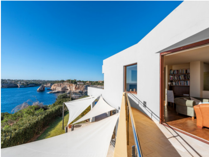
Balcony of the upper living area