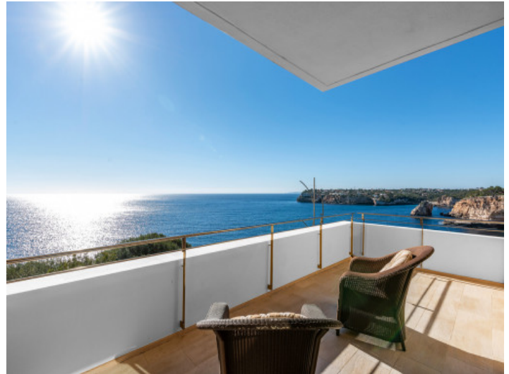
View from the upper balcony