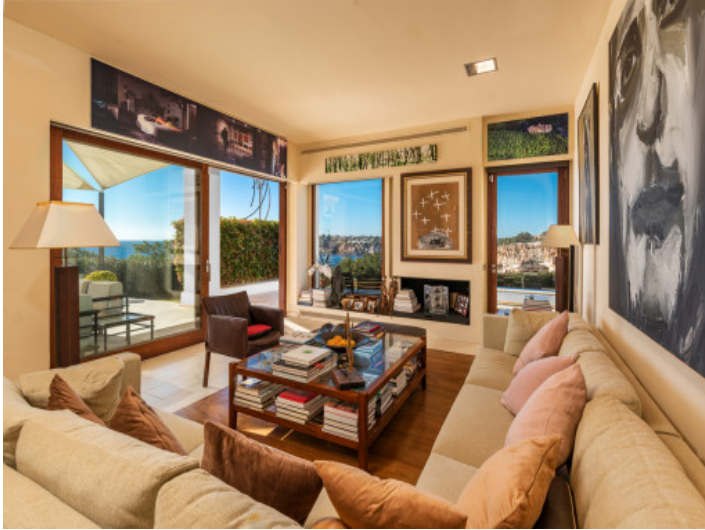
Access to the terrace