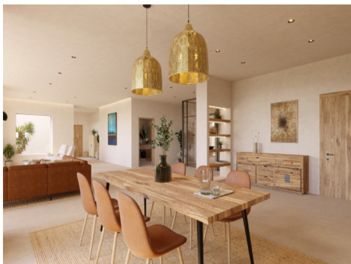
Visualisations Inside and outside