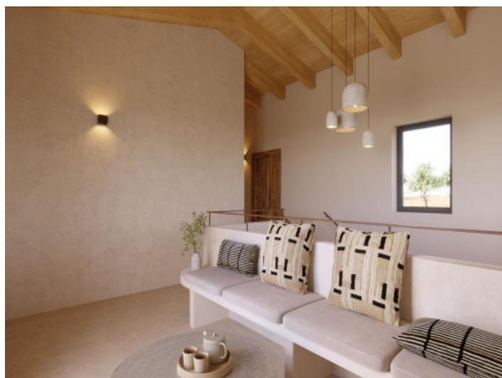
Visualications Inside and outside