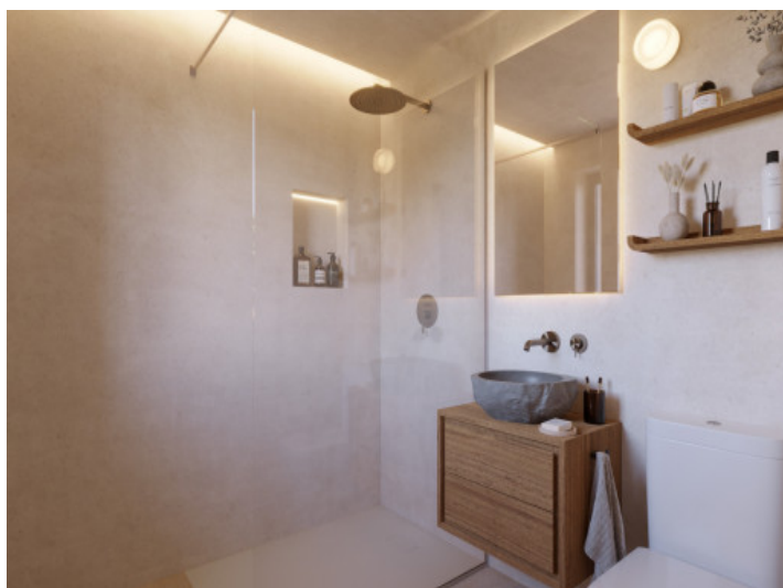
Visualications Inside and outside