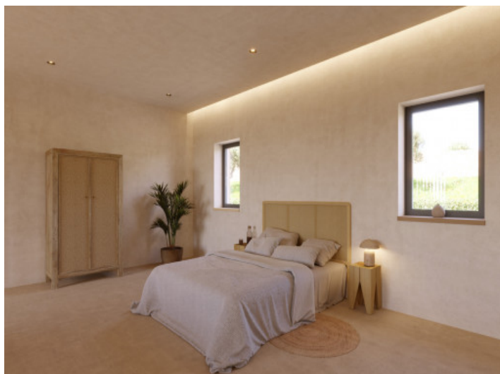
Visualisations Inside and outside