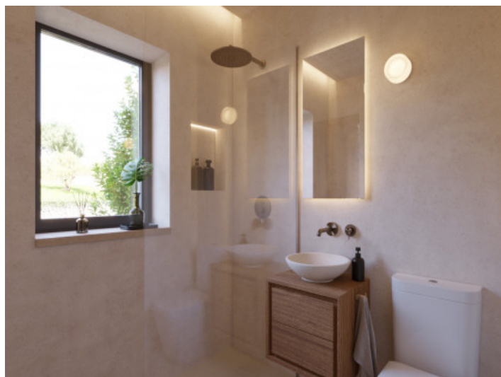
Visualications Inside and outside

All information is correct to the best of our knowledge. Errors and prior sale excepted. This prospectus is purely for information purposes. Only the notarized deed of sale is legally binding.