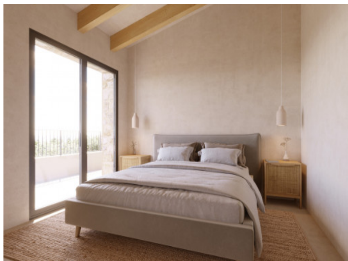
Visualications Inside and outside

All information is correct to the best of our knowledge. Errors and prior sale excepted. This prospectus is purely for information purposes. Only the notarized deed of sale is legally binding.