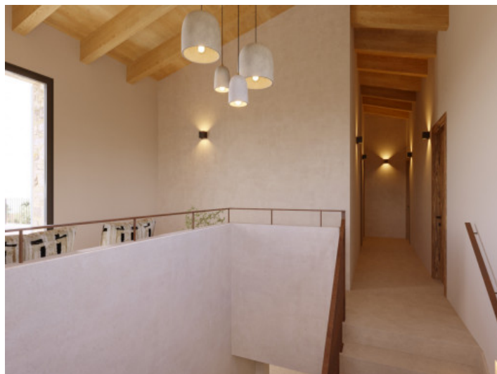
Visualications Inside and outside