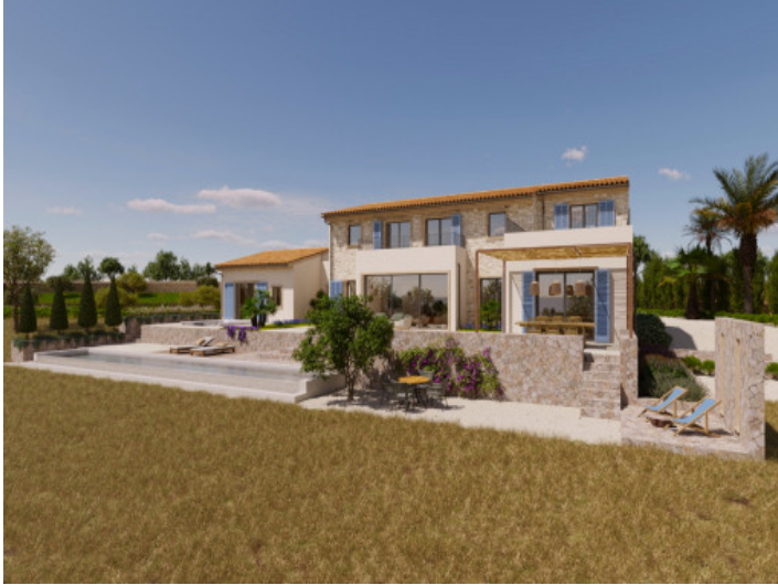
Visualisations Inside and outside