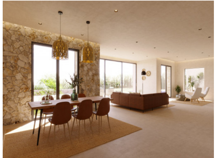
Visualisations Inside and outside