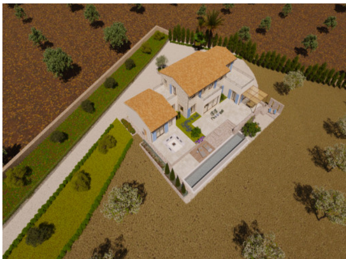
Visualisations Inside and outside