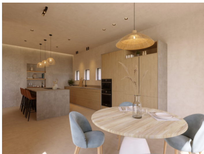
Visualisations Inside and outside