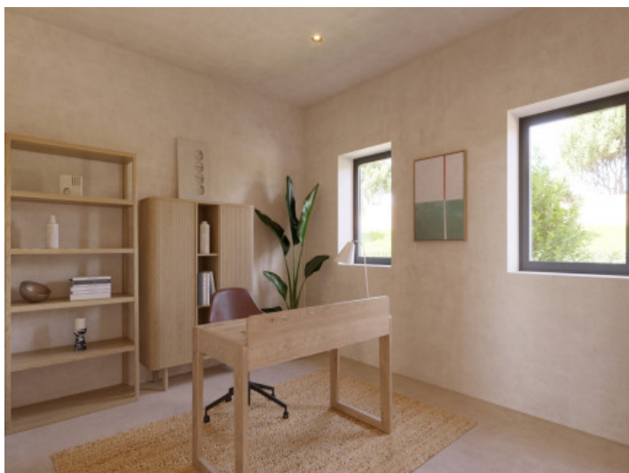
Visualications Inside and outside