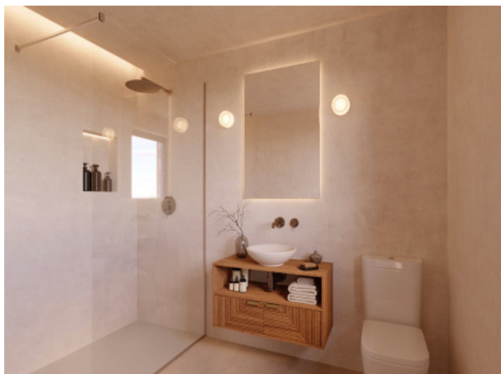
Visualications Inside and outside