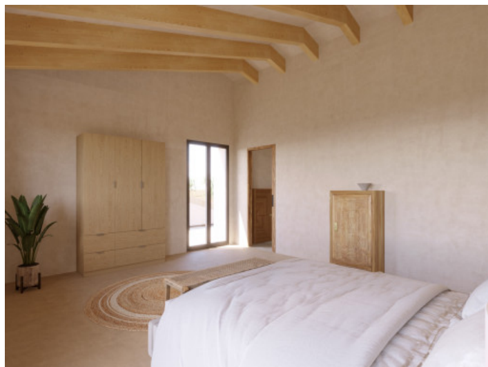
Visualications Inside and outside