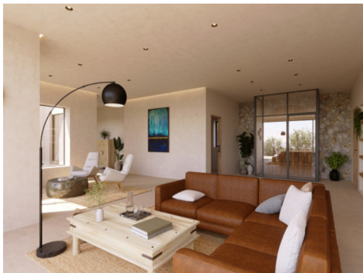
Visualisations Inside and outside