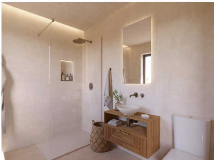
Visualications Inside and outside