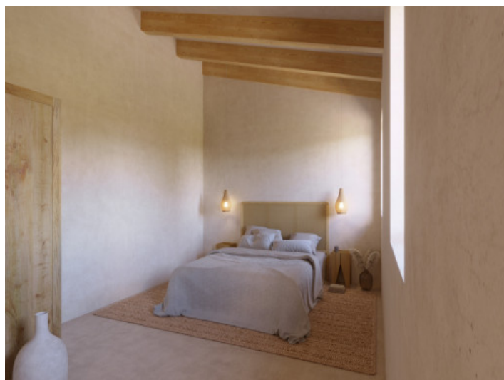
Visualications Inside and outside