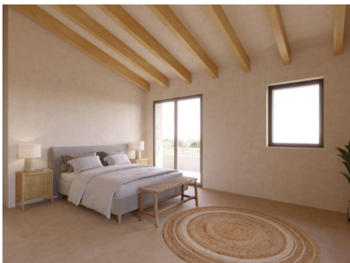
Visualications Inside and outside