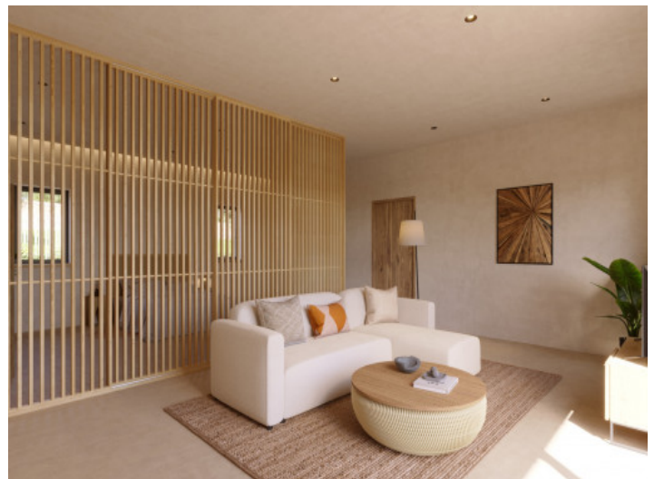
Visualisations Inside and outside

All information is correct to the best of our knowledge. Errors and prior sale excepted. This prospectus is purely for information purposes. Only the notarized deed of sale is legally binding.