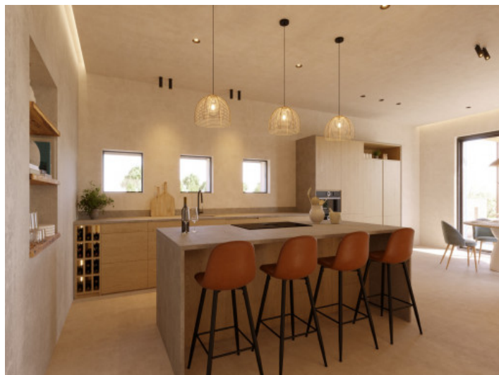
Visualisations Inside and outside