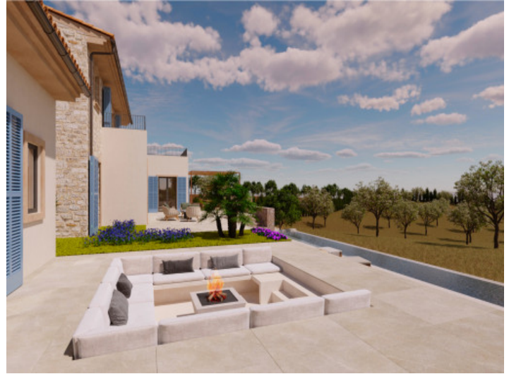
Visualisations Inside and outside