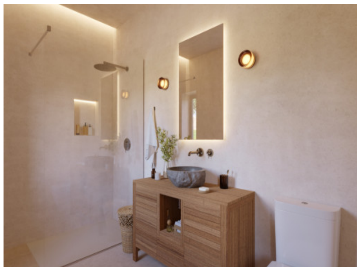
Visualisations Inside and outside

All information is correct to the best of our knowledge. Errors and prior sale excepted. This prospectus is purely for information purposes. Only the notarized deed of sale is legally binding.