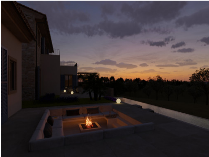
Visualisations Inside and outside