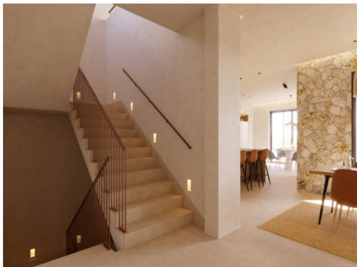
Visualications Inside and outside