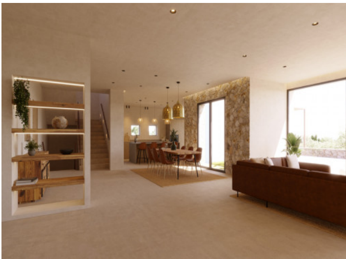
Visualisations Inside and outside