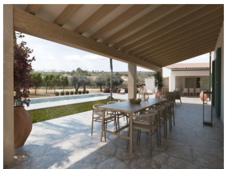
Finca project with pool