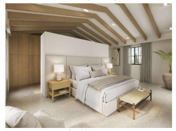
One of 4 bedrooms