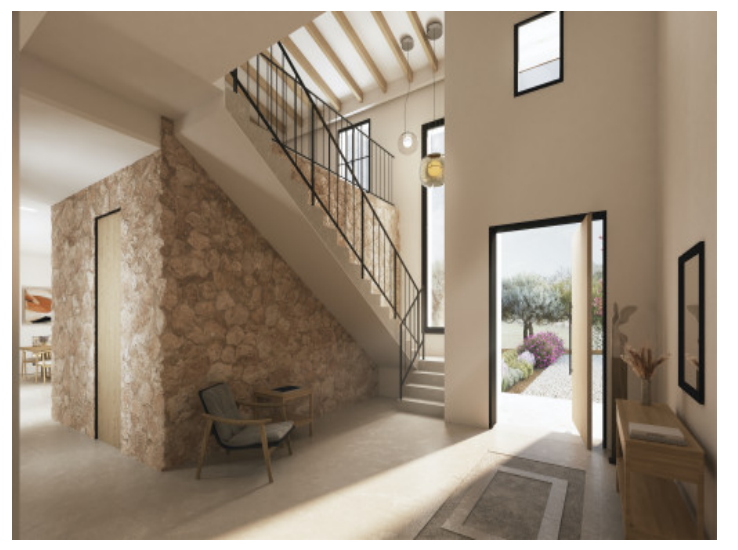
Entrance area with high ceiling

All information is correct to the best of our knowledge. Errors and prior sale excepted. This prospectus is purely for information purposes. Only the notarized deed of sale is legally binding.