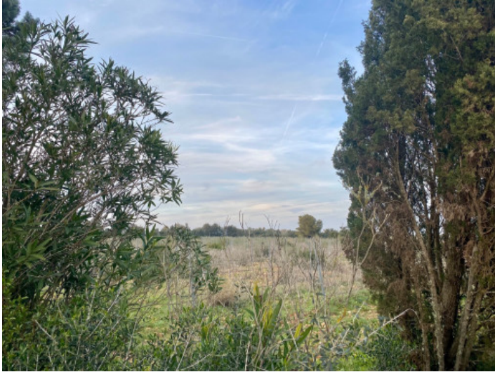
Plot with vineyards