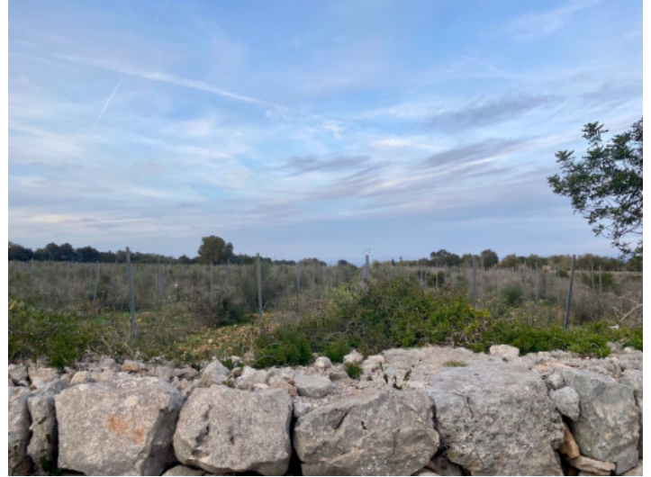
Plot with wonderful views