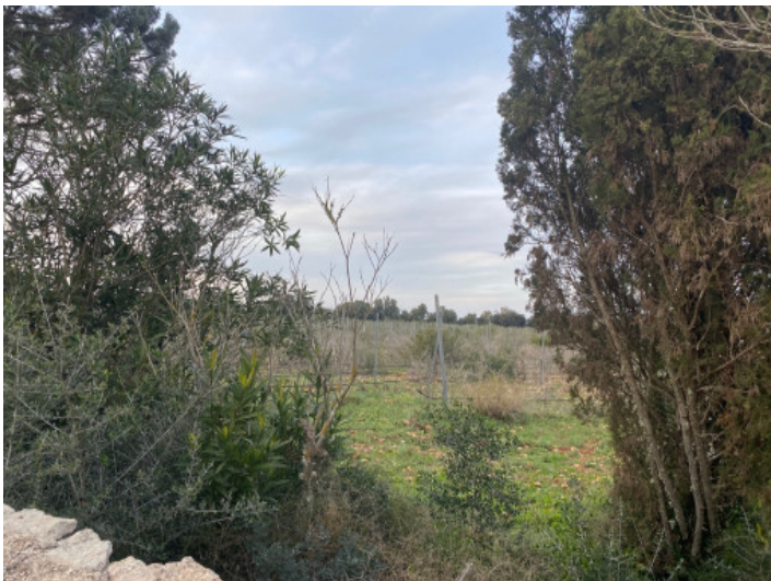
Plot with views of the countryside

All information is correct to the best of our knowledge. Errors and prior sale excepted. This prospectus is purely for information purposes. Only the notarized deed of sale is legally binding.